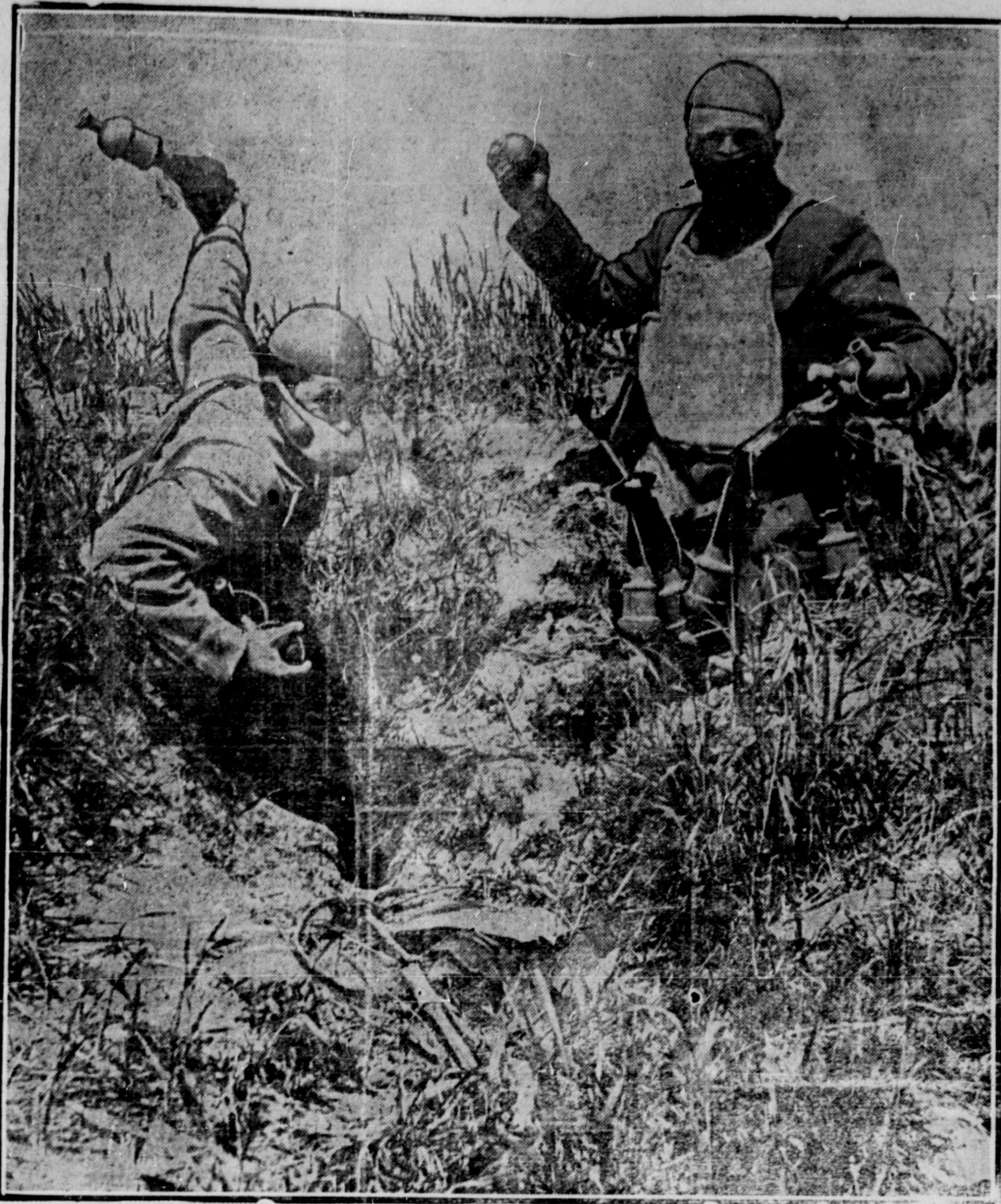
FRENCH GRENADE THROWERS WELL PROTECTED AGAINST SHRAPNEL AND GAS. A special mask preventing the inhaling of gas along with a steel helmet and a bullet proof waistcoat, makes

up the protection a French grenade thrower wears. The picture shows Frenchmen in the act of throwing the deadly grenade against the enemy's lines.