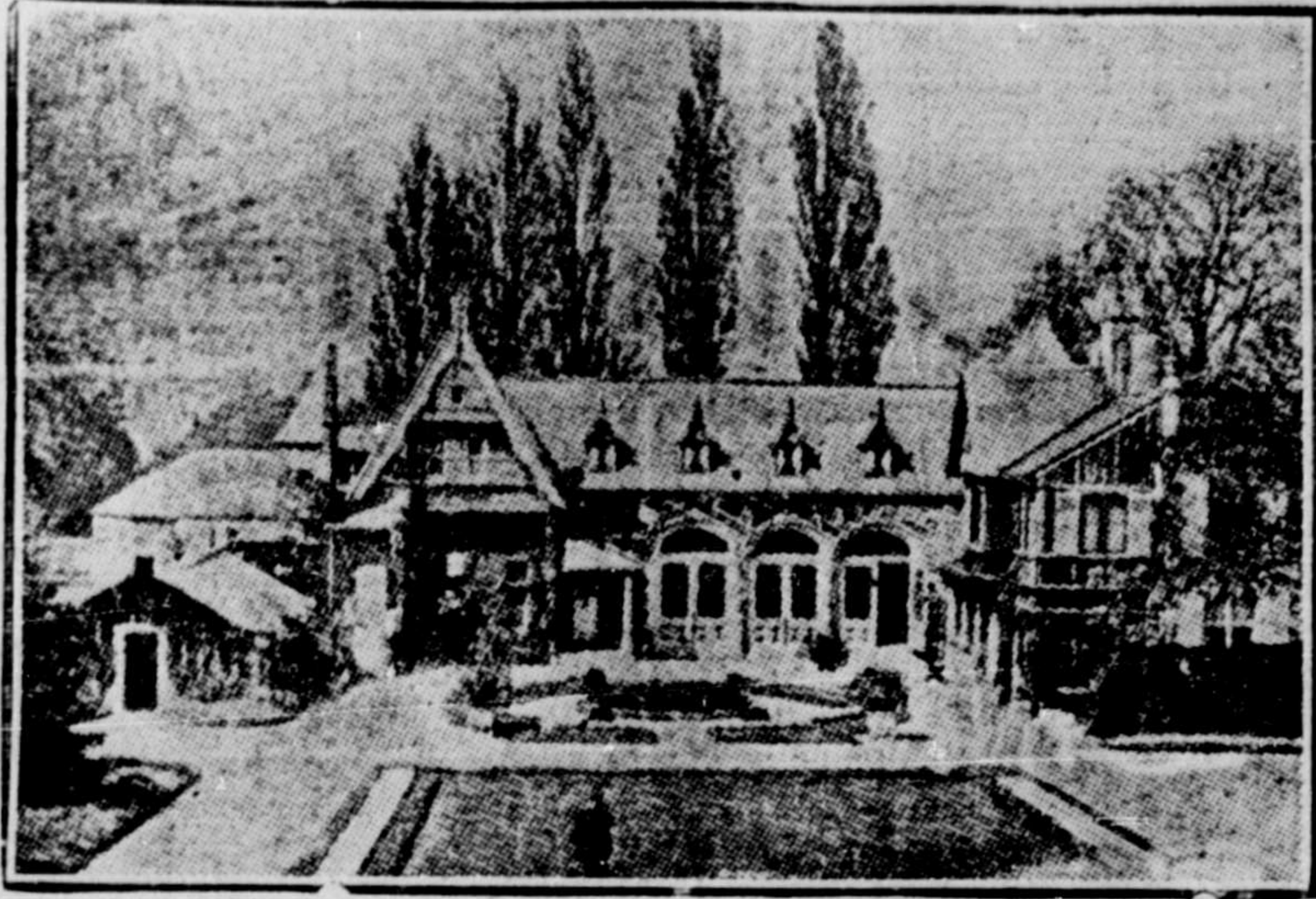
CHATEAU OF HOOZE SOUTHEAST OF YPRES

F. W. Dowling, Observer. Barometer ..... 29.889 Maximum temperature ..... 75 Minimum temperature ..... 54 Rainfall ..... .01