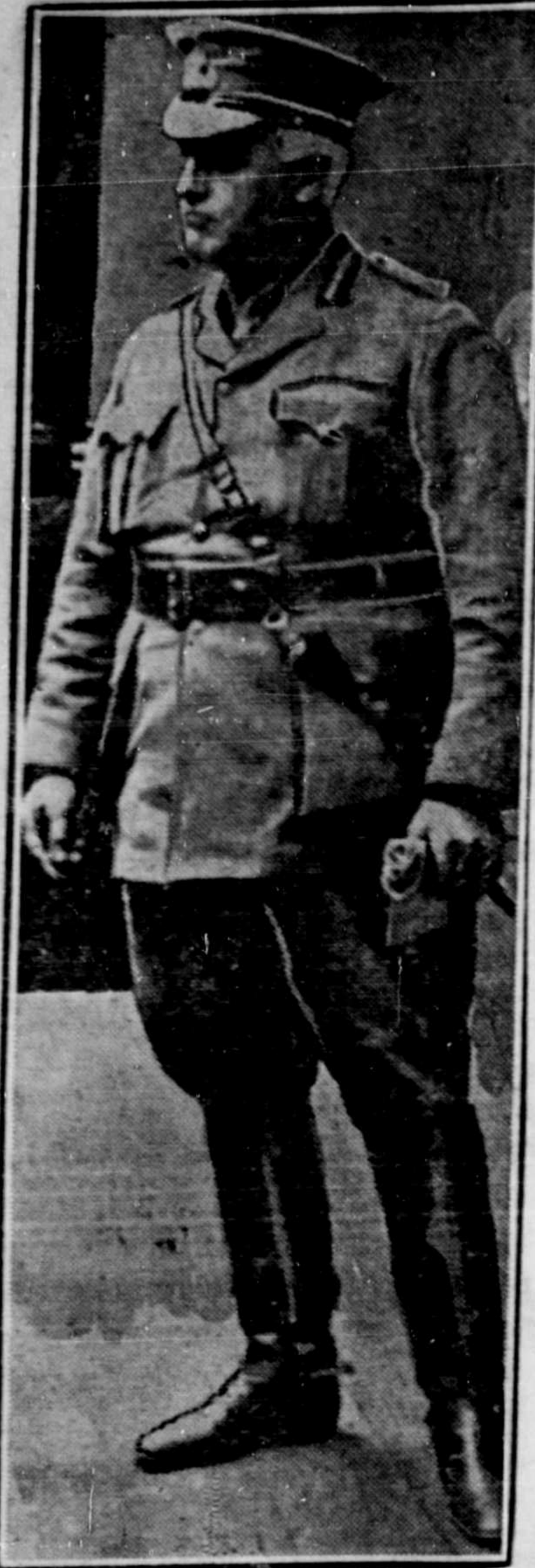
GENERAL HUGHES ABROAD

Regina, Aug. 26.—Among other municipal enterprises entered into by the city of Regina is that of grain raising. The city's artesian wells, from which the water supply is secured, are located at various points on a 400-acre farm. Up to the present year this ground has only been used for the purpose of securing