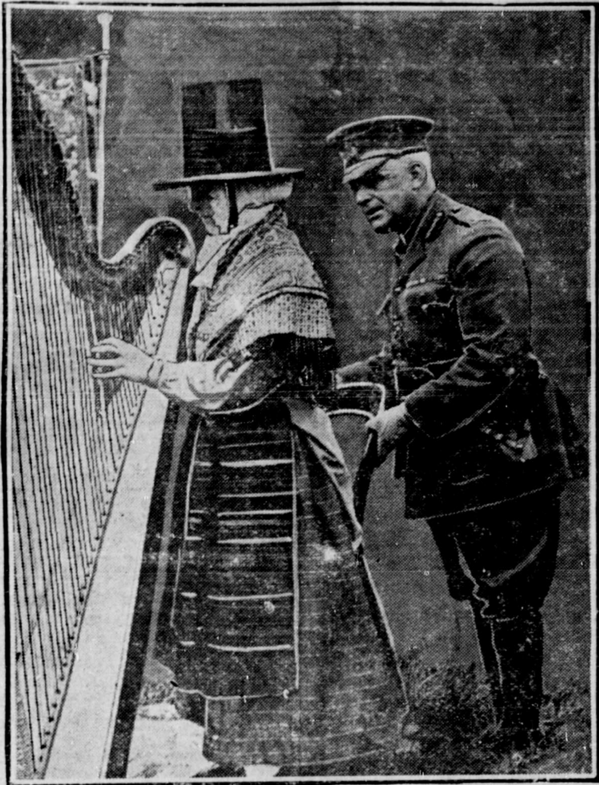
GENERAL SIR SAM HUGHES WAS RIGHT ON THE JOB

A cabinet meeting was held and as a result a request was sent to the commander of a Persian brigade of Cossacks, who are encamped four days march from Kenghever to send a detachment there immediately.