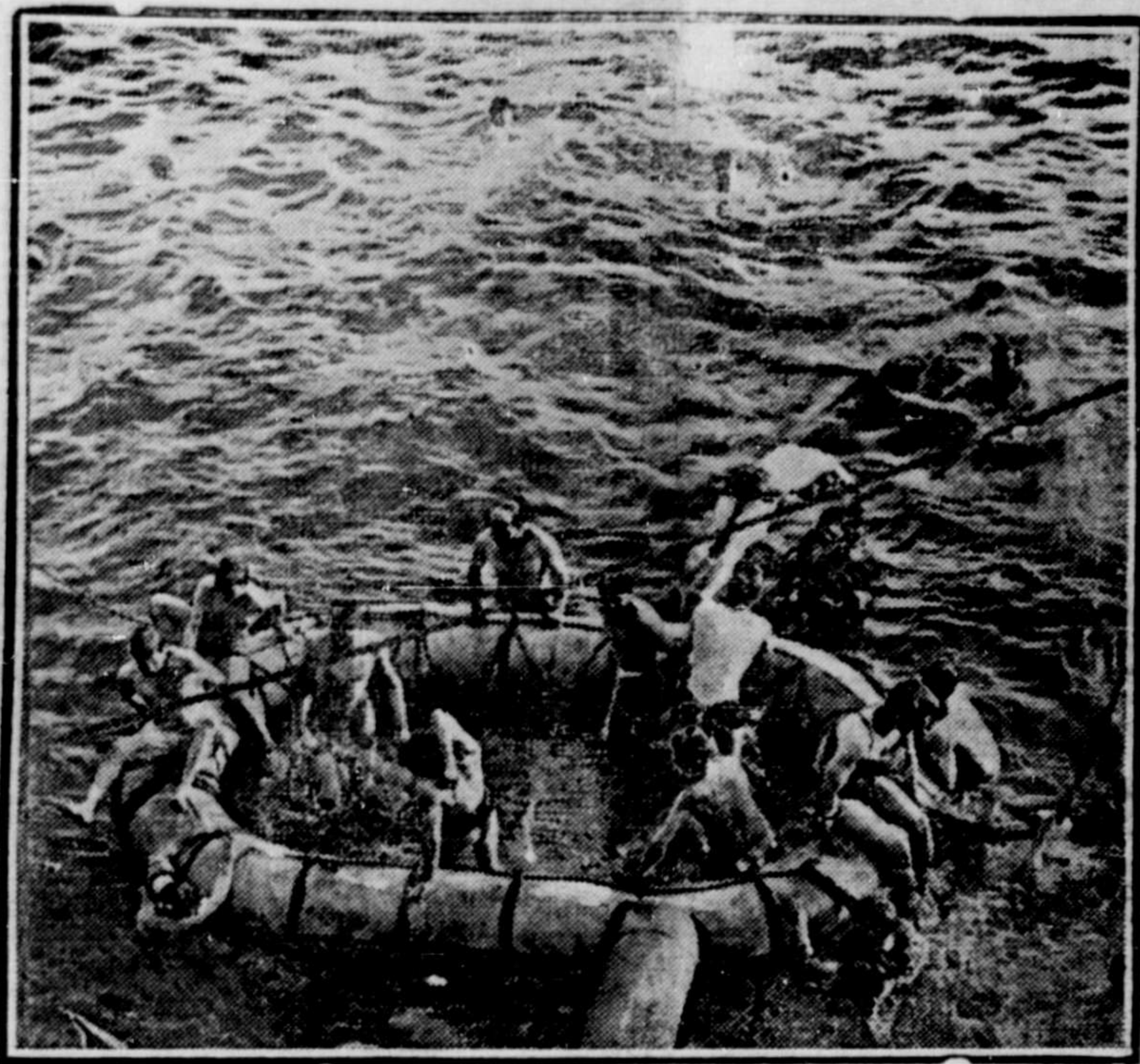
NEW LIFE SAVING RAFT ADOPTED BY THE BRITISH NAVY Photo shows sailors from one of the British battleships in the Dardanelles testing one of the new life rafts now being supplied to all ships in the service.

any information as to the movement of our troops." Serbia Willing. The Serbian government has informed Greece that it will comply with the requests of the Allies in regard to the concessions to Bulgaria. Pegoud Dead. Adolphe Pegoud, the famous aviator, is dead at the age of 26. He brought down his sixth German air craft on July 11. Pegoud was the most daring of the younger French aviators, and was the first to fly upside down.