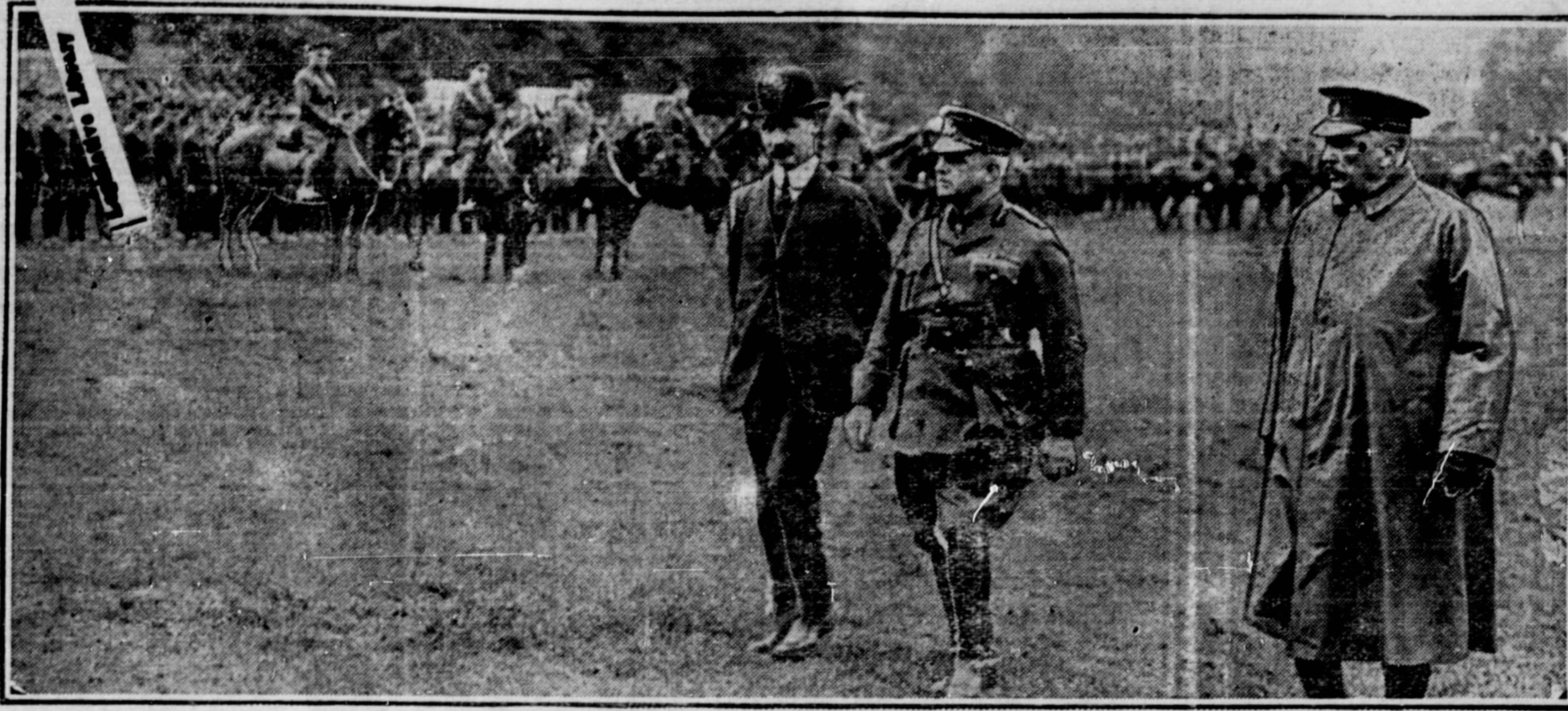
SONAR LAW AND GENERAL SIR SAM HUGHES REVIEW CANADIANS.