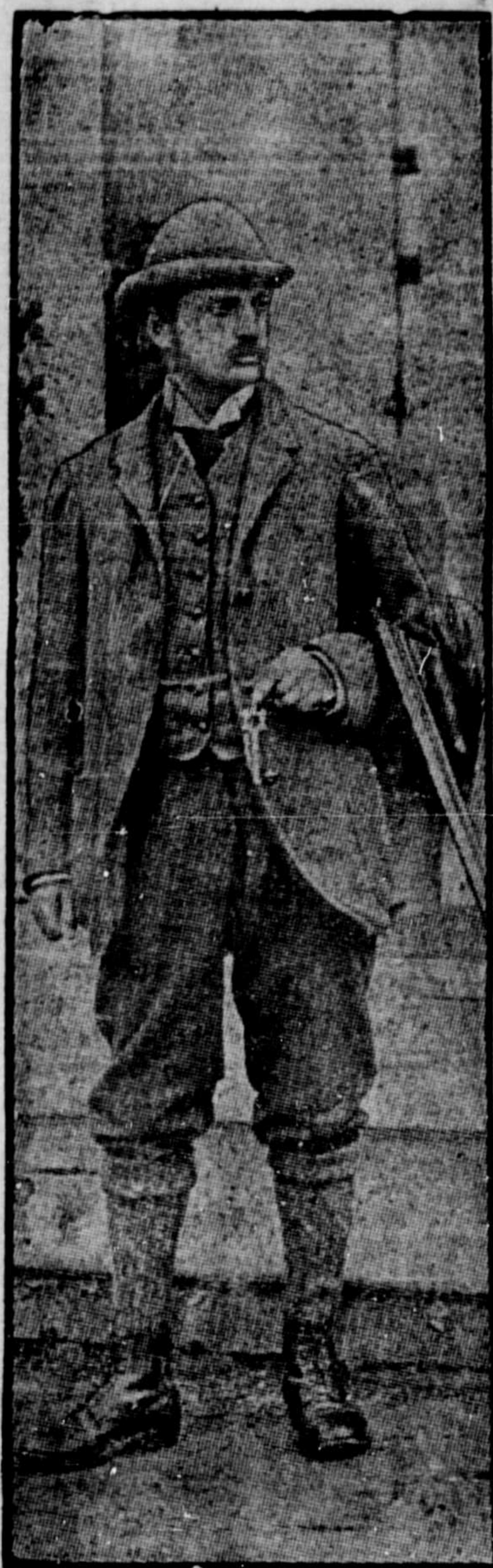
SIR RIDER HAGGARD