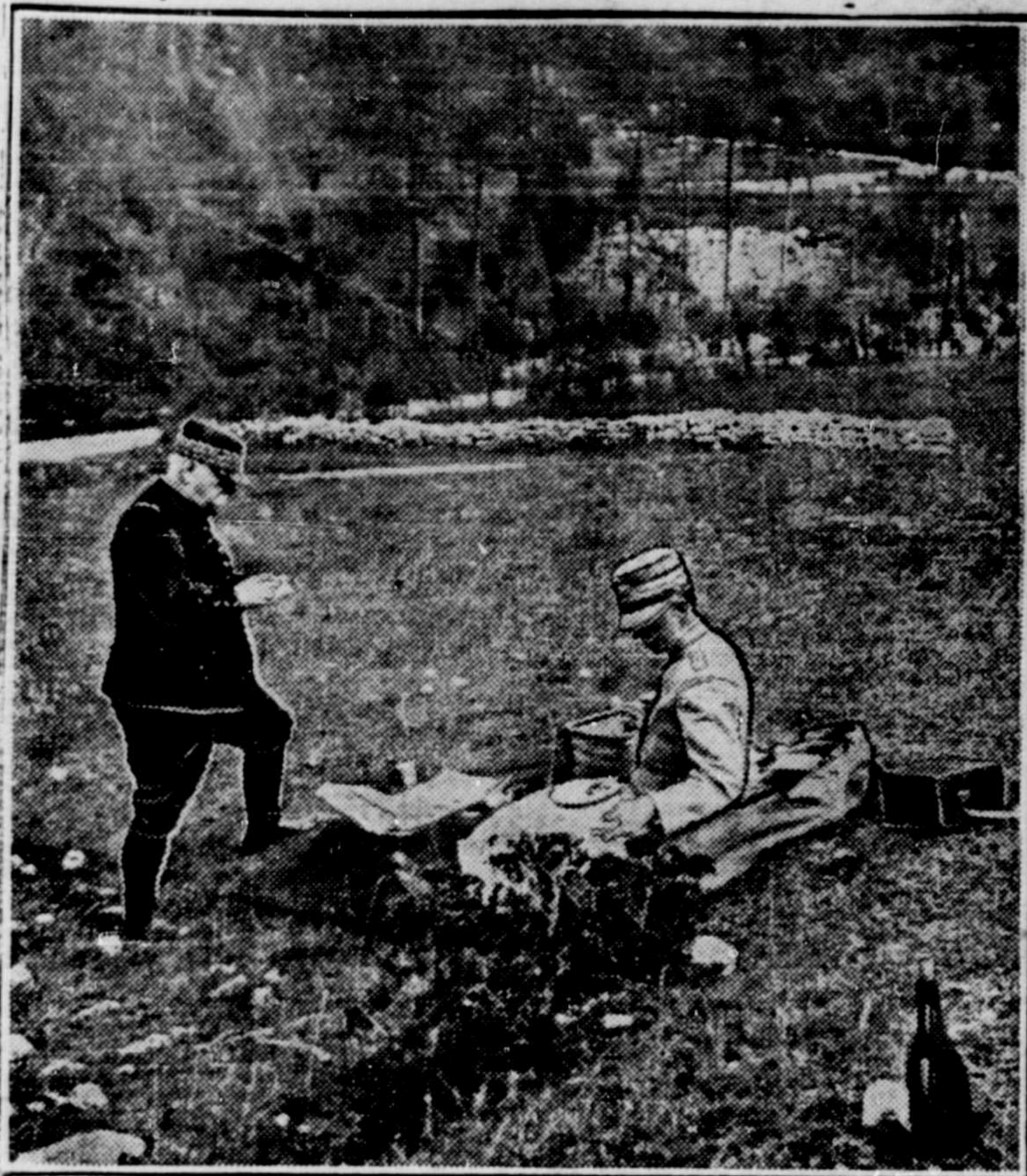
GEN. JOFFRE AND ITALY'S KING DINE AT THE BATTLEFRONT

The chief Bulgarian forces have been removed to the Serbian frontier to assist the Germans in holding the French and British while the Bulgarians in the immediate vicinity of the Black Sea ports are reckoned to be able to resist the Russians, with the assistance of the Turks.