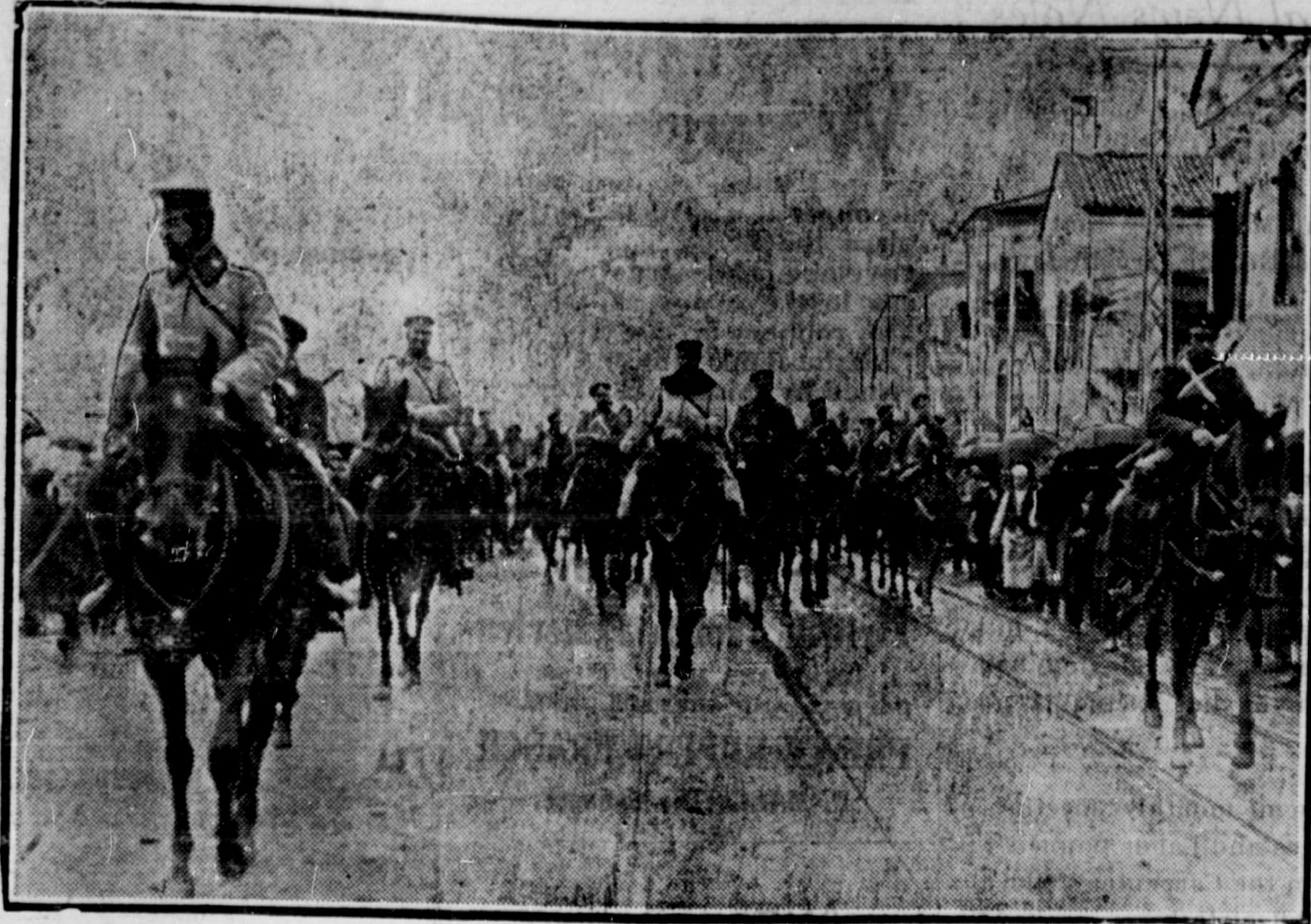
GREEK SOLDIERS CONCENTRATE AT SALONIKI.—Photo shows Greek cavalry riding down a street in Saloniki, where the Allied troops landed to operate against the Bulgarian forces.

Avos, May 14th, 1914. "I have used 'Fruit-a-tives' for Indigestion and Constipation with most excellent results, and they continue to be my only medicine. I saw 'Fruit-a-tives' advertised with a letter in which some one recommended them very highly, so I tried them. The results were more than satisfactory, and I have no hesitation in recommending 'Fruit-a-tives'." ANNIE A. CORBETT. Time is proving that 'Fruit-a-tives' can always be depended upon to give prompt relief in all cases of Constipation and Stomach Trouble. 50c. a box, 6 for $2.50, trial size 25c. At dealers or sent postpaid by Fruit-a-tives Limited, Ottawa.