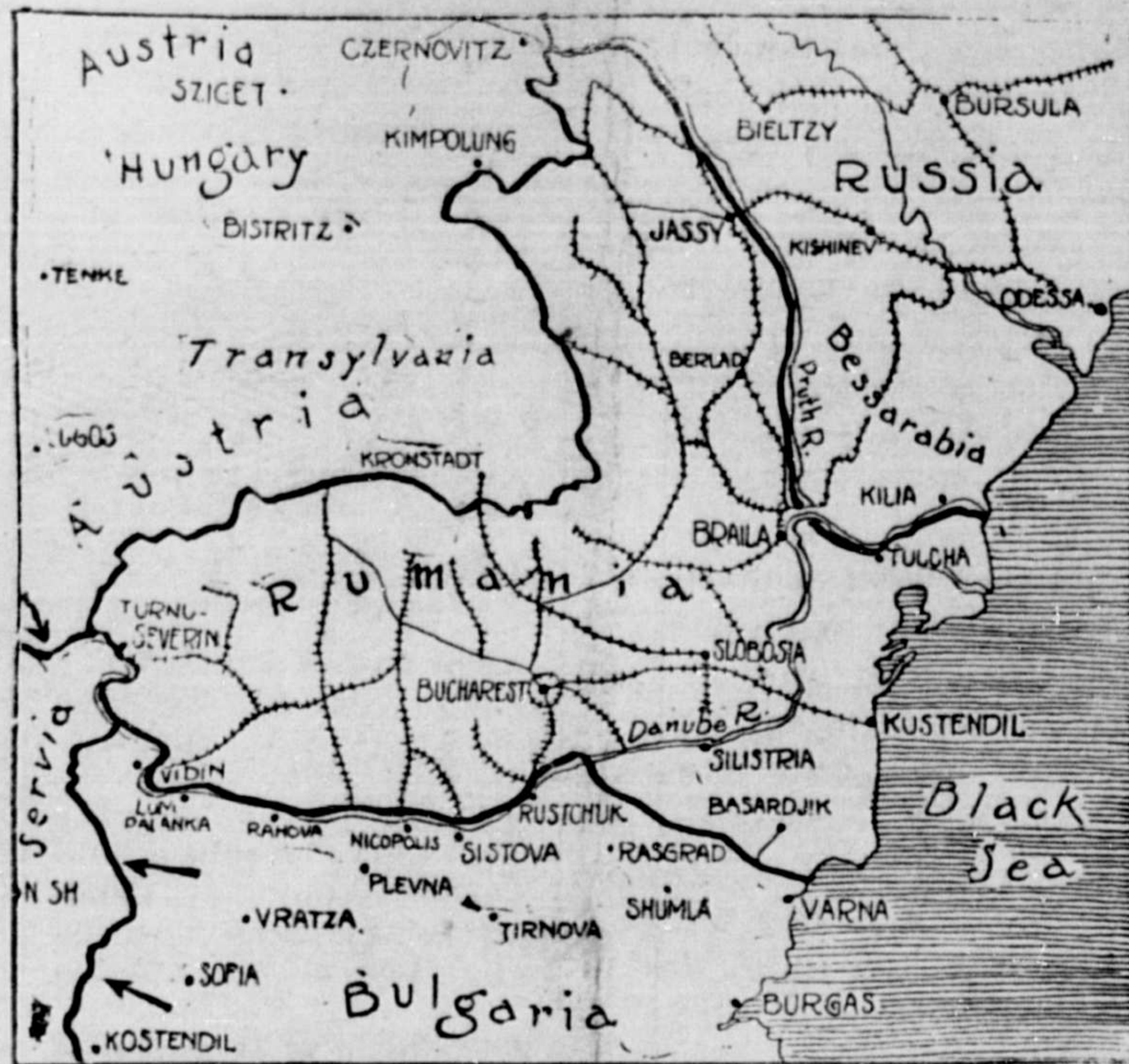
HOW RUSSIANS WILL AID ALLIES IN THE BALKANS

Halloween supper in Baptist Church Thursday, October 28th, 6 to 8 p. m. Social following Admission 50c.