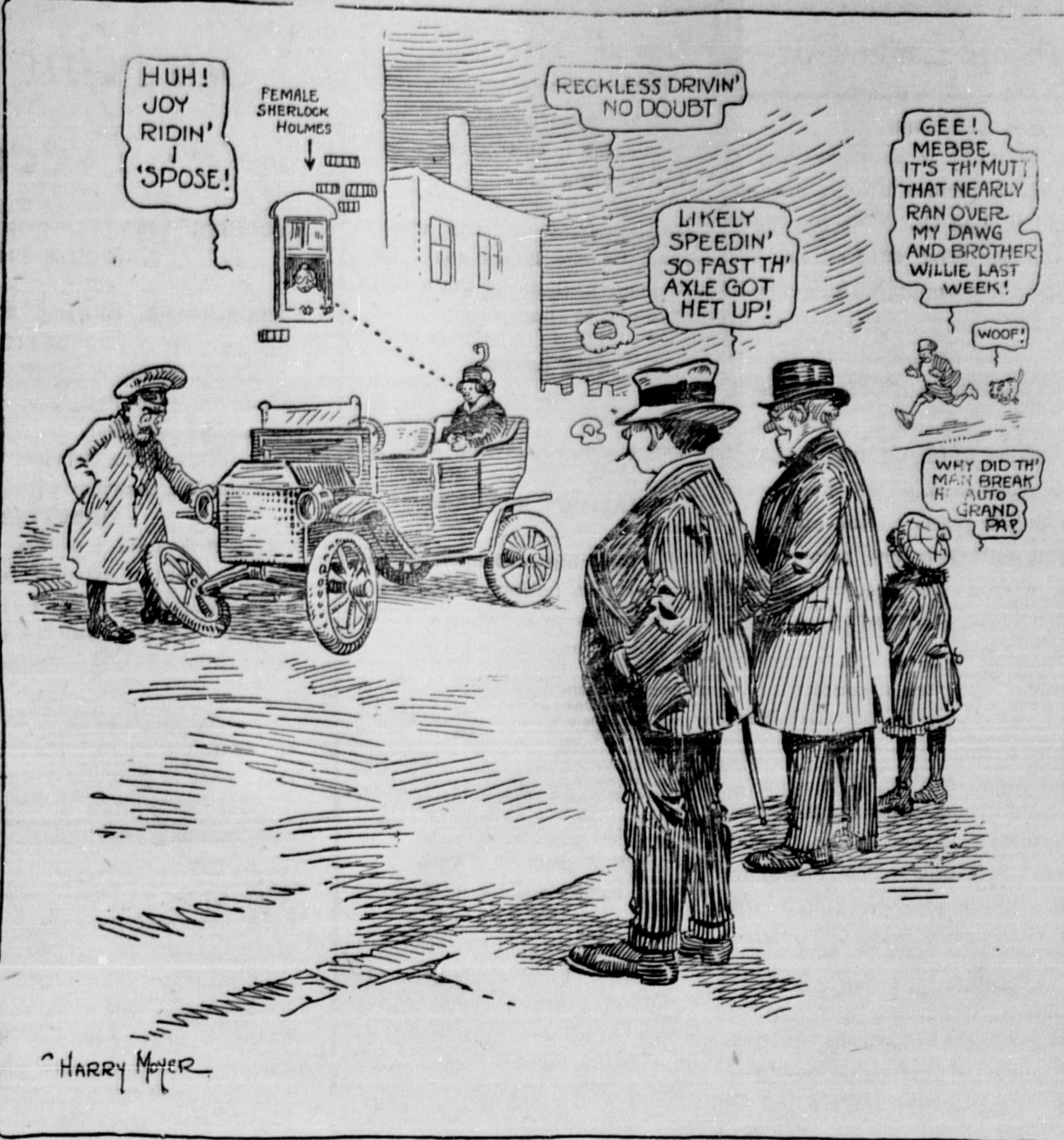
"THE SYMPATHETIC PEDESTRIANS"—Cartoon by Moyer.