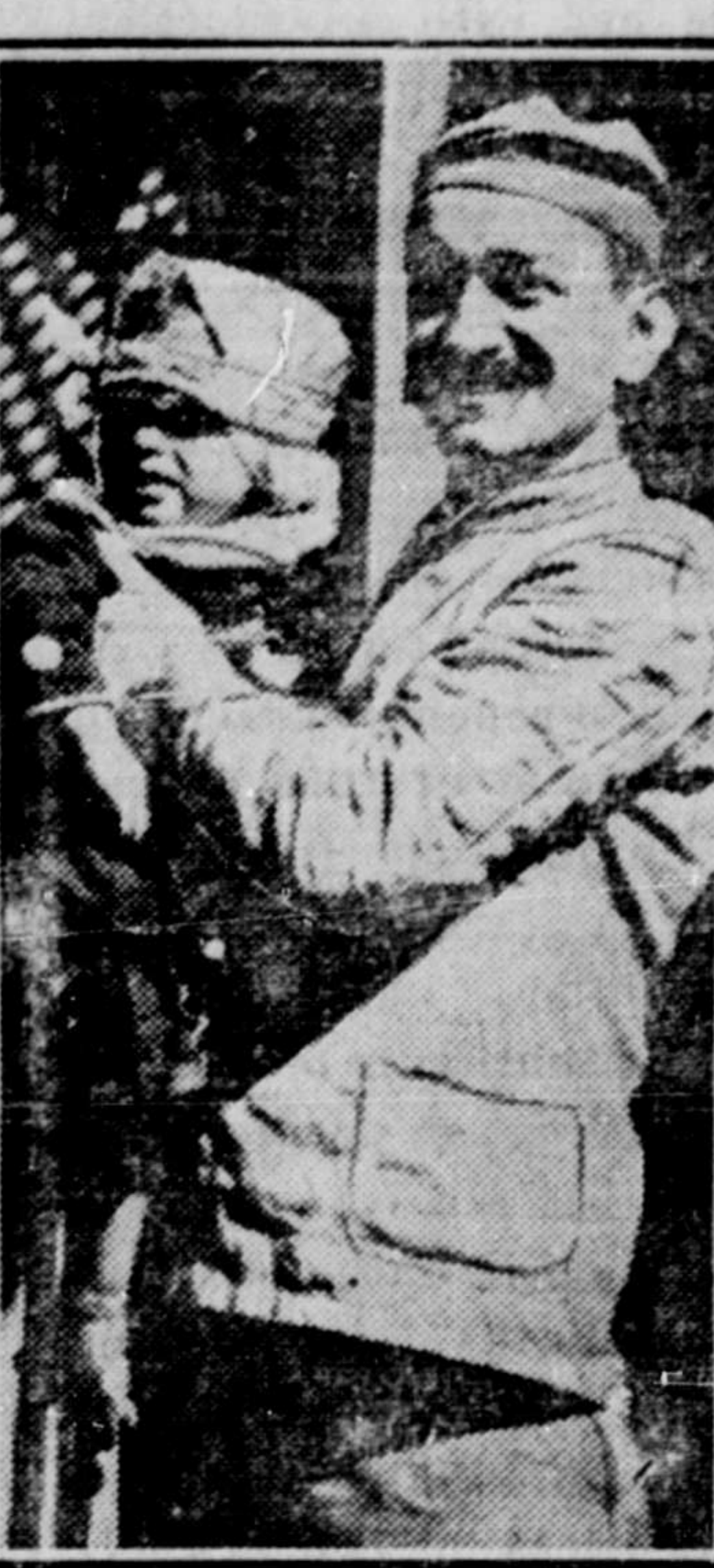
ARMENIAN REFUGEES FLEEING FROM MASSACRE, RESCUED BY ALLIES Allies' warships, particularly along the Syrian coast, have been recently engaged in transporting these stricken people to places where they could be saved from Turkish aggression. On left is a young Armenian girl who narrowly escaped death and was rescued by a French battleship. On the right is a French marine acting as a nurse to a little Armenian boy who was rescued.