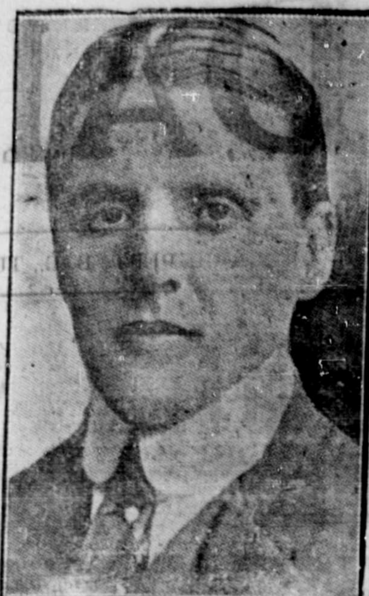
SIR F. E. SMITH

Solicitor General who, it is believed, will succeed Sir Edward Carson, who has resigned, owing to difference of opinion over the Eastern questions.