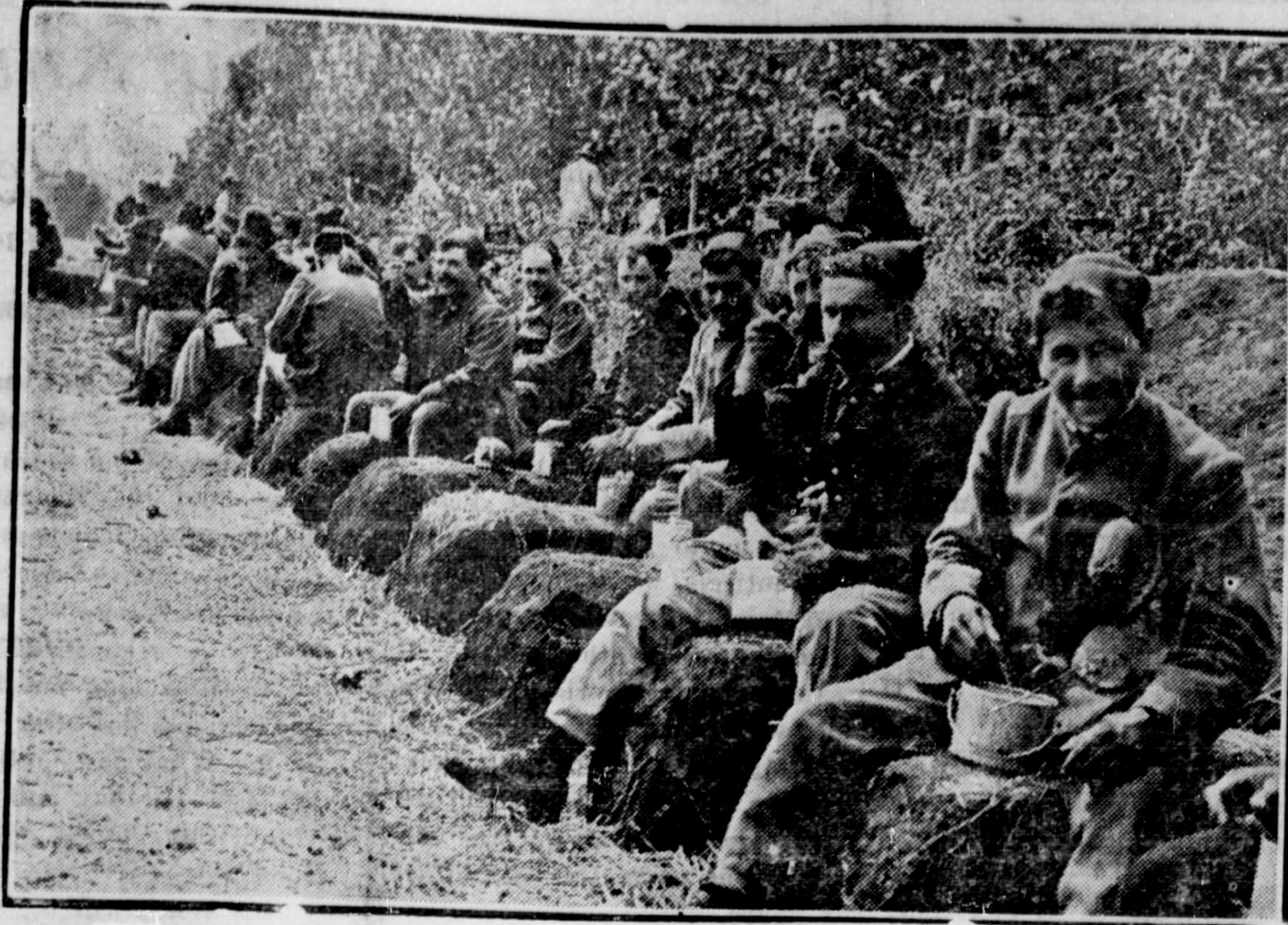
MESS HOUR IN AN ITALIAN RESERVE TRENCH.—Meal Consists chiefly of thick soup and bread.