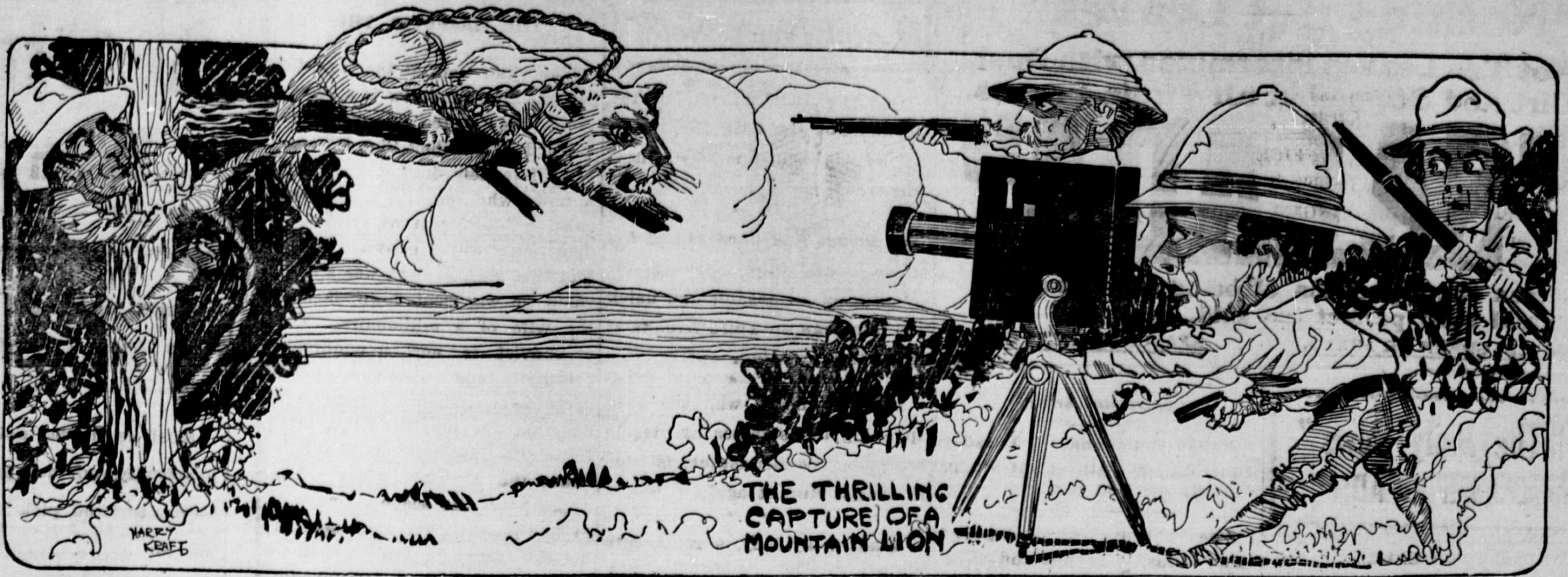
THE THRILLING CAPTURE OF A MOUNTAIN LION

50c. a box, 6 for $2.50, trial size 25c. At all dealers or direct from Fruit-a-lives Limited, Ottawa.