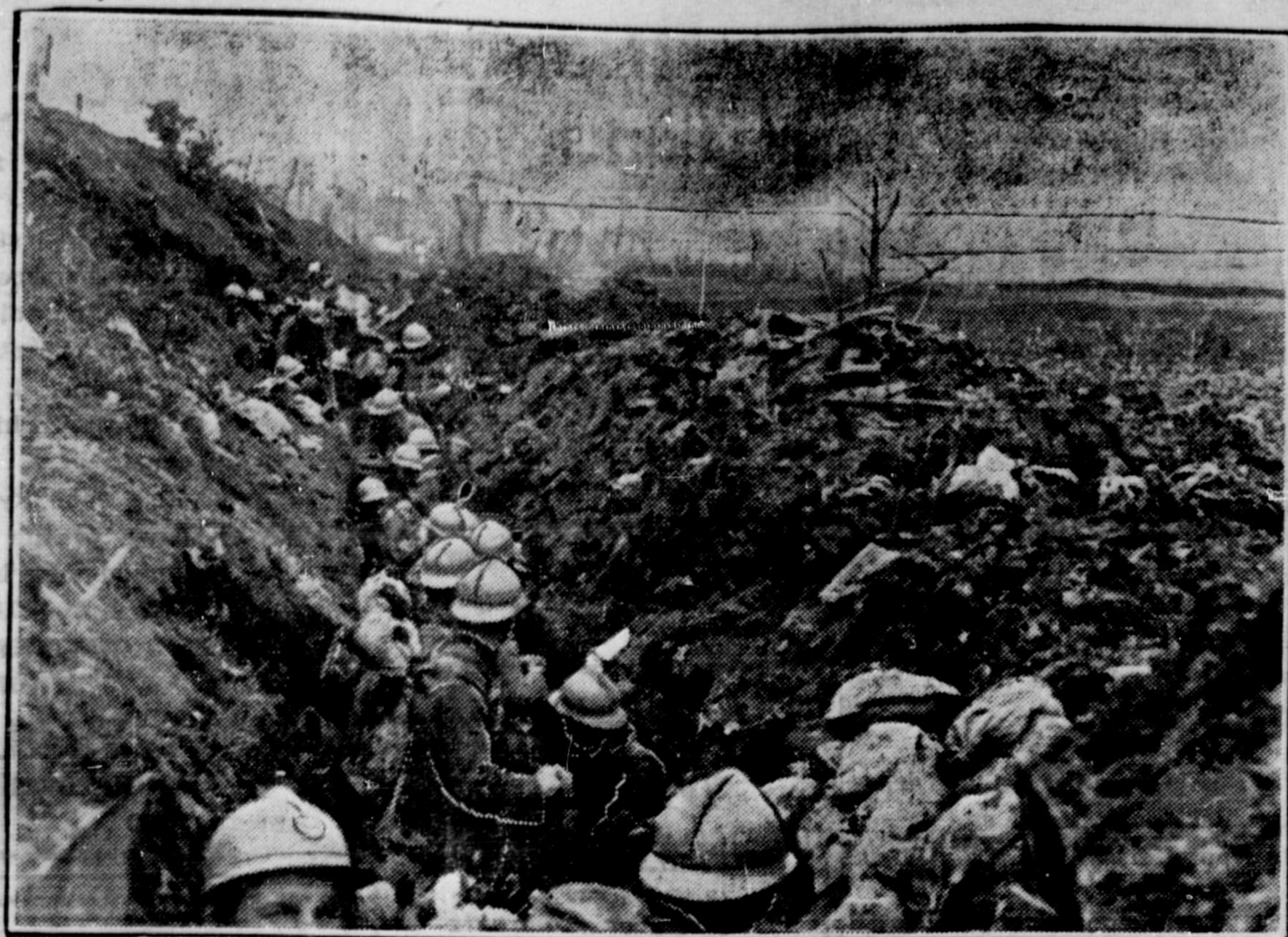
HELMETED FRENCH SOLDIERS AWAITING FINAL ATTACK AT SOUCHEZ. —French soldiers on the Souchez front waiting for the order to deliver the final attack. Note the new type of helmet supplied to the French troops.

Subscribe for the Daily News. Fifty cents per month.