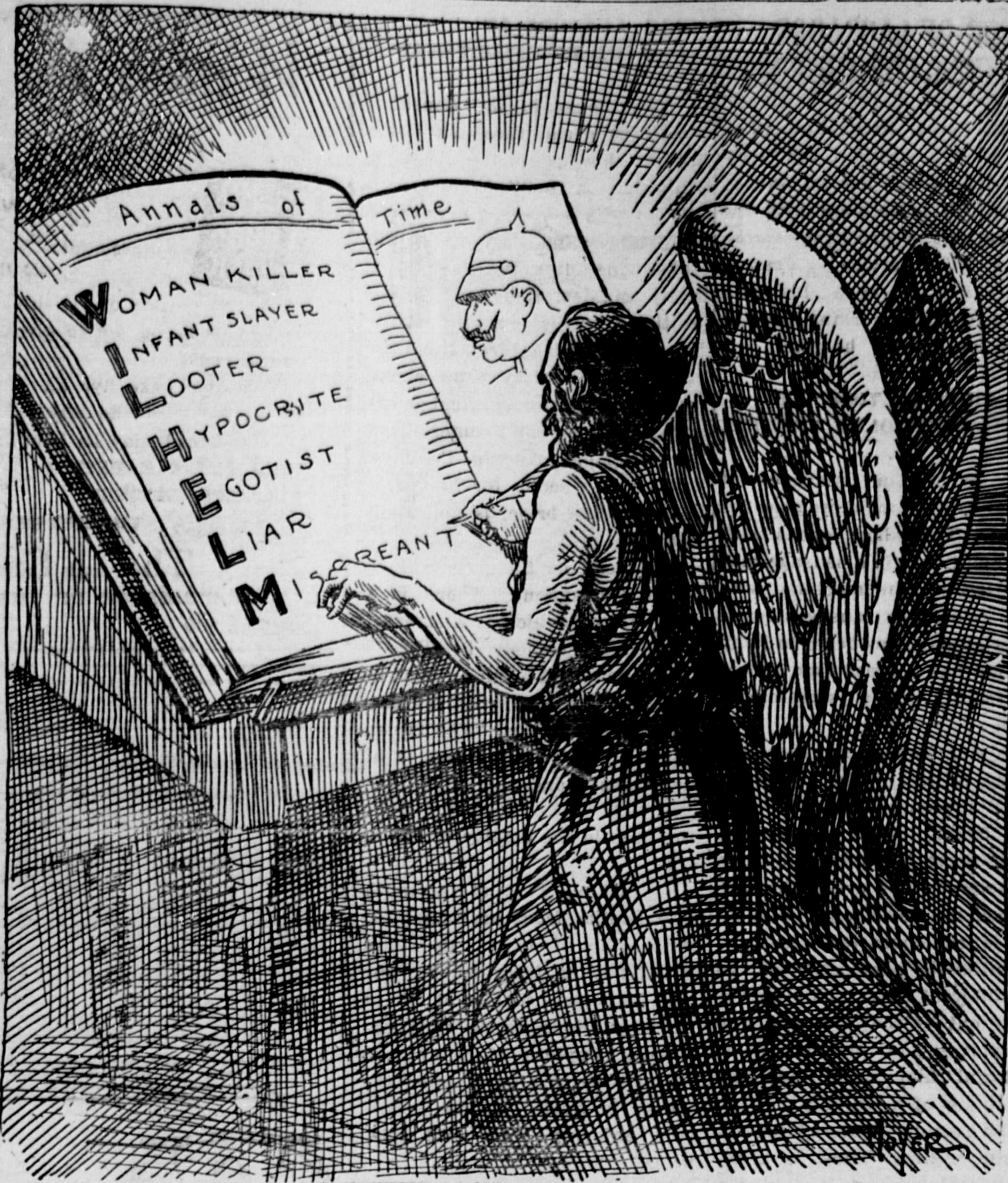
"INDELLIBLY WRITTEN"

Subscribe for the Daily News. Fifty cents per month.