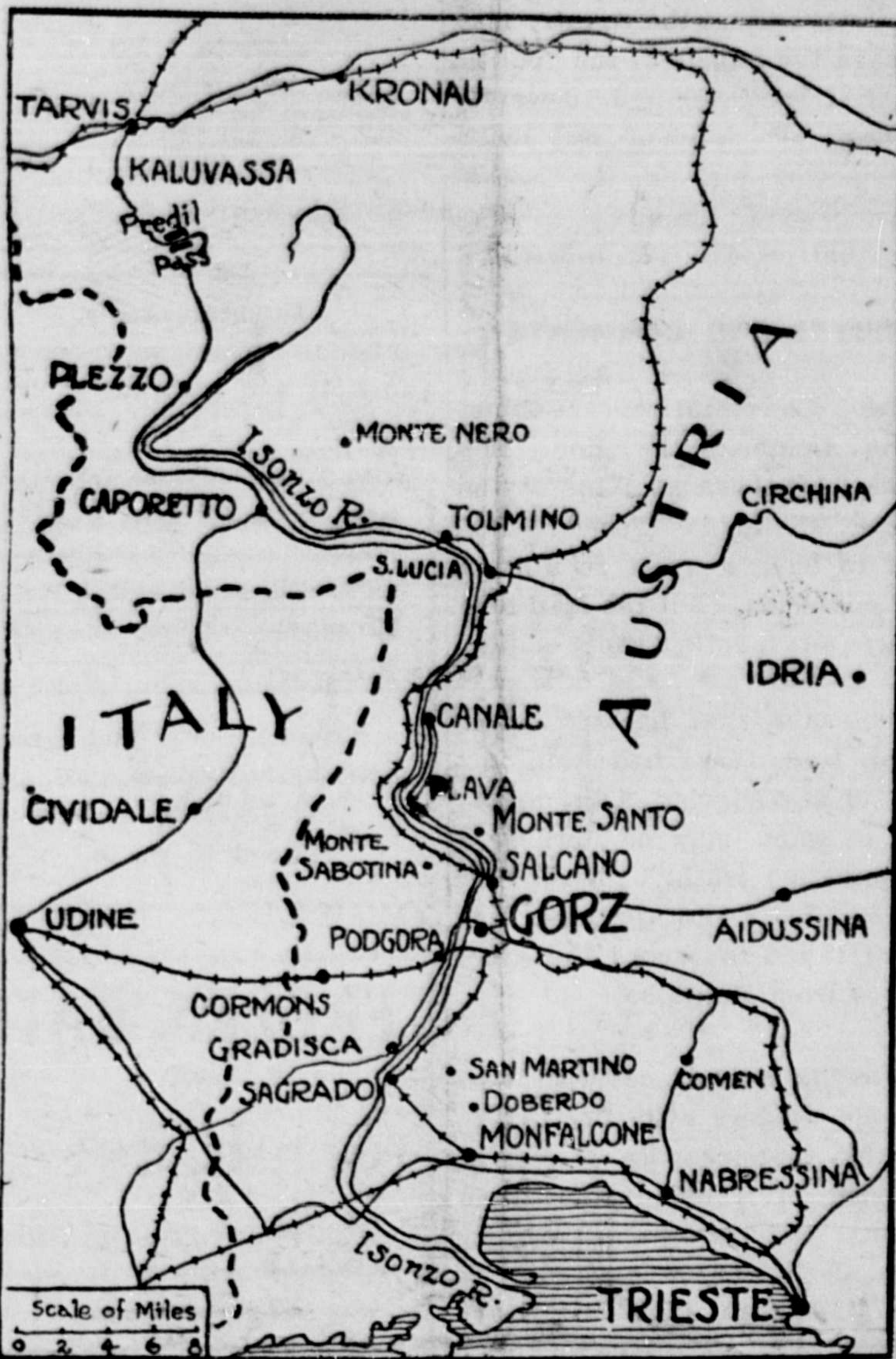
SCENE OF ITALIAN OFFENSIVE

dominion under the Czar or a king appointed by him. Italy. Italy will get the district of Trentino and Italian Irredenta, while the Turkish Empire will be dismembered. Serbia will be restored with Herzegovina and an indemnity received from Austria. Germany. The German fleet is to be surrendered and sunk or divided among the Allies, while all Zeppelins will be destroyed. The German colonies will go to the nations who conquered them. Greece and Roumania. The article ends by saying that if Greece and Roumania consider Greek Irredenta and Transylvania not worth fighting for, they will never receive them, as NATIONS WHO ARE UNFIT THROUGH COWARDICE TO RISK LIFE IN FIGHTING FOR ENSLAVED BRETHREN, ARE UNFIT TO RULE THEM.