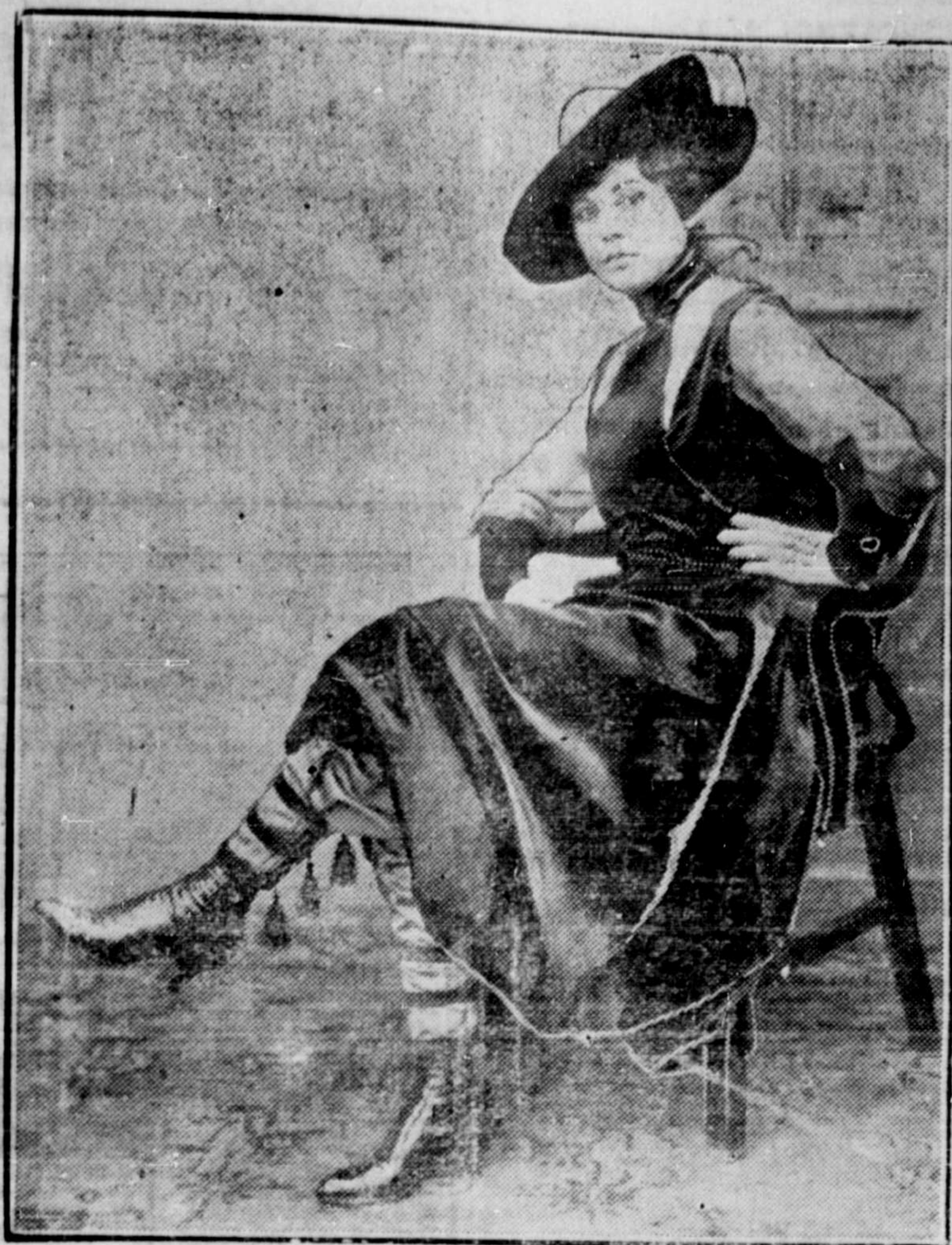
WHAT NEXT WILL DAME FASHION PRESCRIBE This picture taken at the recent International Fashion Show in New York, shows a style which may become common. The material is boulevard velvet with graceful pantalettes draping over boottops.