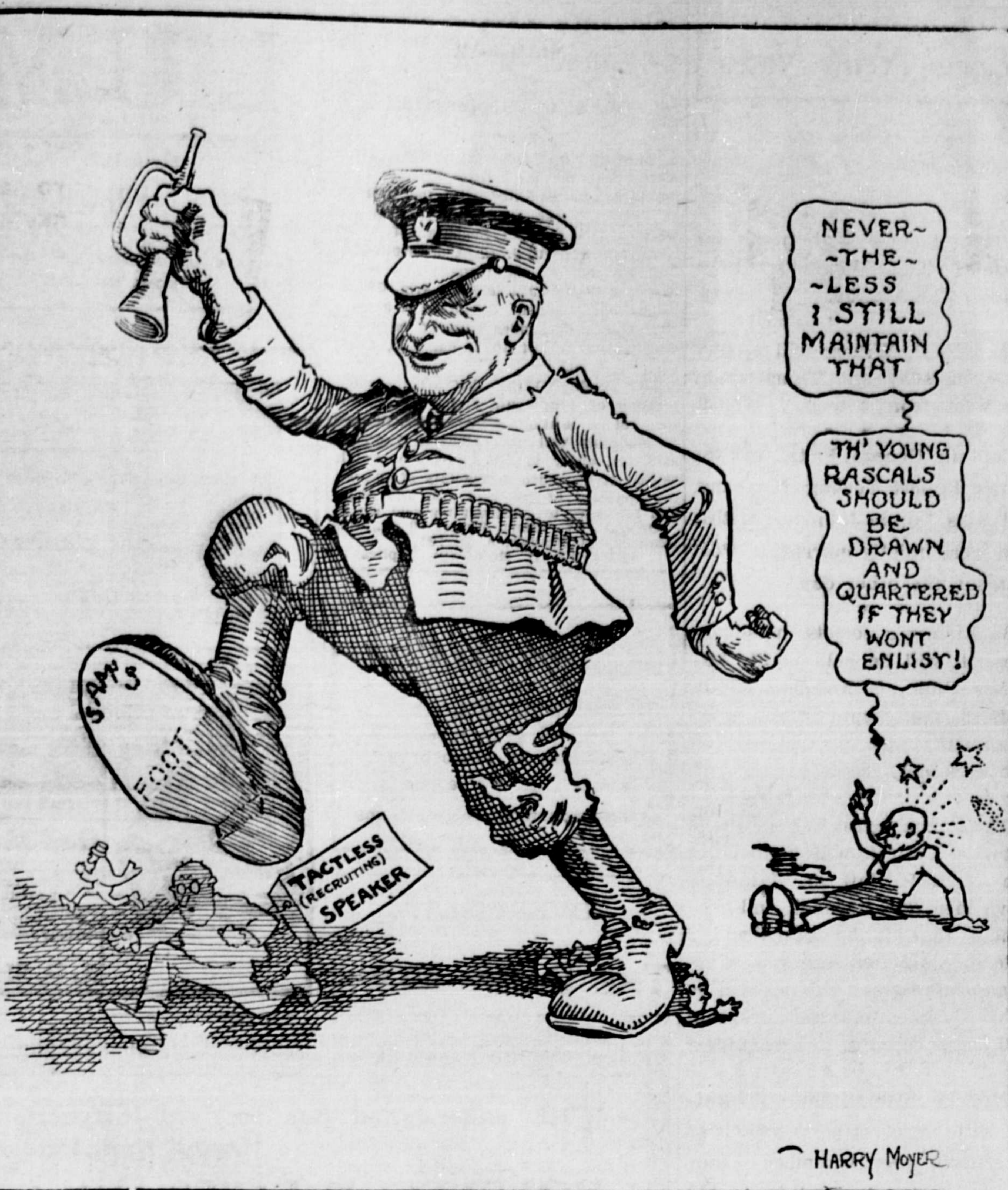
SIR SAM.—"If there's any Tactless speakin' to be done around here I'm quite capable of doin' it myself."