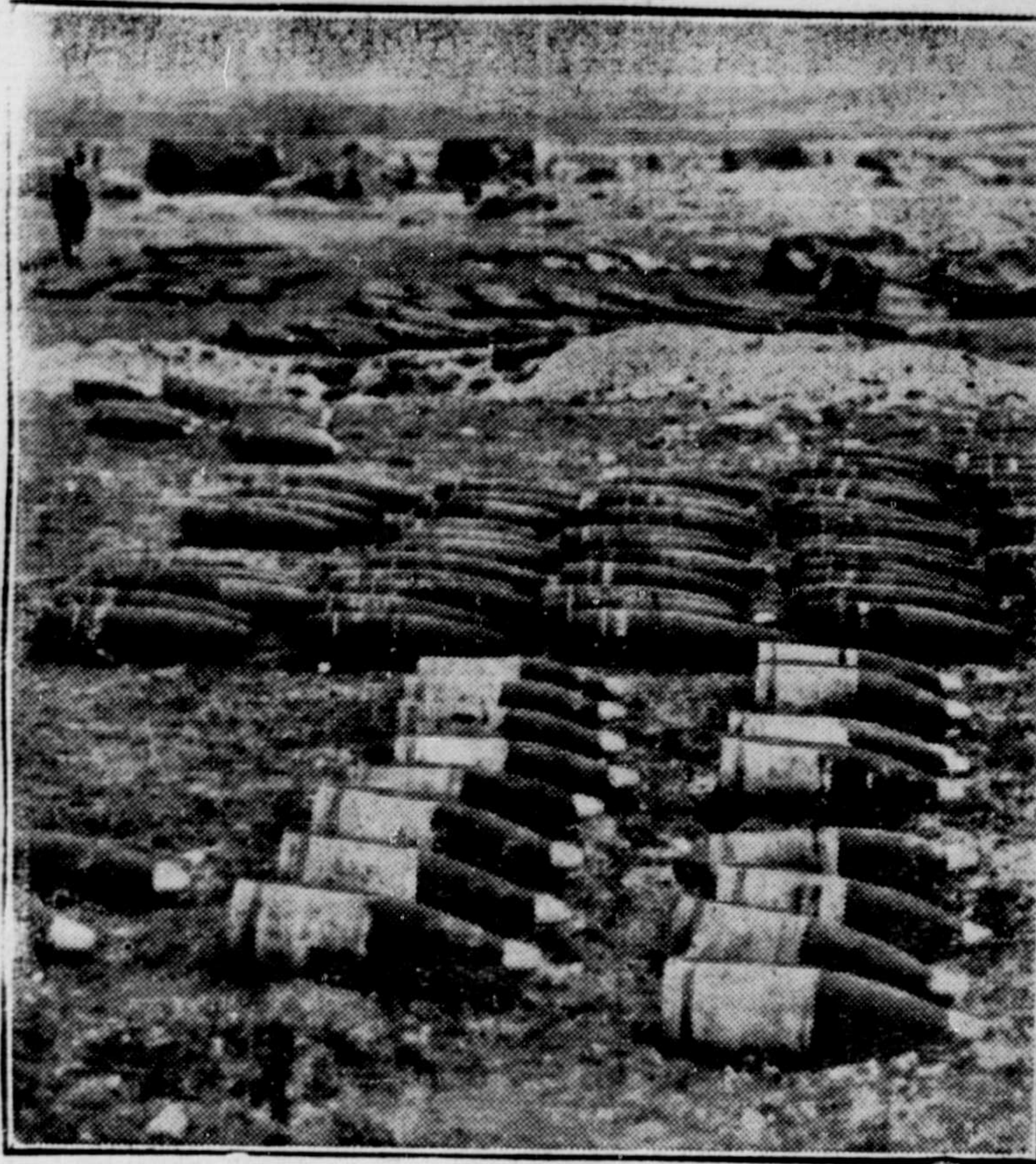
GERMAN GAS SHELLS