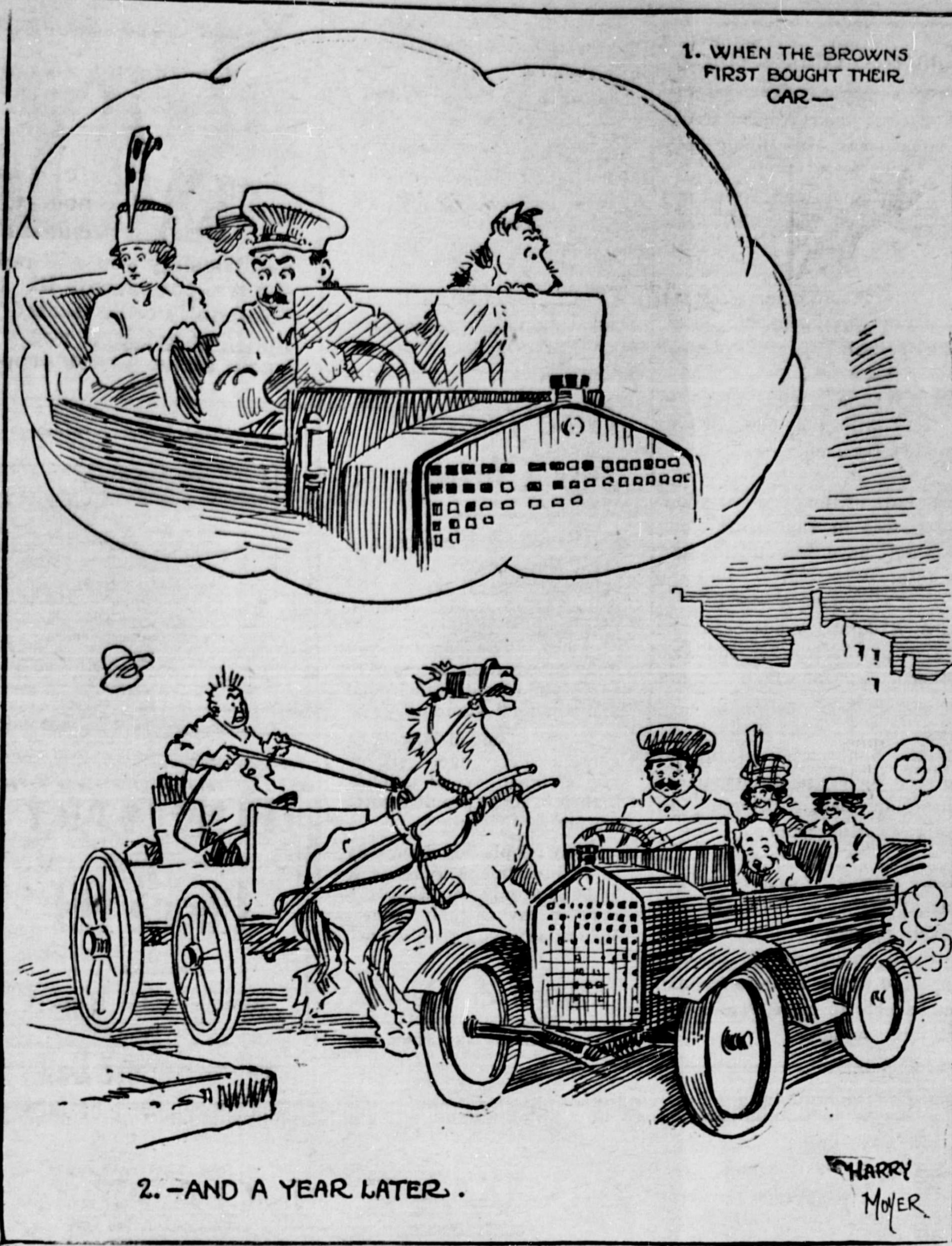
AT AN INTERSECTING STREET