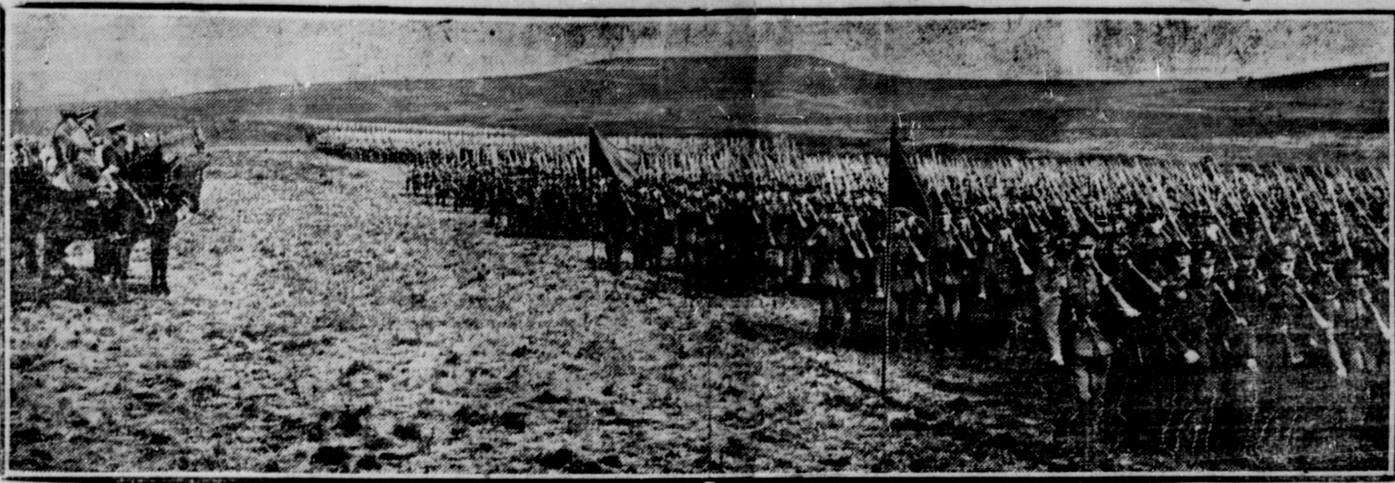
KING INSPECTS IRISH REGIMENTS BOUND FOR THE FRONT.—His Majesty, with Lord Kitchener, inspecting the Royal Ulster Volunteers and other Irish regiments at Aldershot just previous to their departure for the trenches of France and Flanders.

Follow the crowd to Self's Cafe. There is a reason. Next Majestic Theatre. 10211.