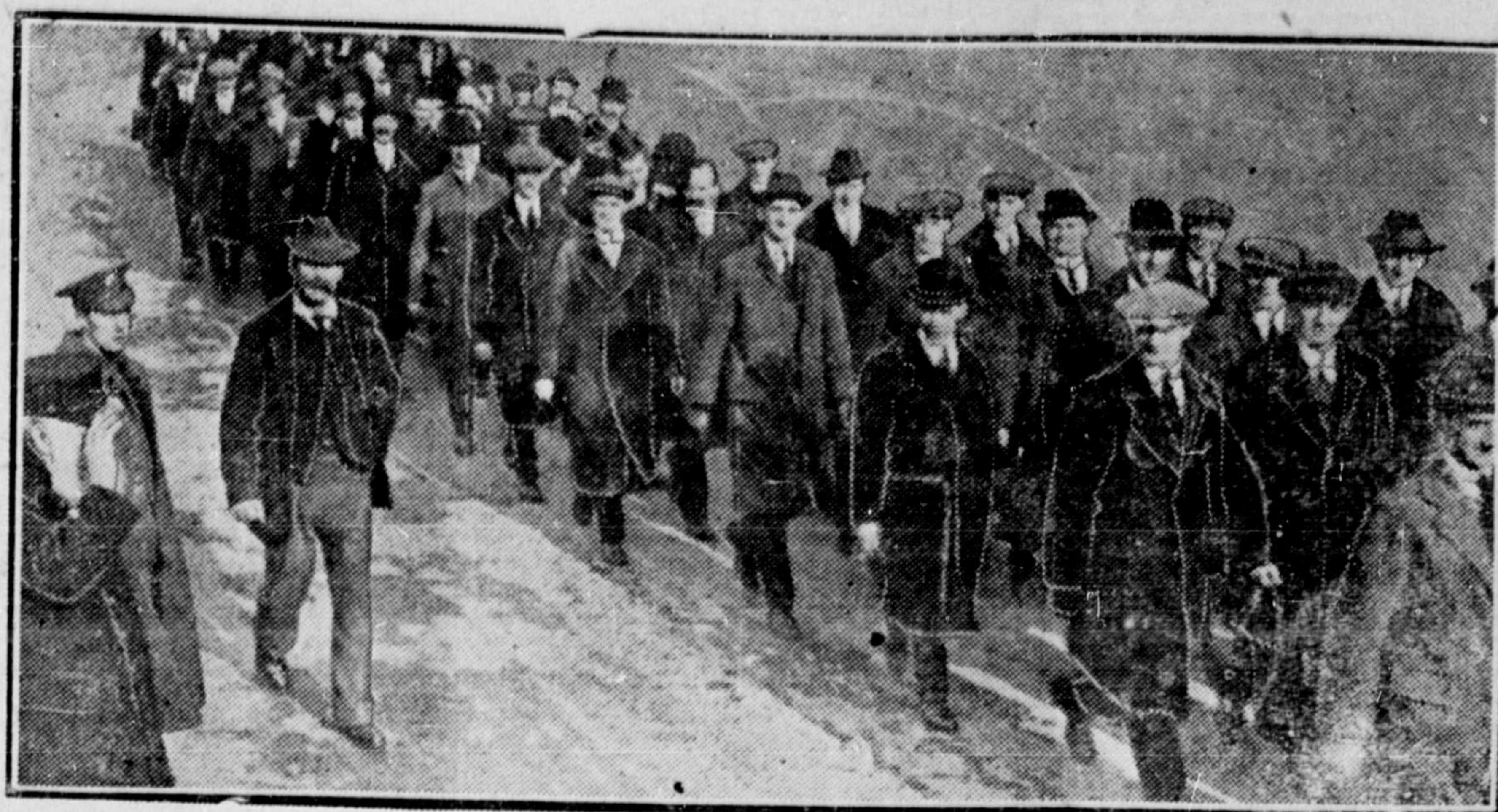
"DERBY VOLUNTEERS" WHO HAVE JUST SIGNED.—Photo shows a day's yield of recruits under the Derby campaign which expired November 30th. Though unexpected success has been attained along the lines followed in this campaign, yet the question of conscription is still alive.