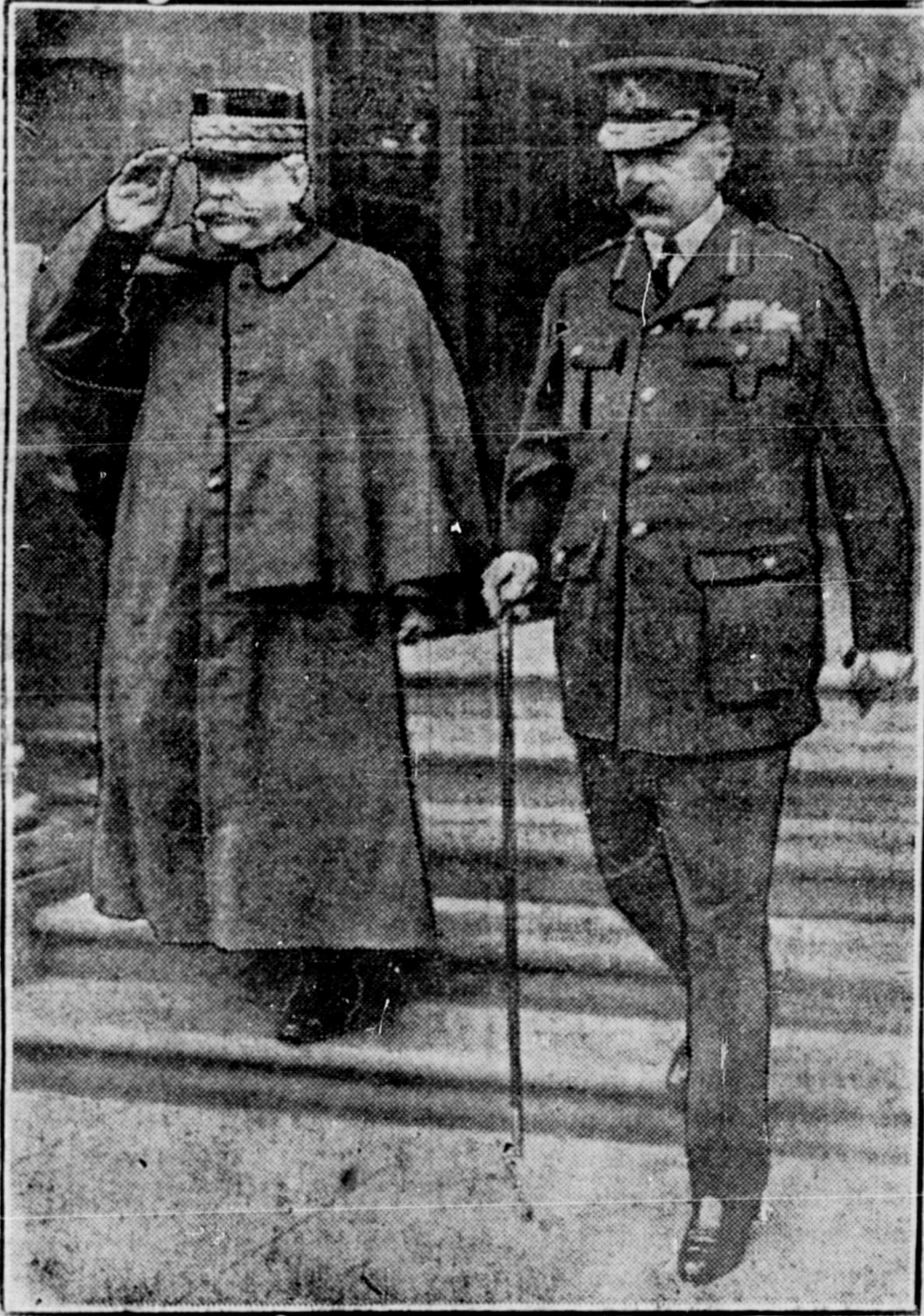
THE "STRONG MEN" OF FRANCE AND ENGLAND

Photo taken October 30th during the hurried visit to London of the French commander in chief for the reported purpose of making arrangements for a closer co-ordination of the French, British and Russian forces, shows General Joffre acknowledging the cheers of the crowd on leaving the British War Office with Lord Kitchener.