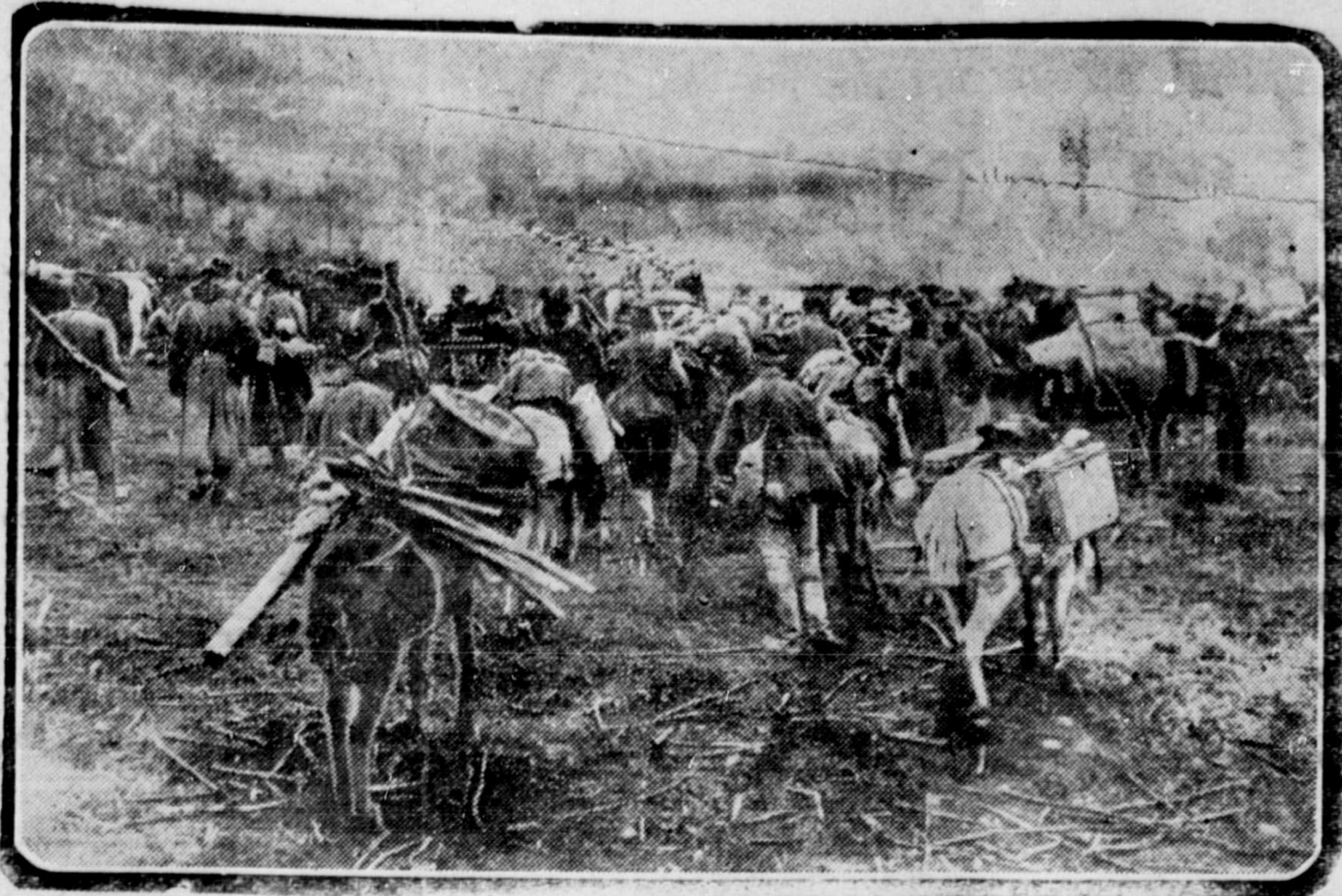
SERBIAN ARMY RETREATING INTO ALBANIA.—Photo gives a vivid picture of the Serbian army on the march just after breaking camp to move to another position.

ANDREW JACKSON & CLAUD PETERSON, October 18th, 1915.