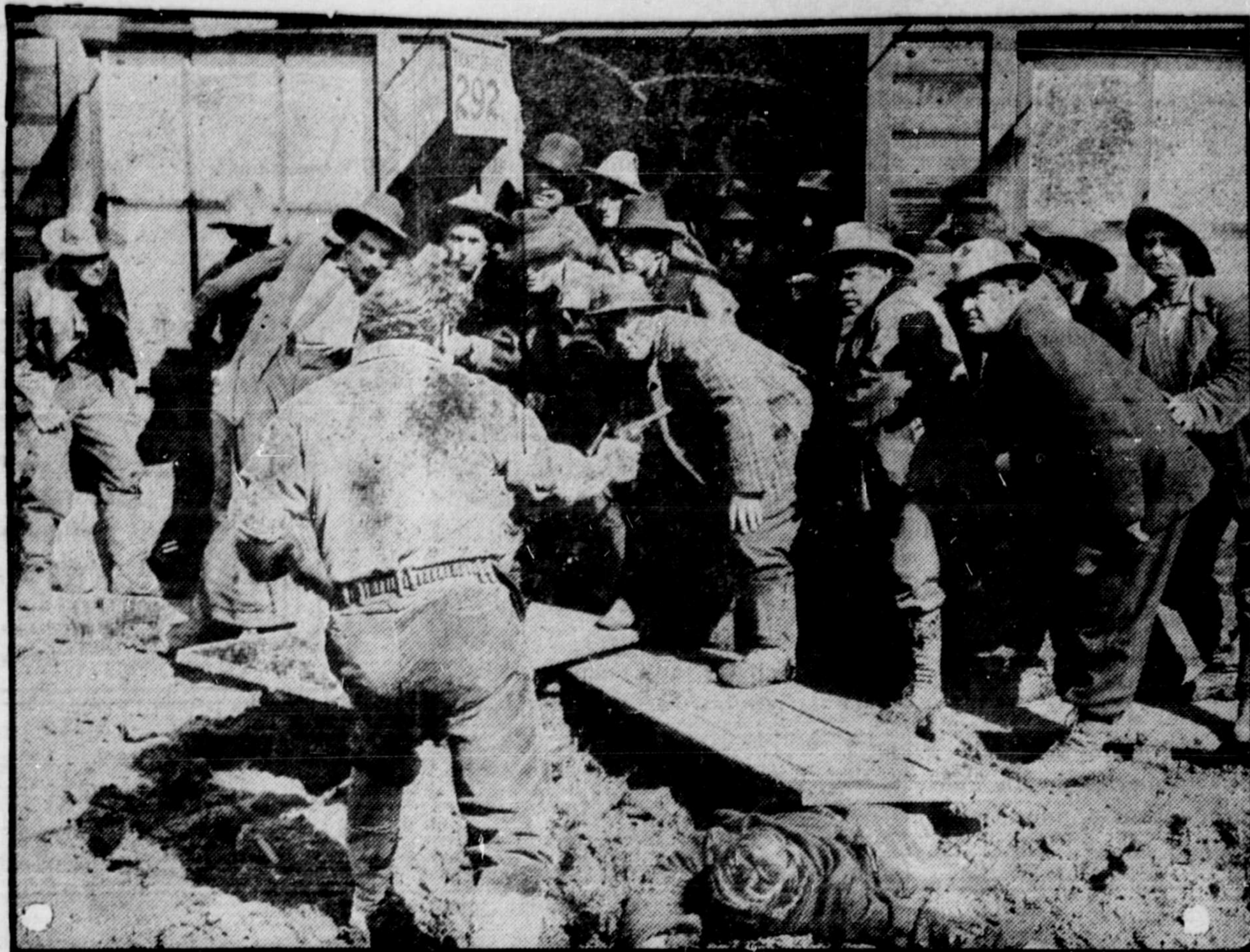
SCENE FROM "THE SPOILERS", AT THE WESTHOLME N DECEMBER 16TH AND 17TH