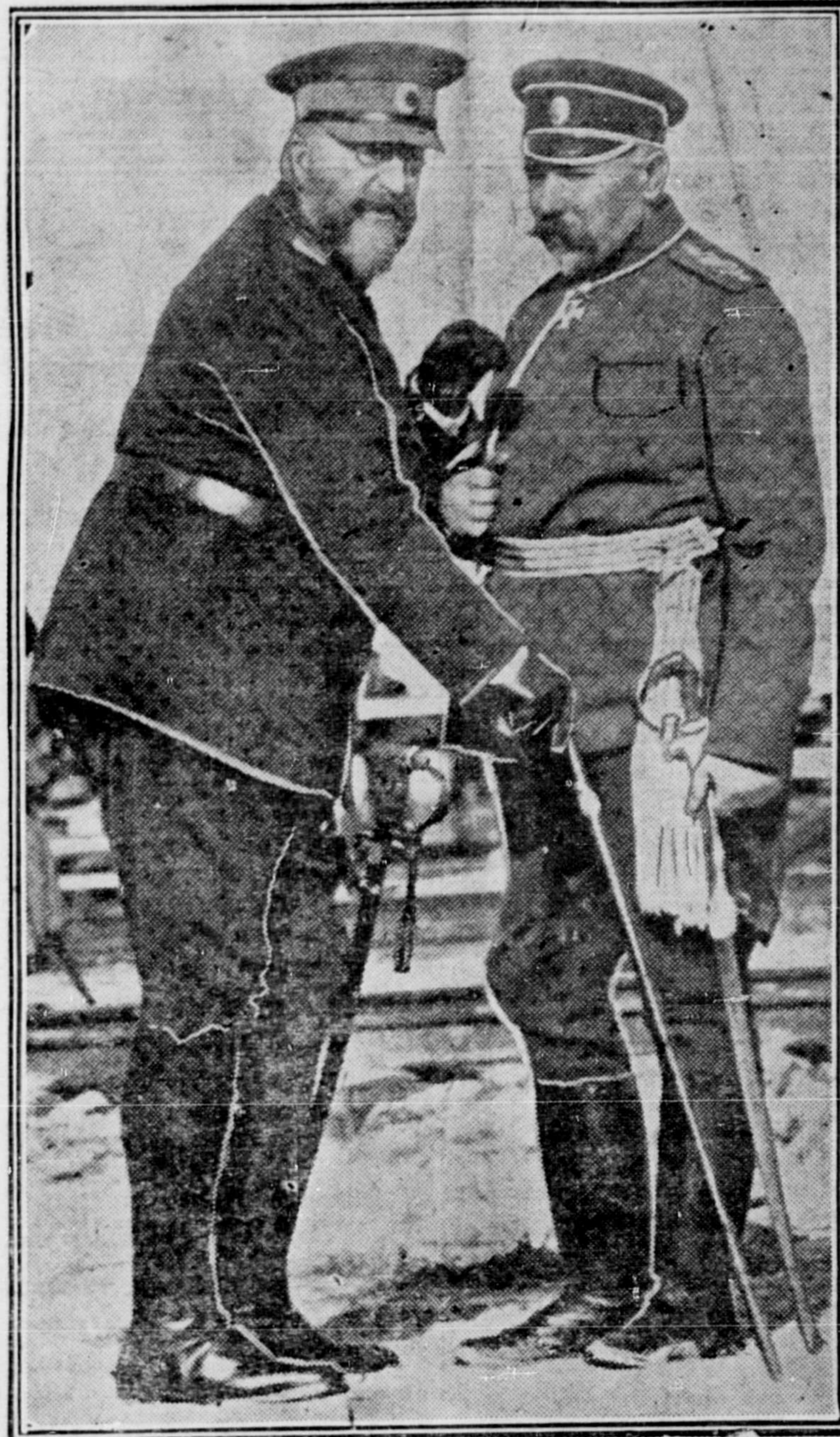
THE FOX OF THE BALKANS AND HIS GENERAL