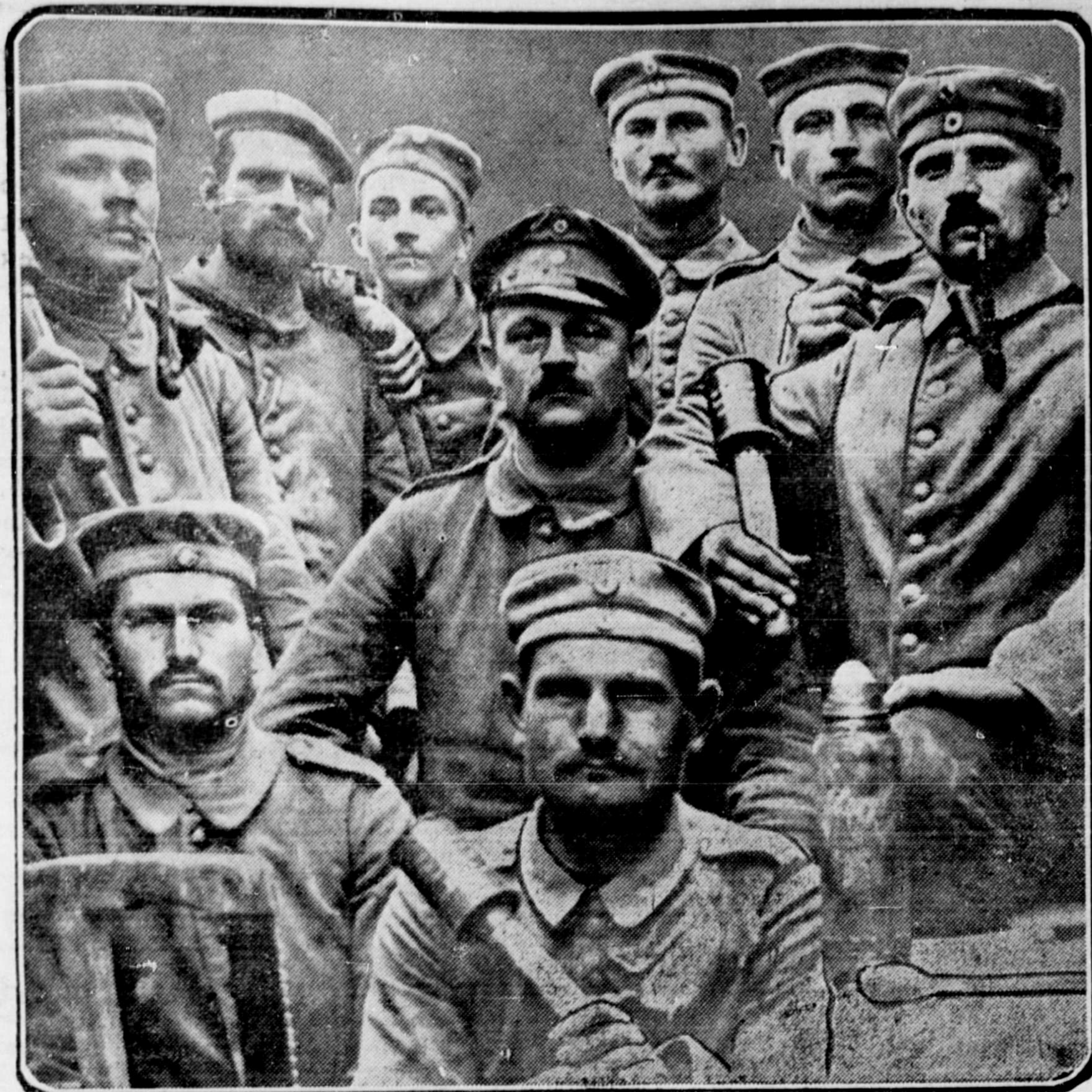
PRISONER HUNS IN THEIR TRENCHES.—Some German soldiers captured after a British charge

Commencing at a post planted at the mouth of Humpback Creek, on its east side, thence 30 chains in a northwesterly direction, following high water mark; thence 1 chain, more or less, in a southwesterly direction to low water mark; thence 30 chains, more or less, in a southeasterly direction, following low water mark; thence 1 chain in a northeasterly direction to point of commencement, and containing 3 acres, more or less. ANDREW JACKSON & CLAUD PETERSON, October 18th, 1915.