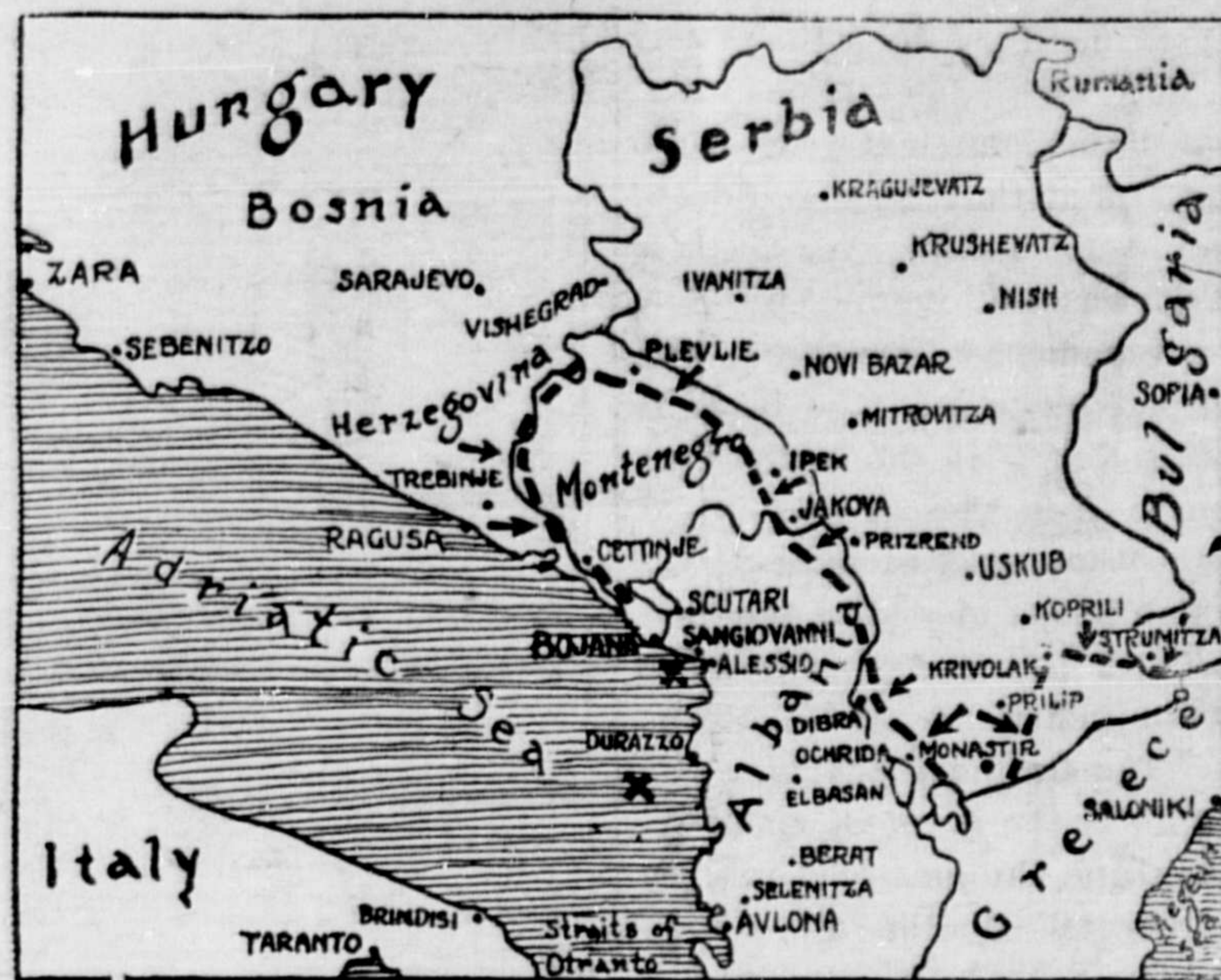
WHERE AUSTRIANS SCORED SUCCESS

The crosses off the Albanian coast in the Adriatic indicate where Allied ships were sunk by Austrian ships while trying to land supplies in Albania for the hard pressed Serbians. The battle line is shown also.