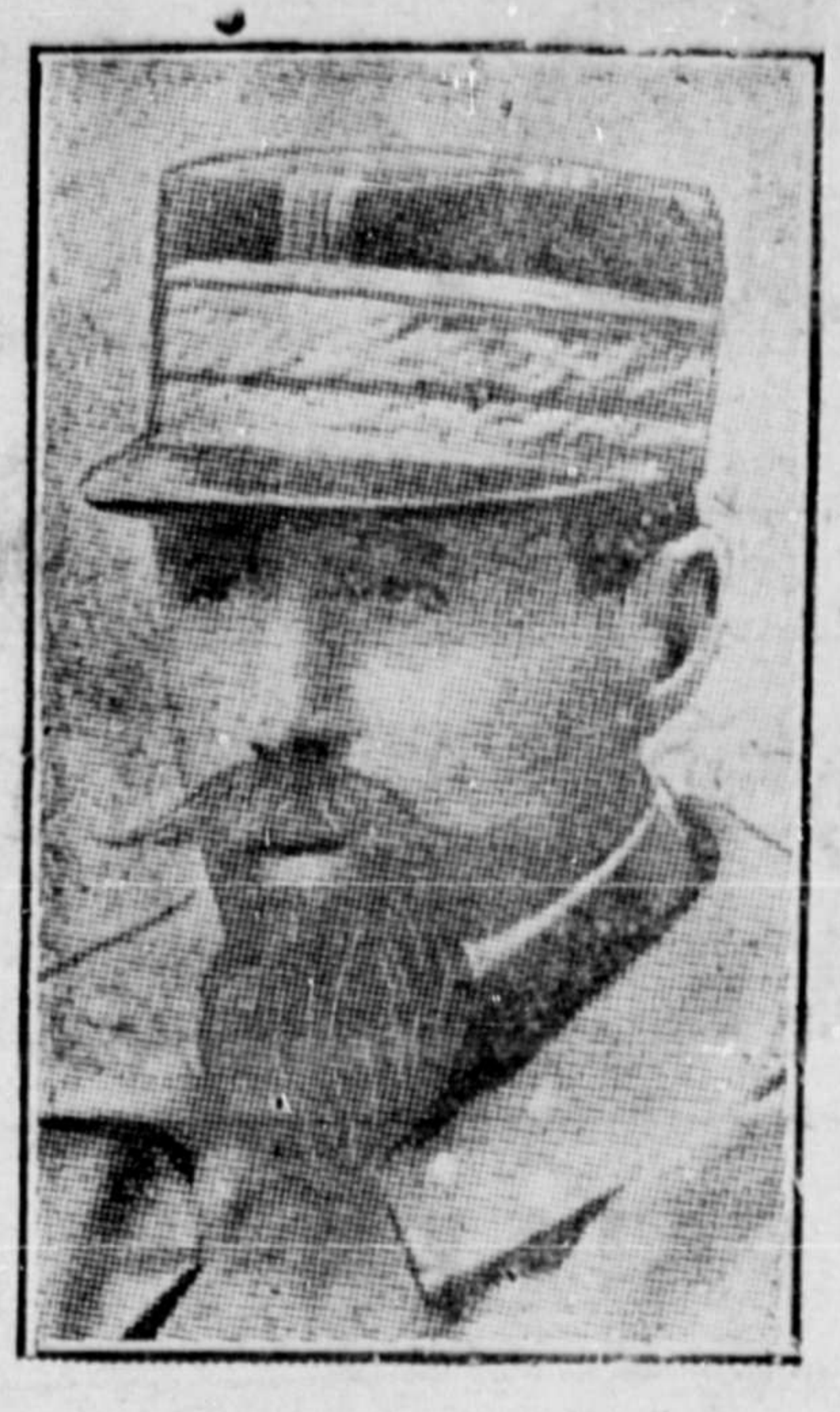
GENERAL GOURAUD, K. C. M. G. Formerly commander of the French forces at the Dardanelles, where he lost an arm, has been given a new command in the French army.

Liver Sluggish? You are warned by a sallow skin, dull eyes, biliousness, and that grouchy feeling. Act promptly. Stimulate your liver—remove the clogging wastes—make sure your digestive organs are working right and—when needed—take BEECHAM'S PILLS Largest Sale of Any Medicine in the World. Sold everywhere. In boxes, 25 cents.