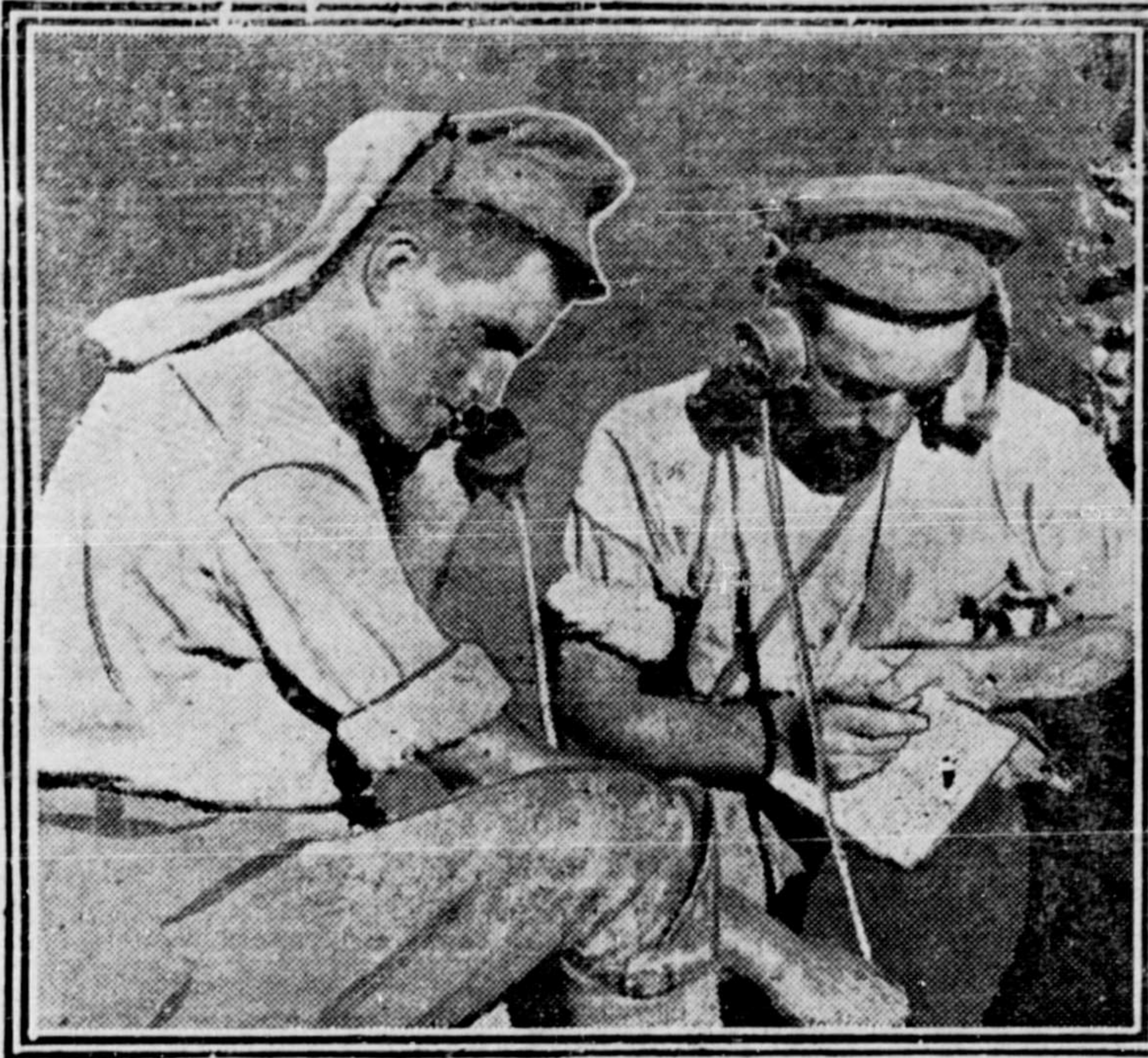
BUSY WIRES AT GALLIPOLI

The field telephone plays an important part in the operations, and the picture shows British soldiers at work receiving and copying orders hot off the wires at the Dardanelles.