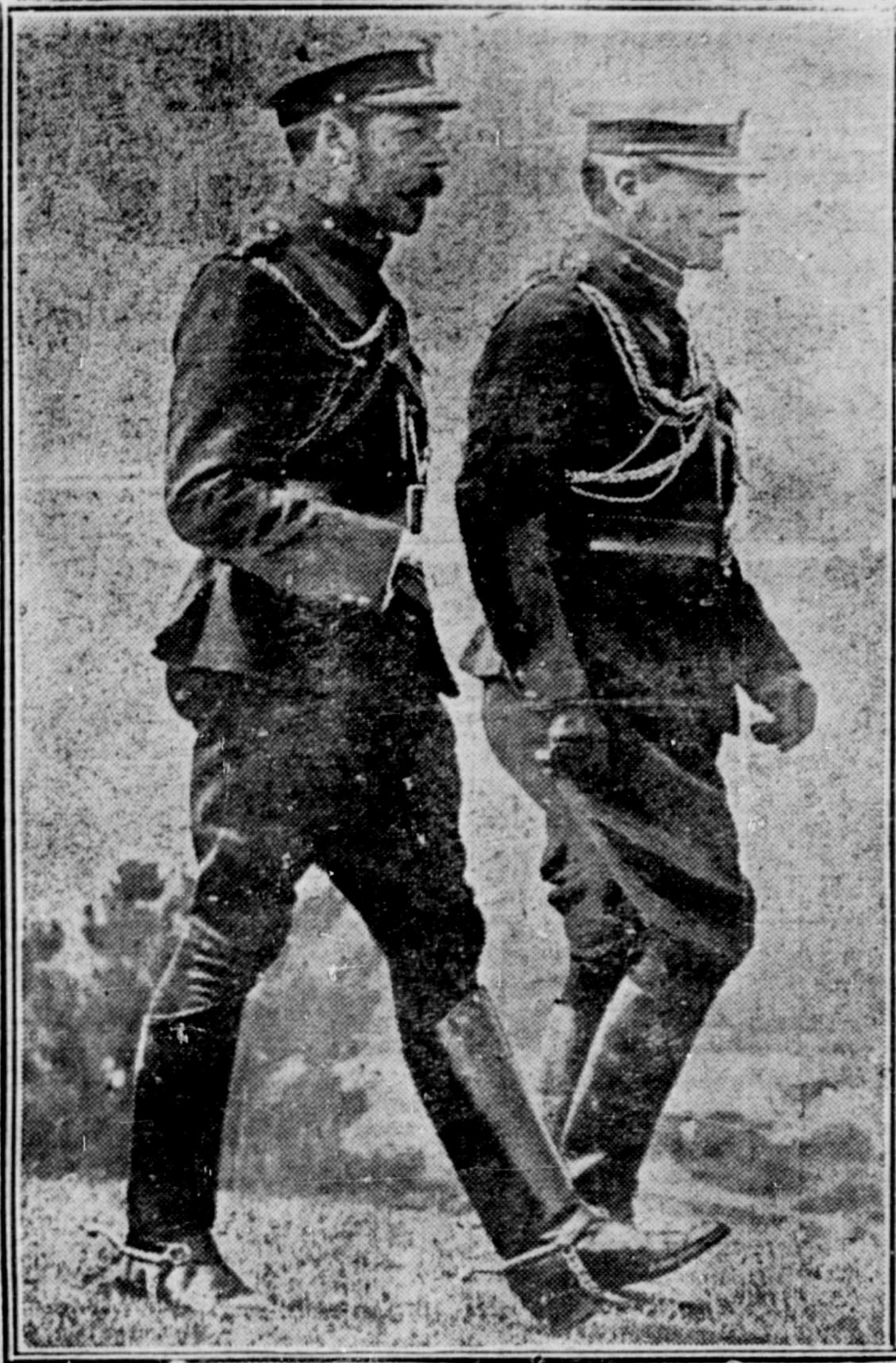
HIS MAJESTY WITH THE NEW COMMANDER