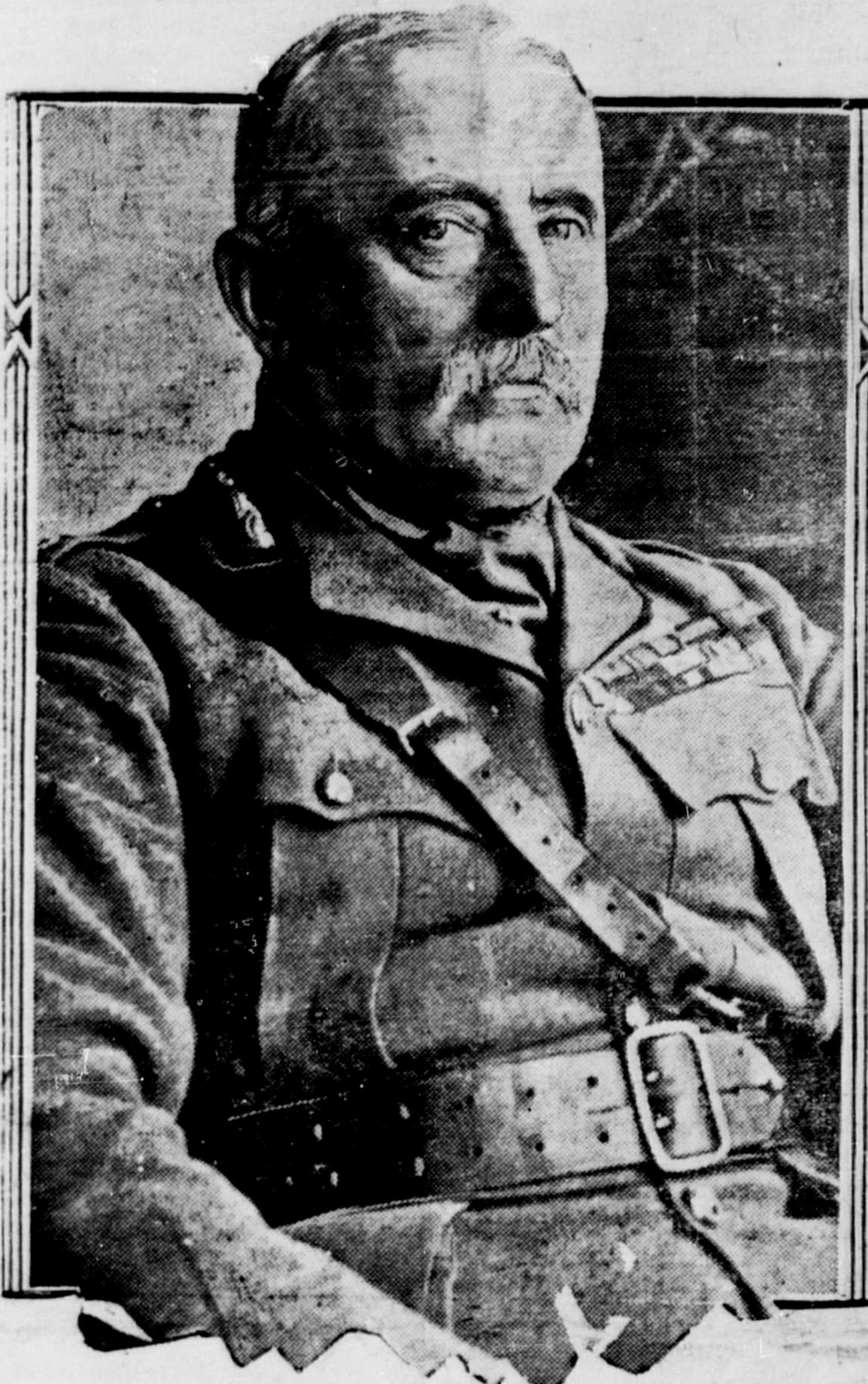
SIR JOHN FRENCH IN HIS NEW COMMAND