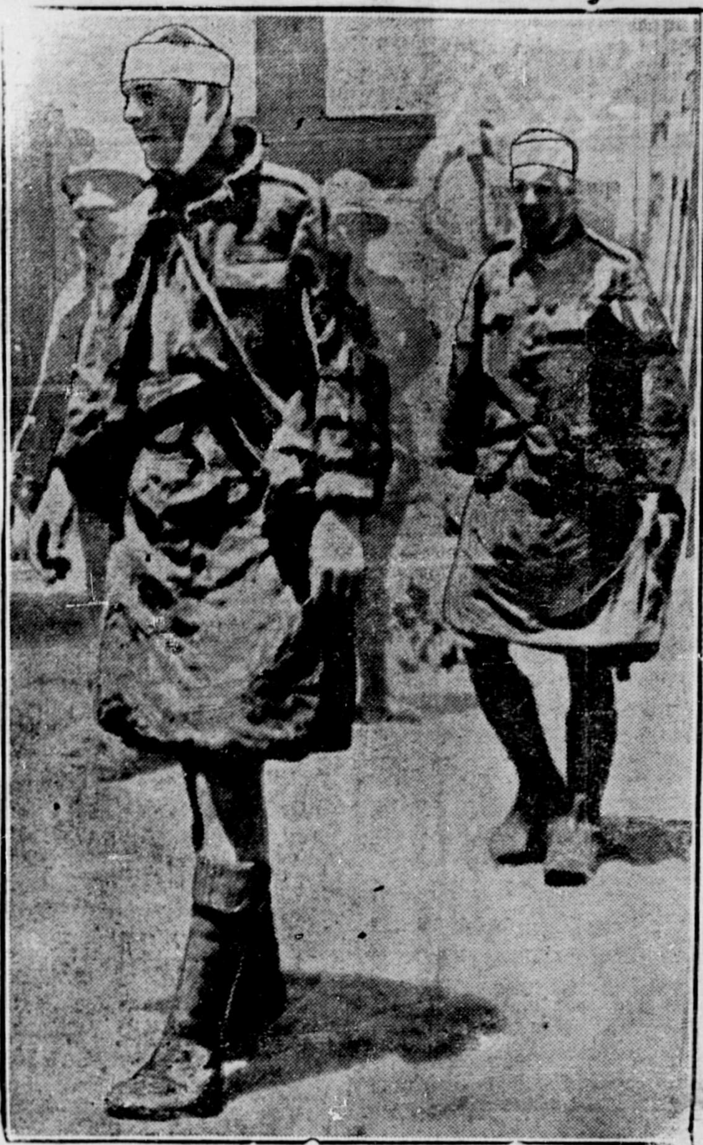
FIRST BRITISH VICTIMS OF BULGARIANS

The fire brigade was called out at 6:30 last night to the corner of 5th Avenue and Fulton Street. The only trouble was a chimney blaze, which was soon quelled.