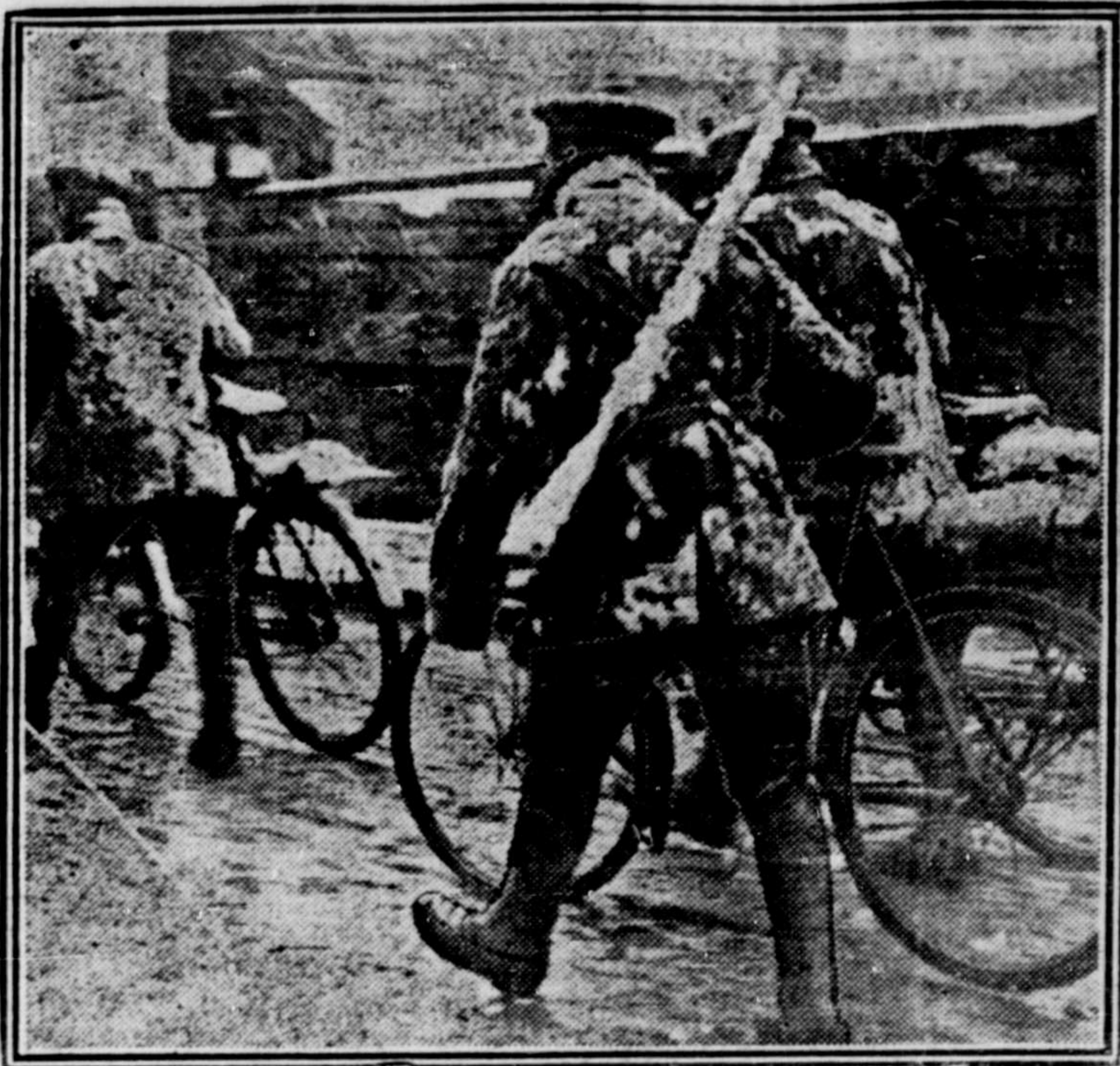
BRITISH CYCLISTS LEAVE SALONIKI IN SNOW STORM

Photo shows conditions at Saloniki where the theatre of war holds most attention at the present time. The weather is so severe that the cycle squad have been compelled to dismount and walk.