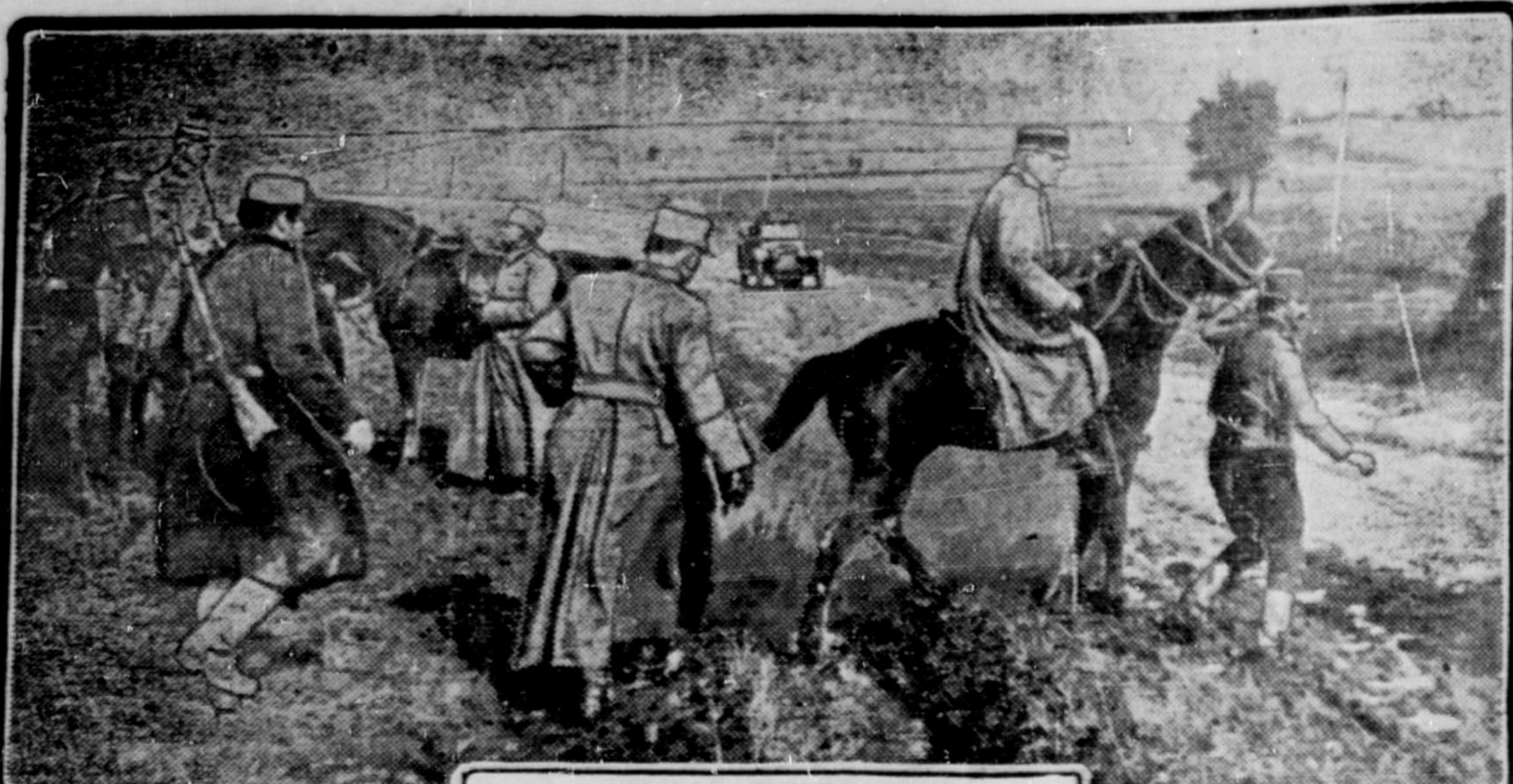
KING PETER WATCHING THE RETREAT