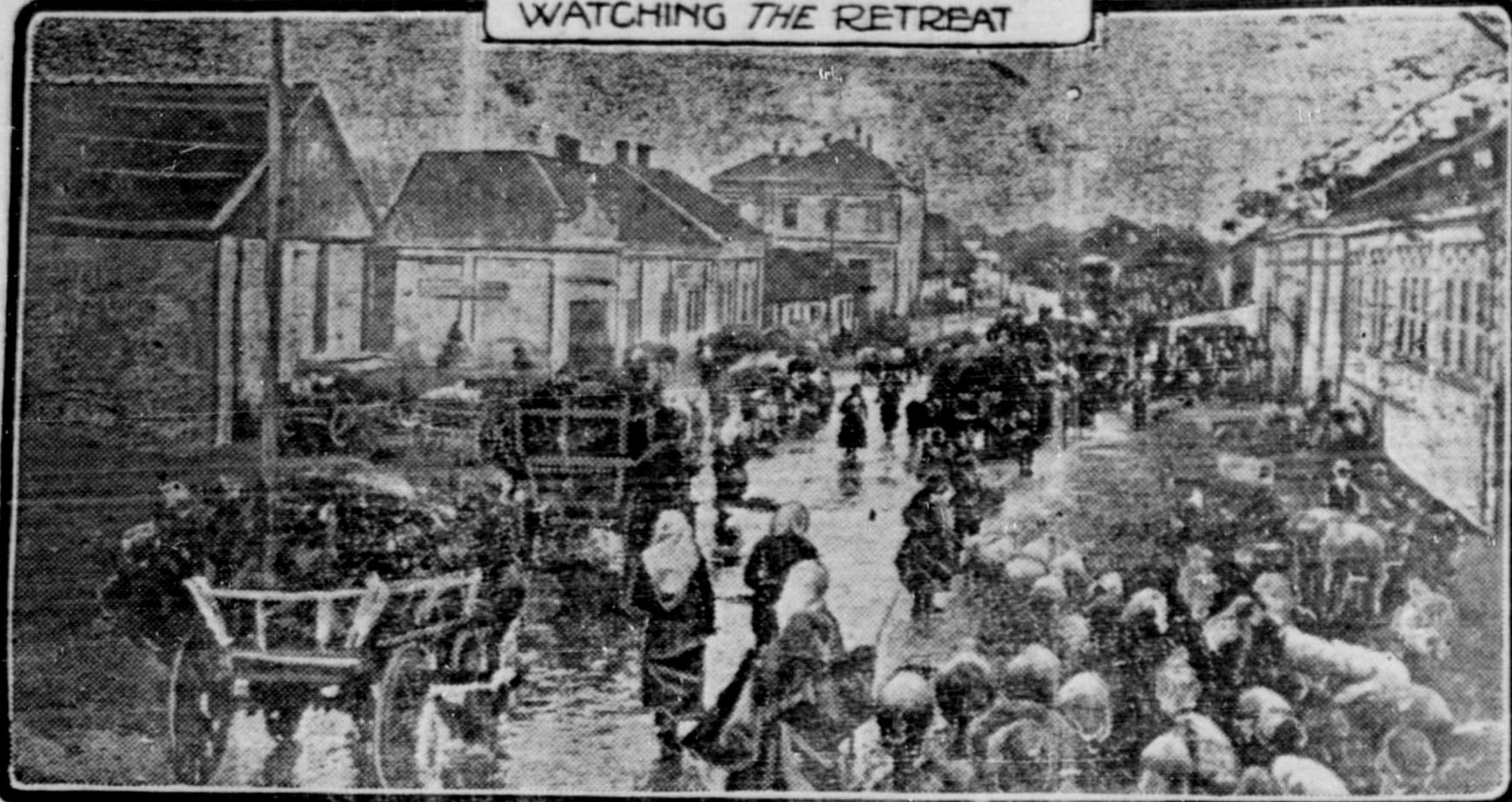
THE FLIGHT THROUGH THE TOWN OF TABARI