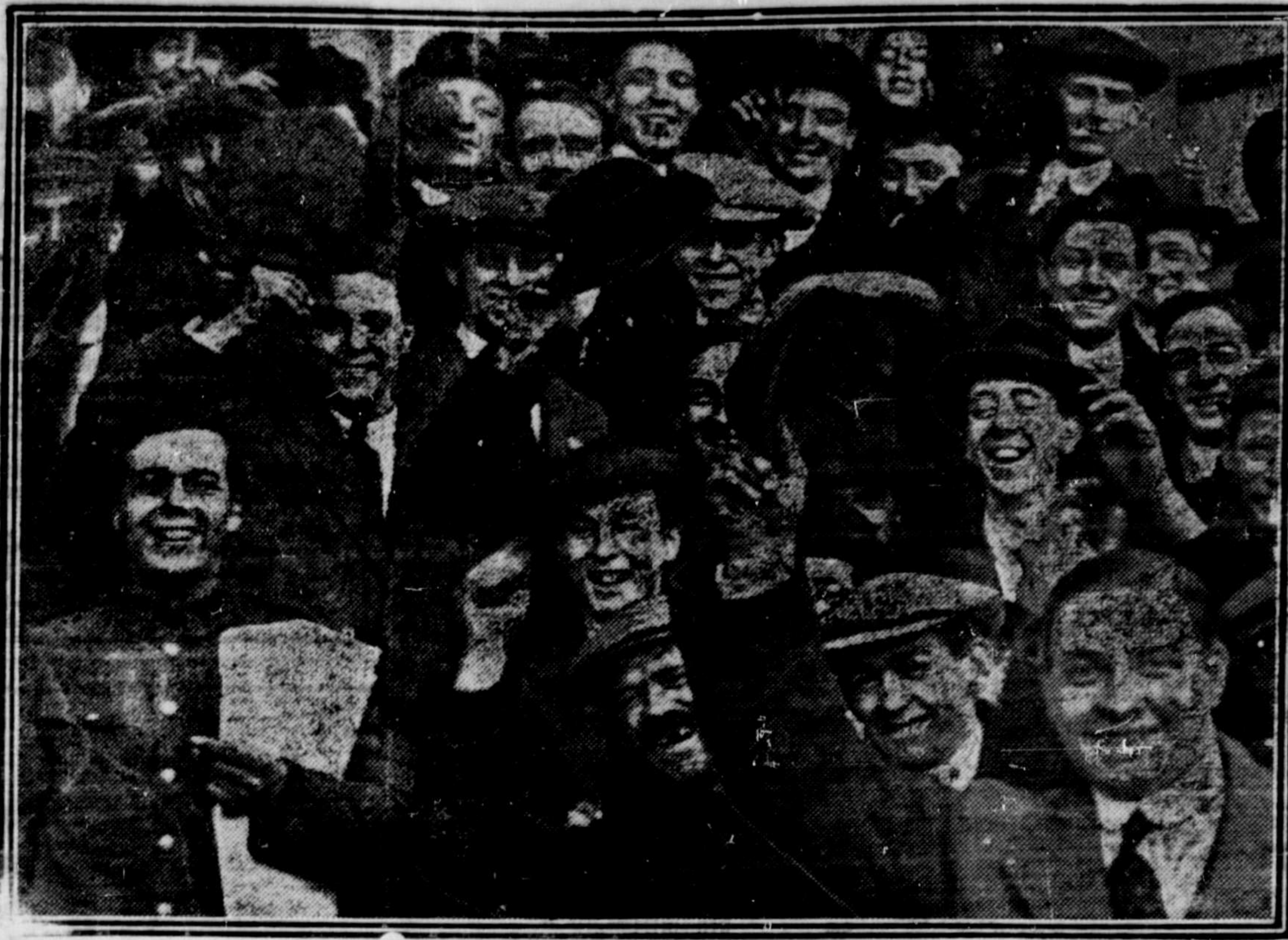
LAST MINUTE DERBY RECRUITS.—The pressure of would-be recruits on the last day of the Lord Derby Recruiting Campaign was such that the recruiting offices could not close their doors, and the work was extended over Sunday. It was a physical impossibility to cope with the crowds.

Dated this 23rd day of December, A. D. 1915. Apr. 2.