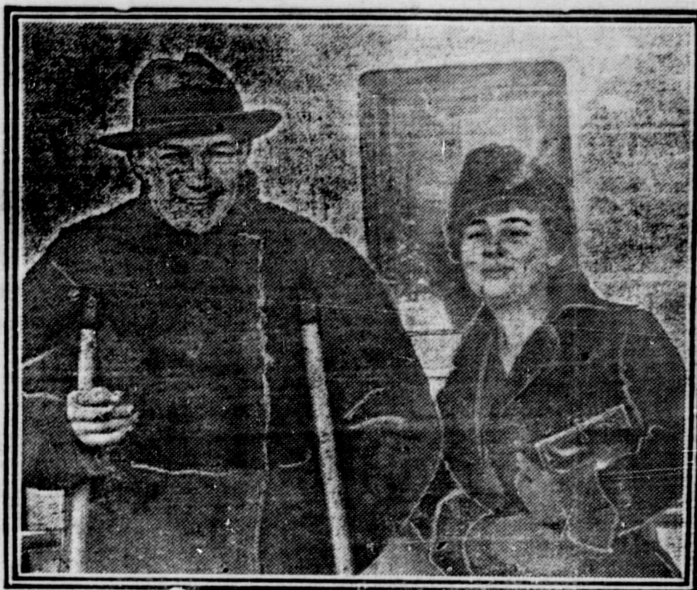
WOUNDED AMERICAN AVIATOR AND HIS CAPTIVE

Good wood cut to any length, $5.00 cord. 2 feet—$4.50, 4 feet—$3.50. Also best lump coal. J30. PONY EXPRESS.