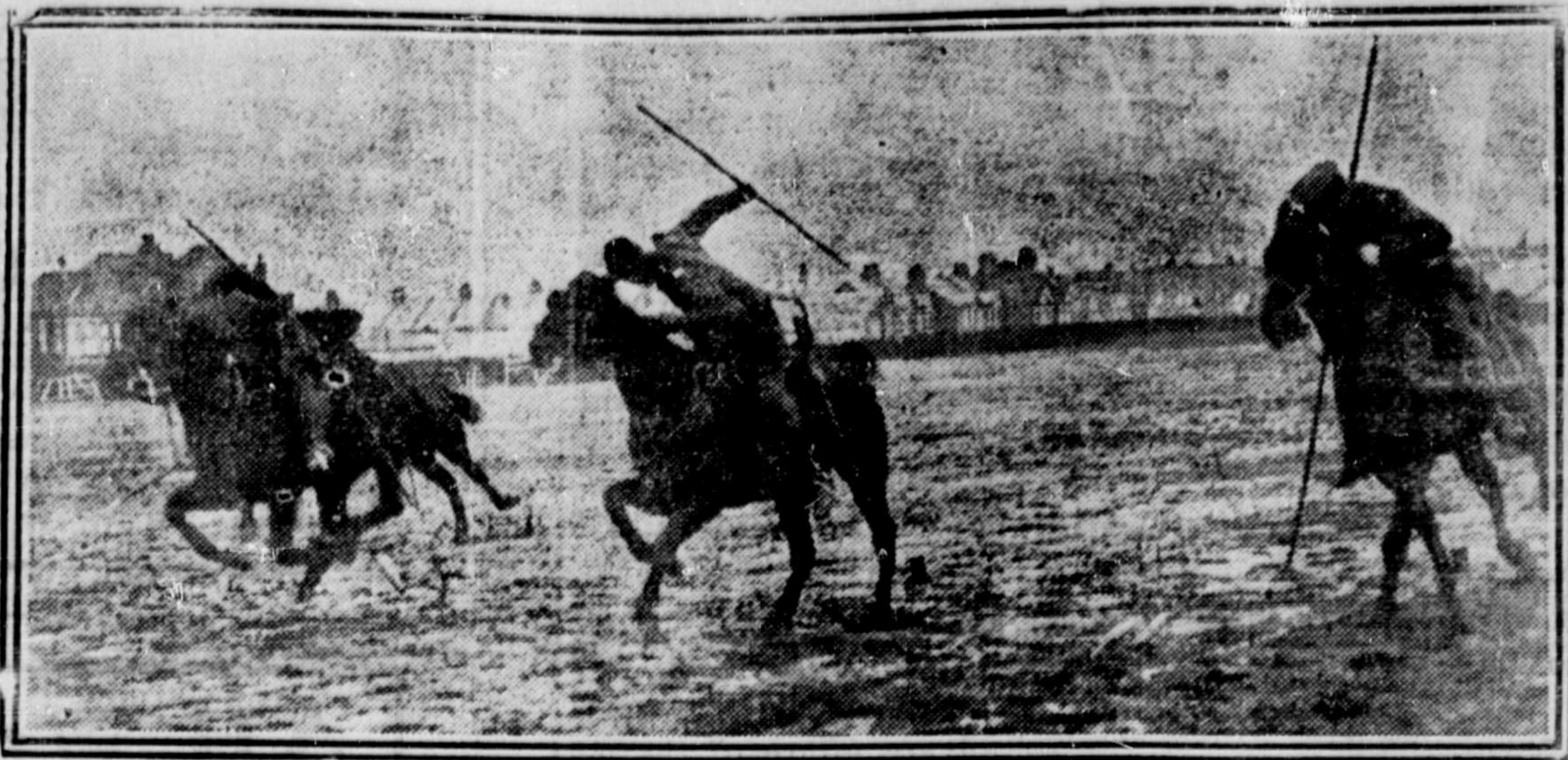
CANADIAN CAVALRY PRACTICE FOR CHARGE ON THE GERMANS.—While waiting for orders to start against the German lines, Canadian cavalrymen practice at sword fighting. The horses are protected as well as the men with hoods and pads against sword cuts and injuries.

Dated this 23rd day of December, A. D. 1915. Apr. 2.