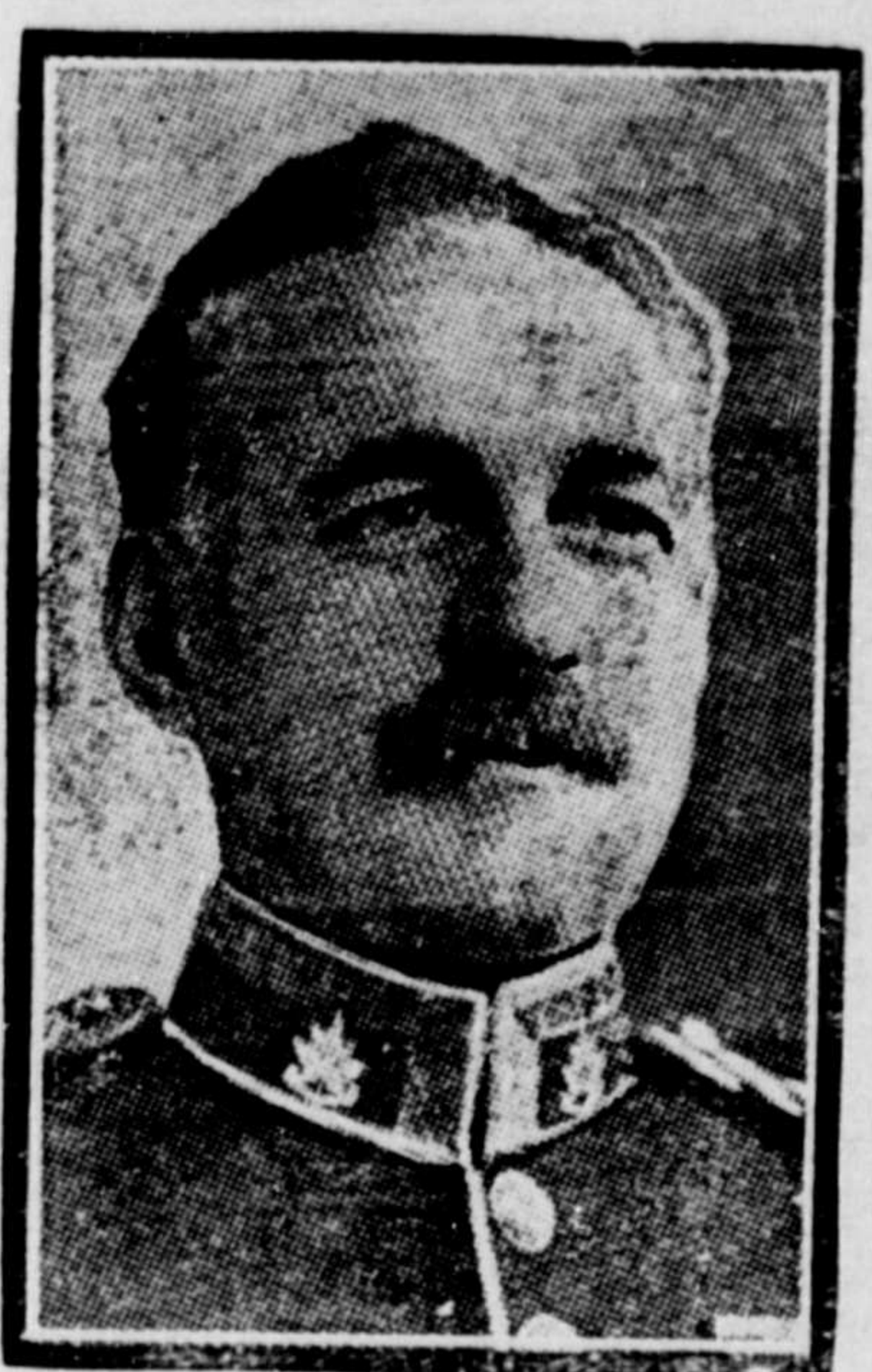
COL. S. C. NEWBURN Adjutant General of Toronto Division who will be given command of one of the 21 new divisions to be sent to the front from Canada.

Good wood cut to any length, $5.00 cord. 2 feet—$4.50, 4 feet—$3.50. Also best lump coal, J30. PONY EXPRESS.