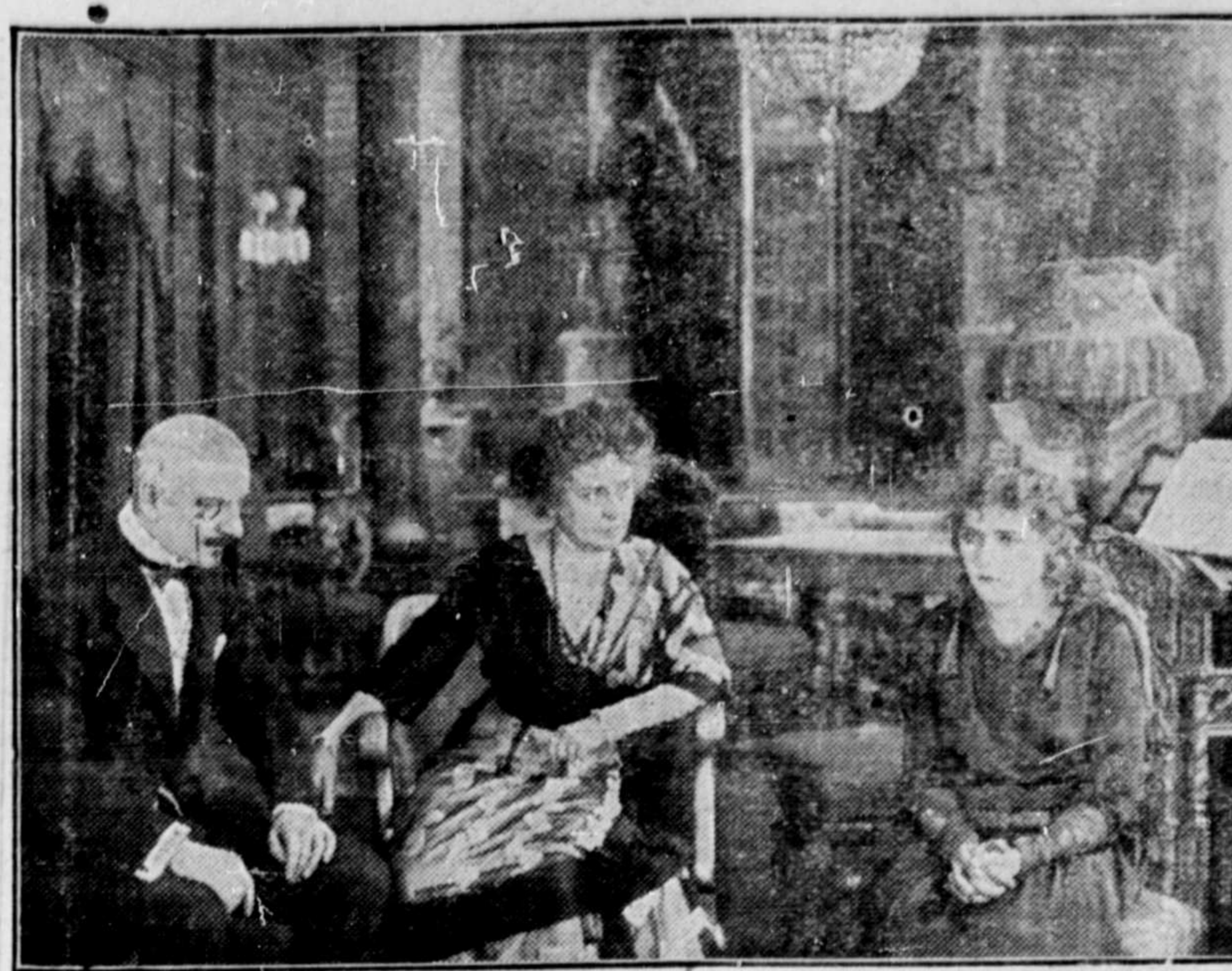
MARY PICKFORD IN "RAGS" AT THE WESTHOLME TONIGHT