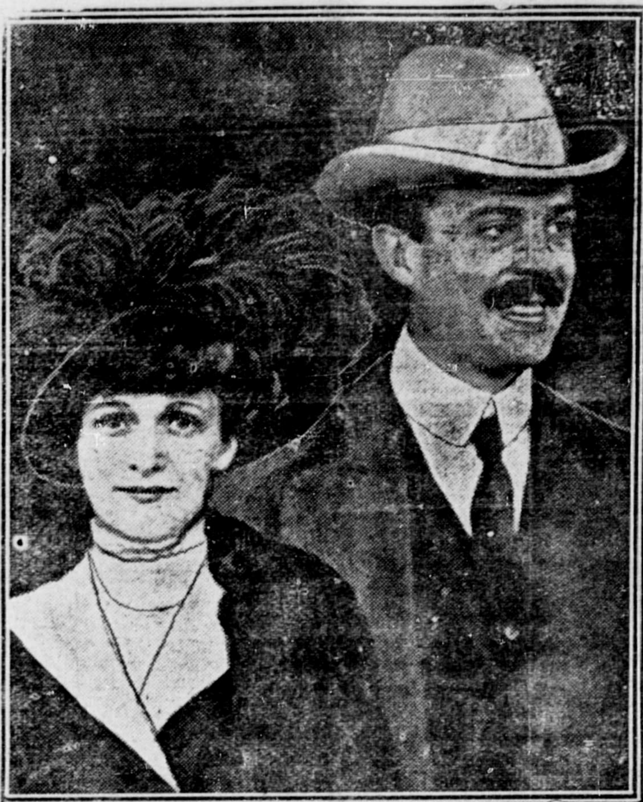
LORD AND LADY ASTOR

There will be some rousing speeches at the Liberal meeting on Friday in the Stork Block.