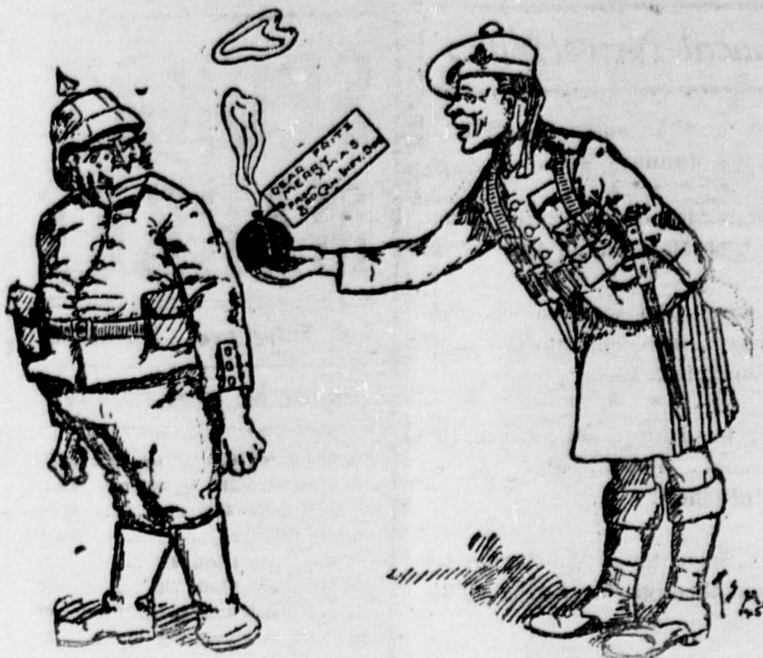
"FROM THE CANADIAN S. OTS TO THE GERMANS" Christmas card of the 3rd Canadian Infantry Brigade, which includes regiments from all parts of Canada.

At times it takes courage and firm resolution to tell the simple truth.