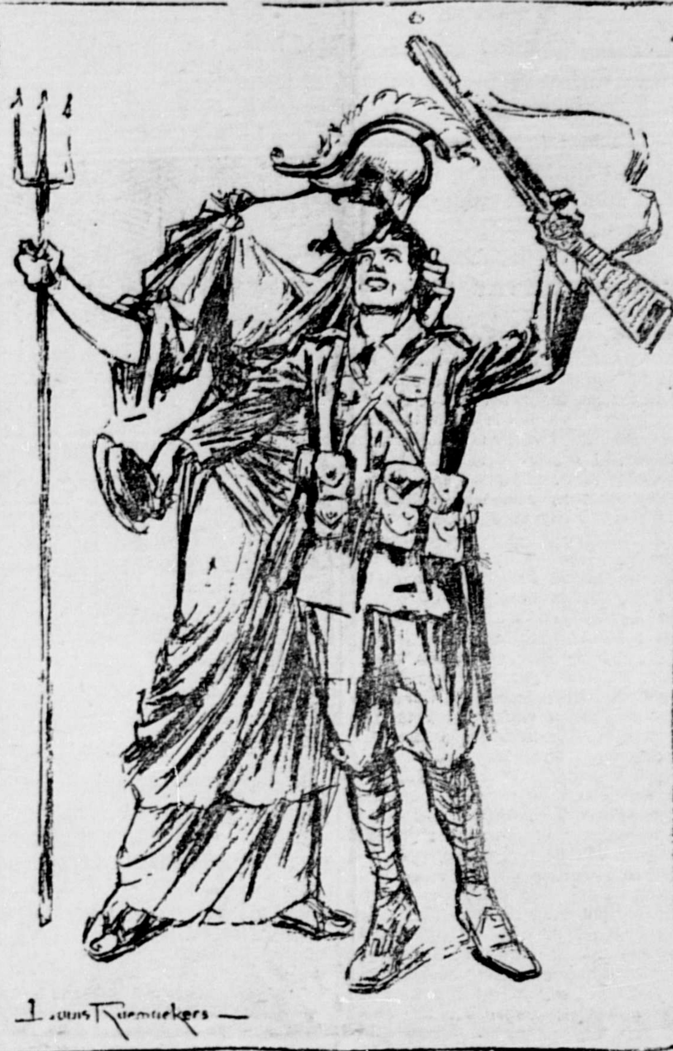
"BRITANNIA'S CALL TO HER SONS"