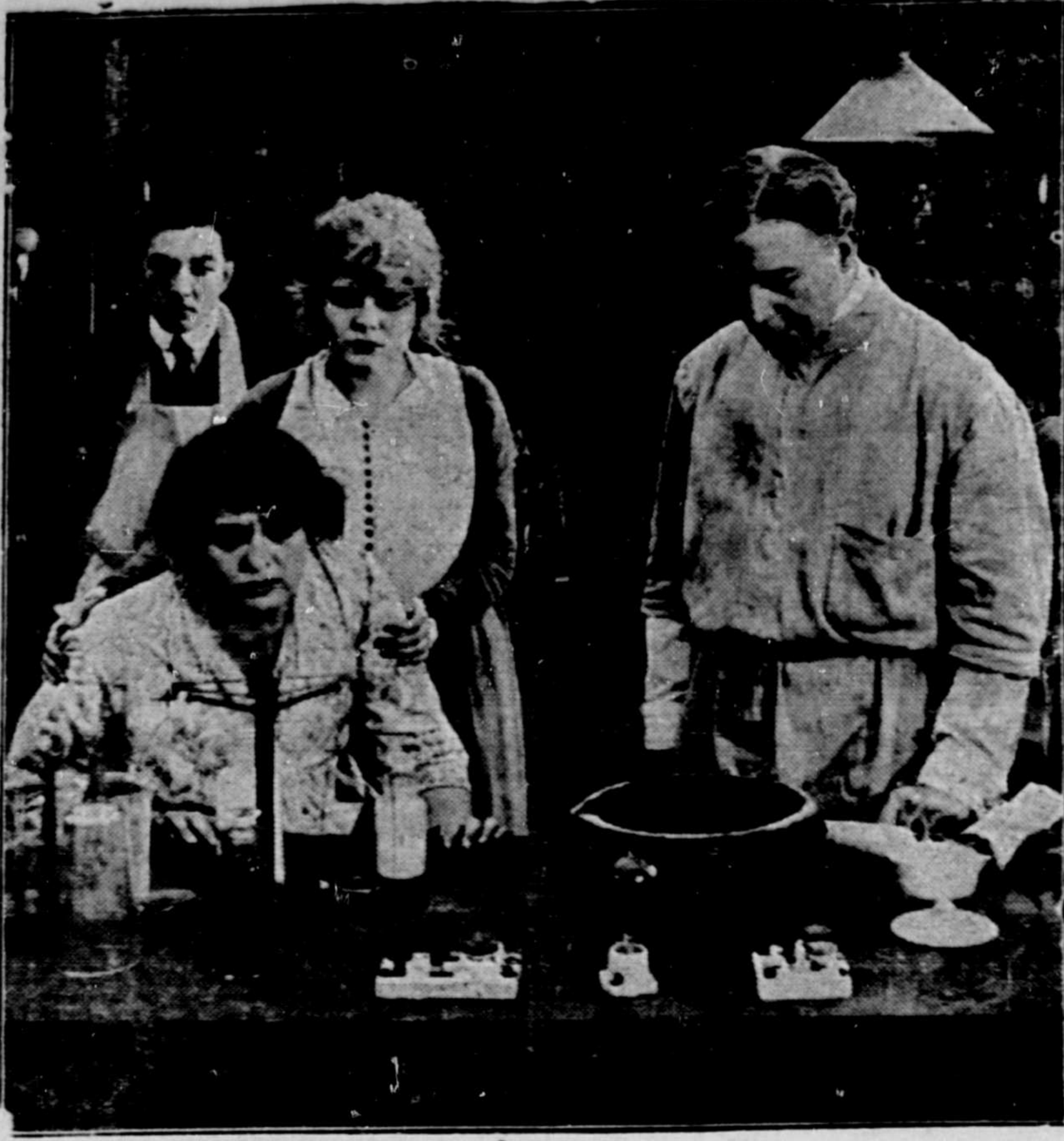
Eve gets the news of the death of Alexis—Scene from "The Clue," a most baffling detective drama at the Westholme tonight.

CAVENAILE & HANNAN PURVEYORS OF THE HIGHEST GRADES OF ALL LINES OF GROCERIES AND TABLE DAINTIES PHONE 493. 3rd AVENUE AND 2nd ST. "THE STORE THAT IS DIFFERENT"