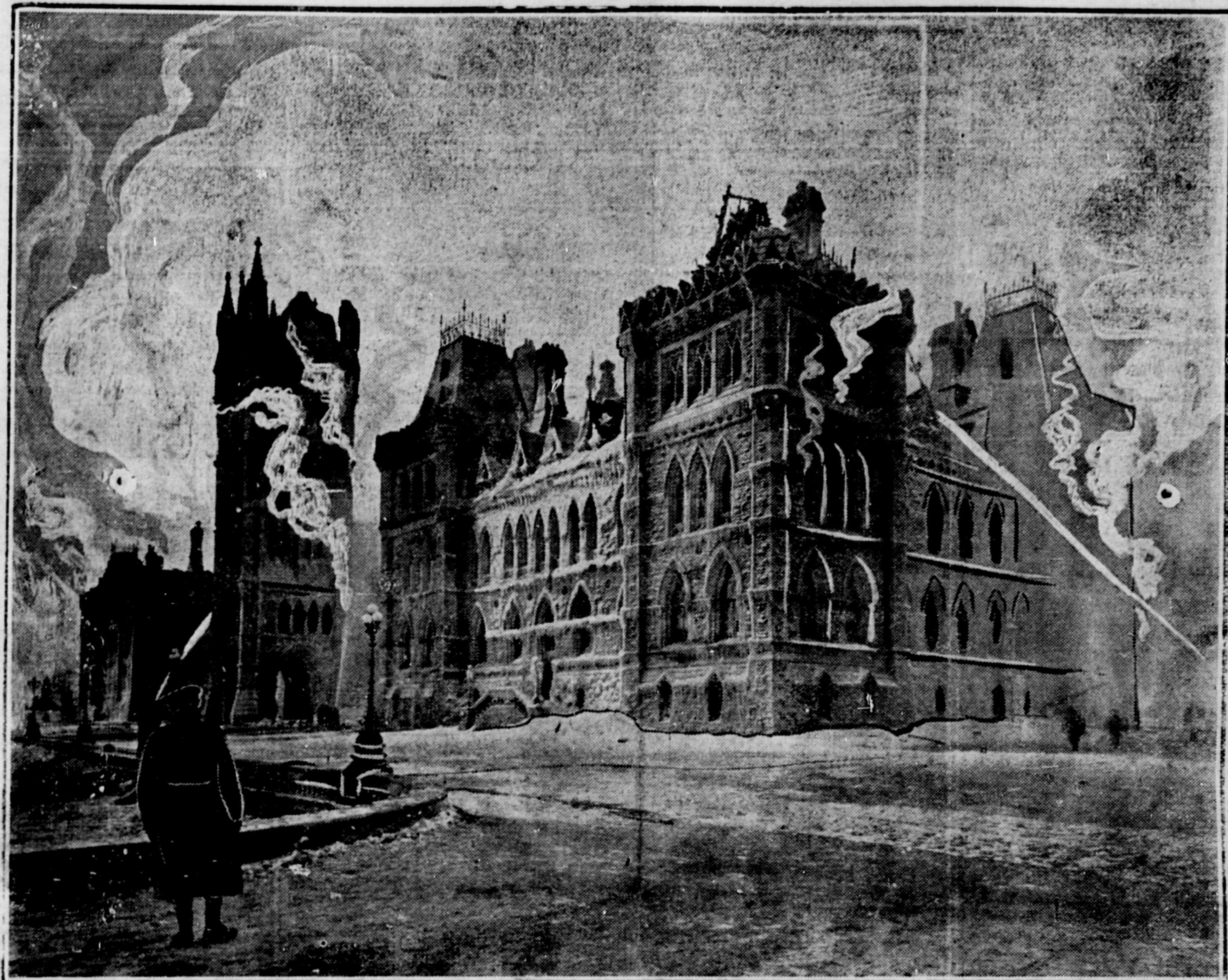
THE DESTRUCTION OF THE HOUSE OF COMMONS.—Picture shows the ruins of the Ottawa House of Commons, with fire hose still playing on the smouldering ruins.

Major De Civrieux states that the conquest is more important than that of any other fortress in the world as it dominates all the routes to Asia. The forts were carried after five days of unprecedented assault.