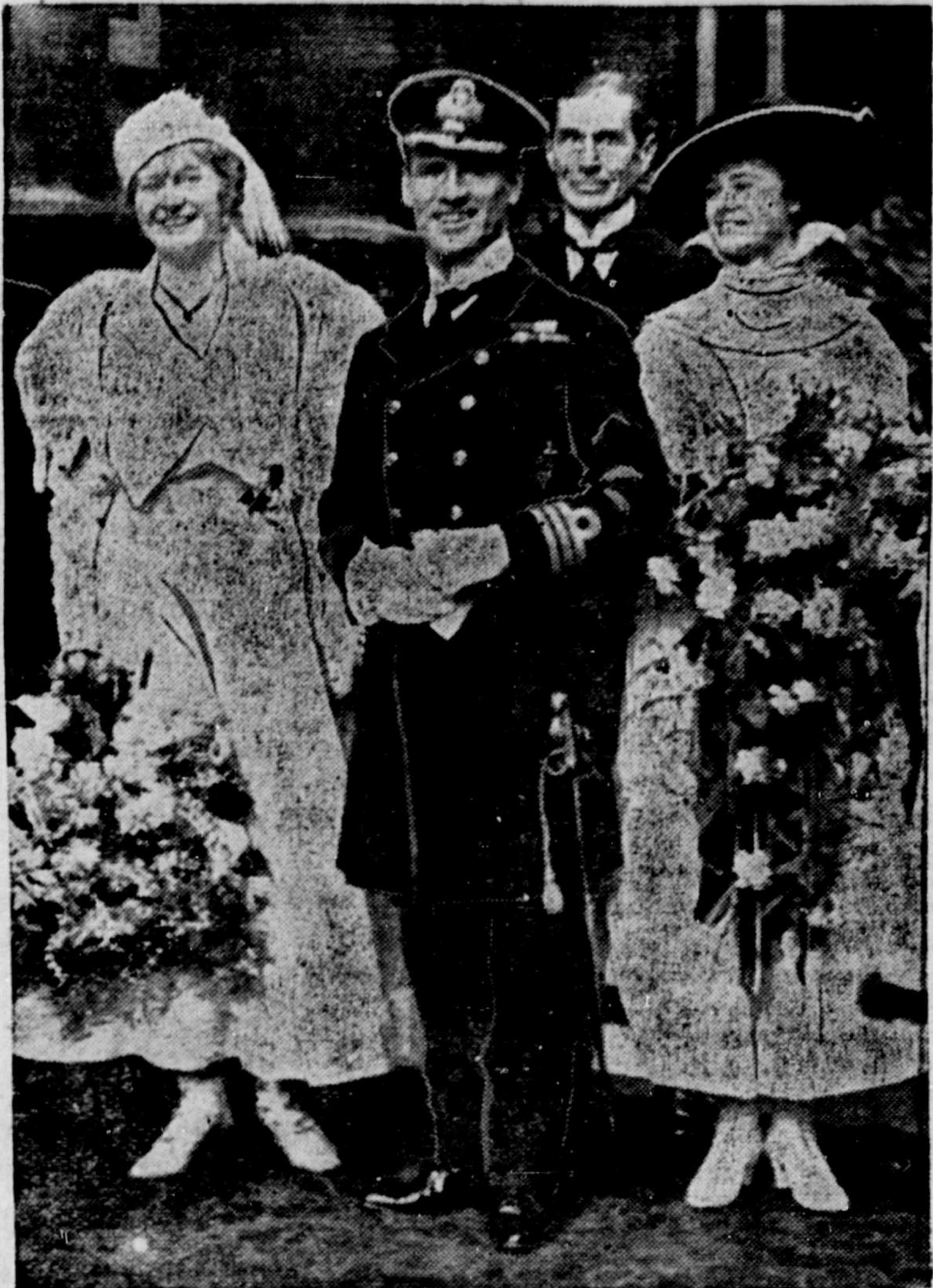
AN ALLIANCE BETWEEN BRITAIN AND SWEDEN