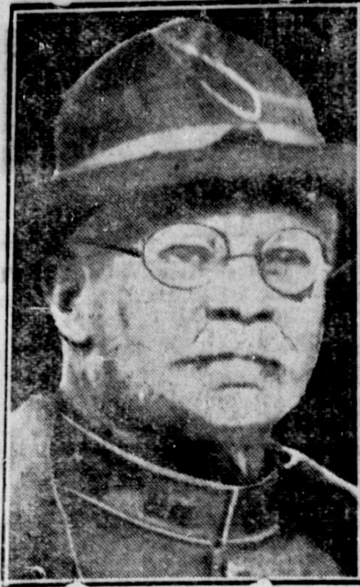
GENERAL HUGH SCOTT