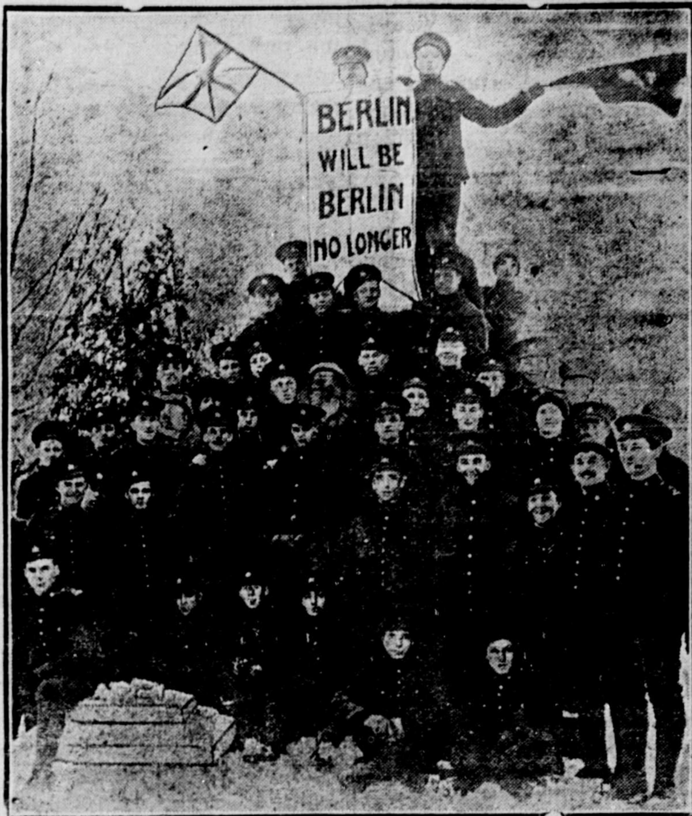
SOLDIERS CELEBRATING FALL OF BERLIN MONUMENT

Maritime Province Social in the Baptist Church tonight. Everybody welcome.