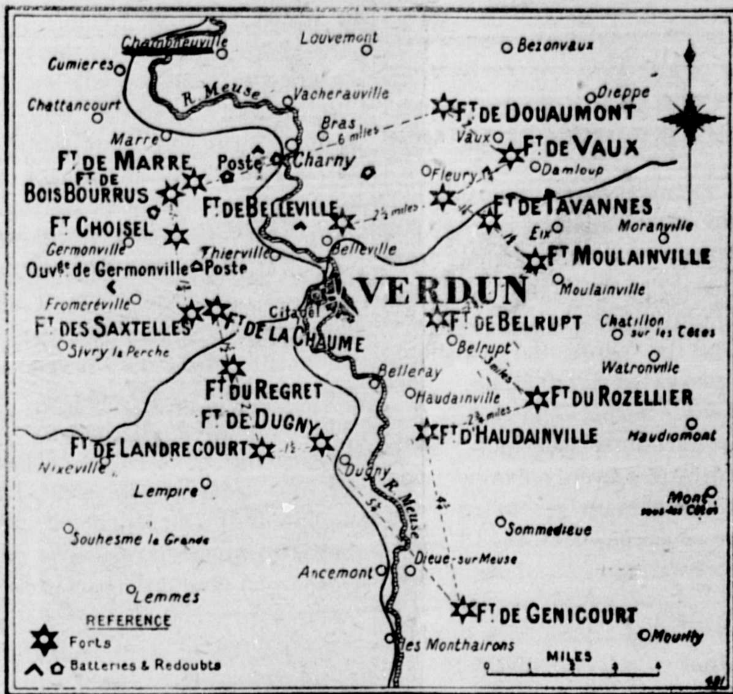
VERDUN FOREST AND SURROUNDING COUNTRY