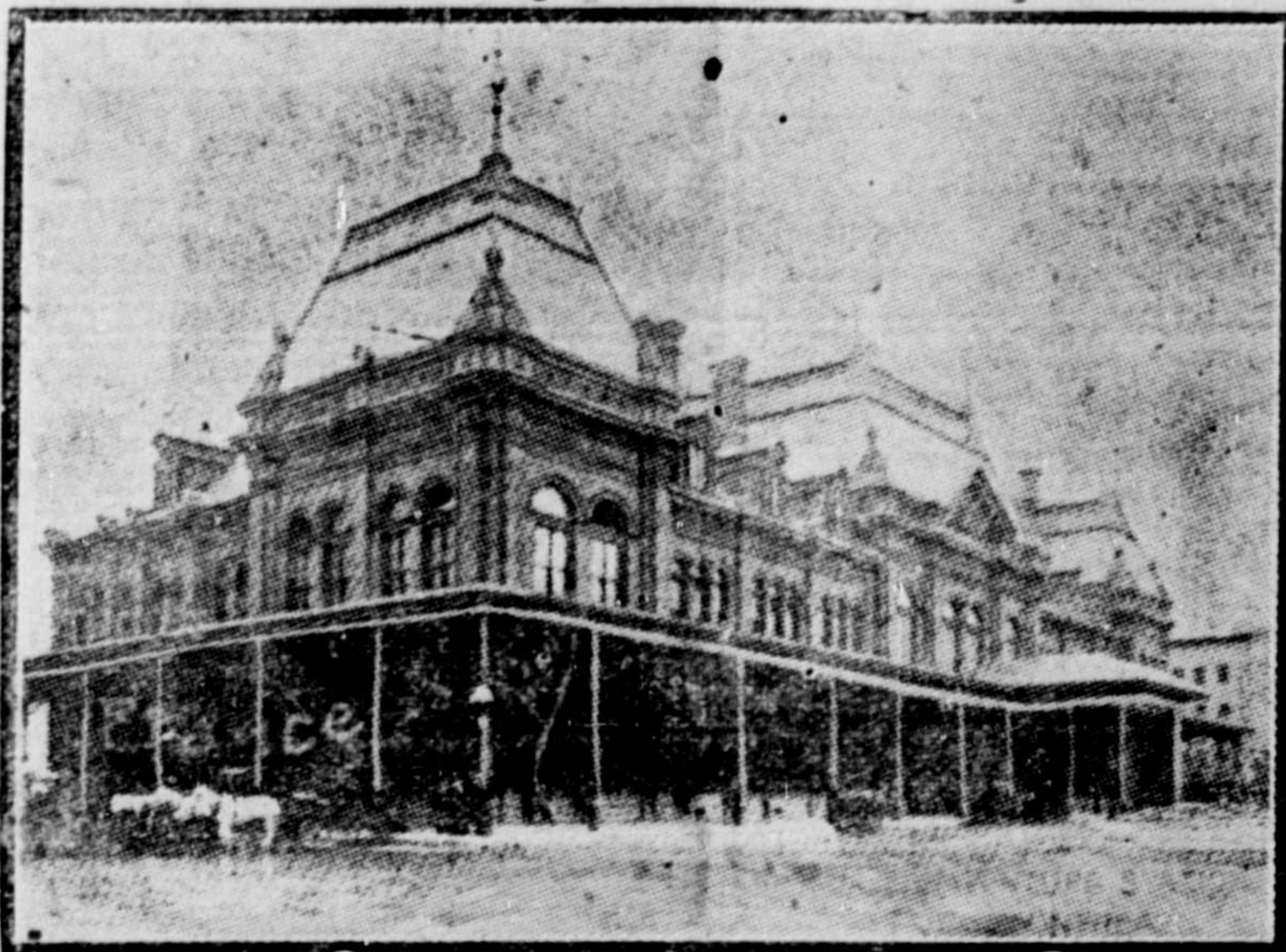
BONA VENTURE STATION, MONTREAL, DESTROYED BY FIRE