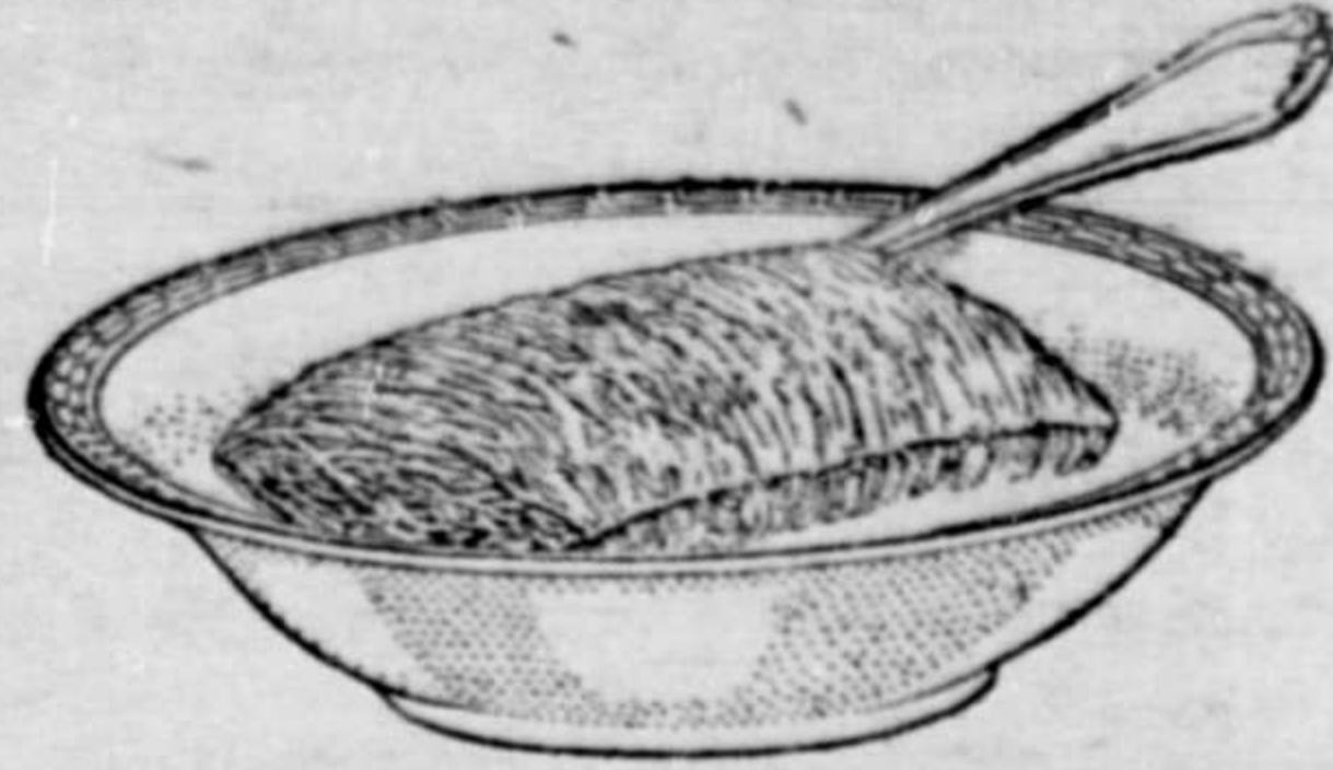
Made in Canada.

Your Ninety-First Birthday —how are you going to celebrate it? You can live to celebrate it by eating the right kind of foods. Give Nature a chance. Stop digging your grave with your teeth. Cut out heavy meats, starchy foods and soggy pastries and eat Shredded Wheat Biscuit . It supplies all the nutriment for work or play with the least tax upon the digestive organs.