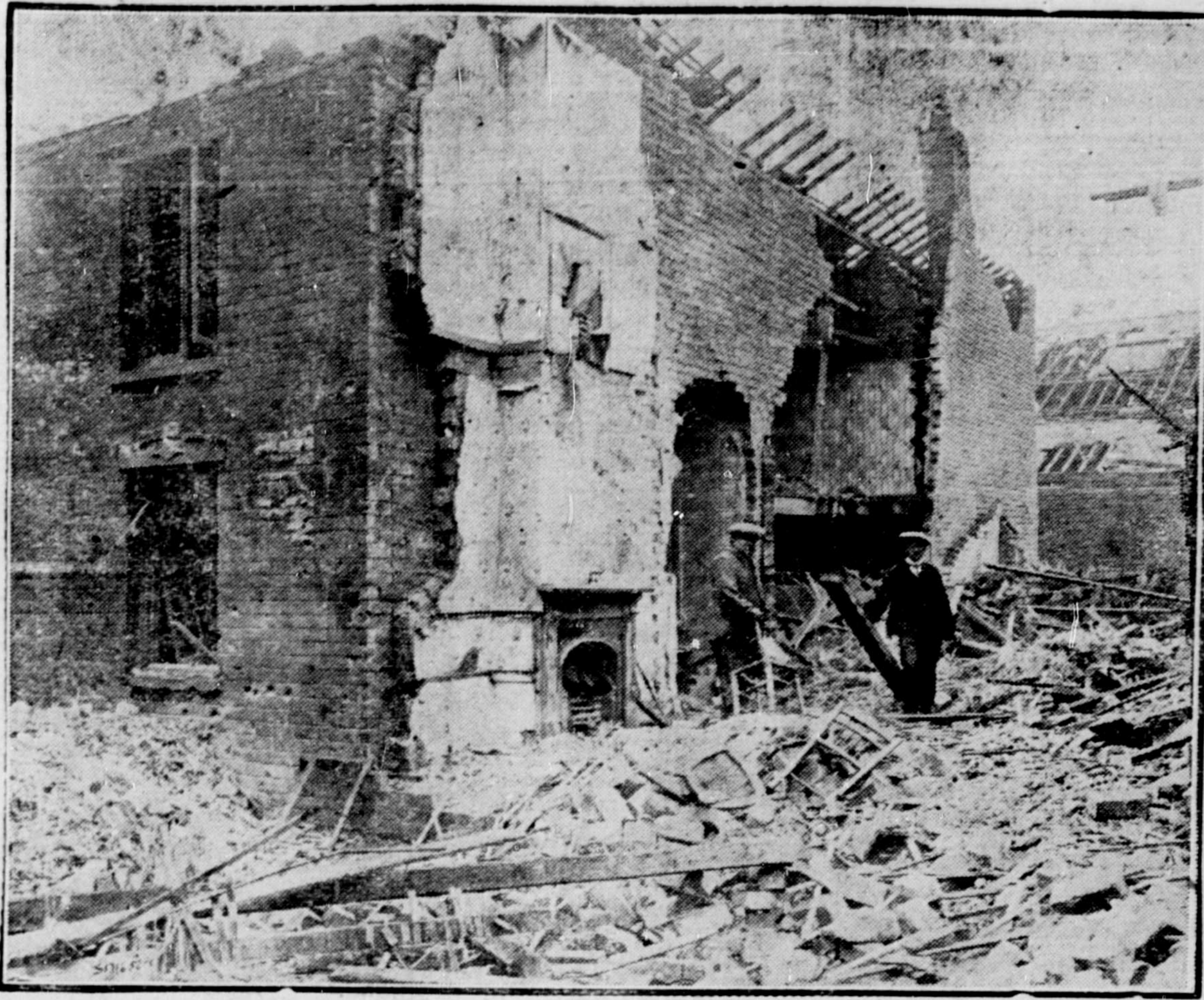
INTERIOR OF AN ENGLISH HOME WHICH WAS DESTROYED BY ZEPPELIN BOMBS.—German Zeppelins are again active in their raids on England. Recently they swooped down in the neighborhood of Liverpool and after they had retreated a number of dead and wounded were left to testify to the success of the raiders. The photo shows a number of dwellings which were destroyed.