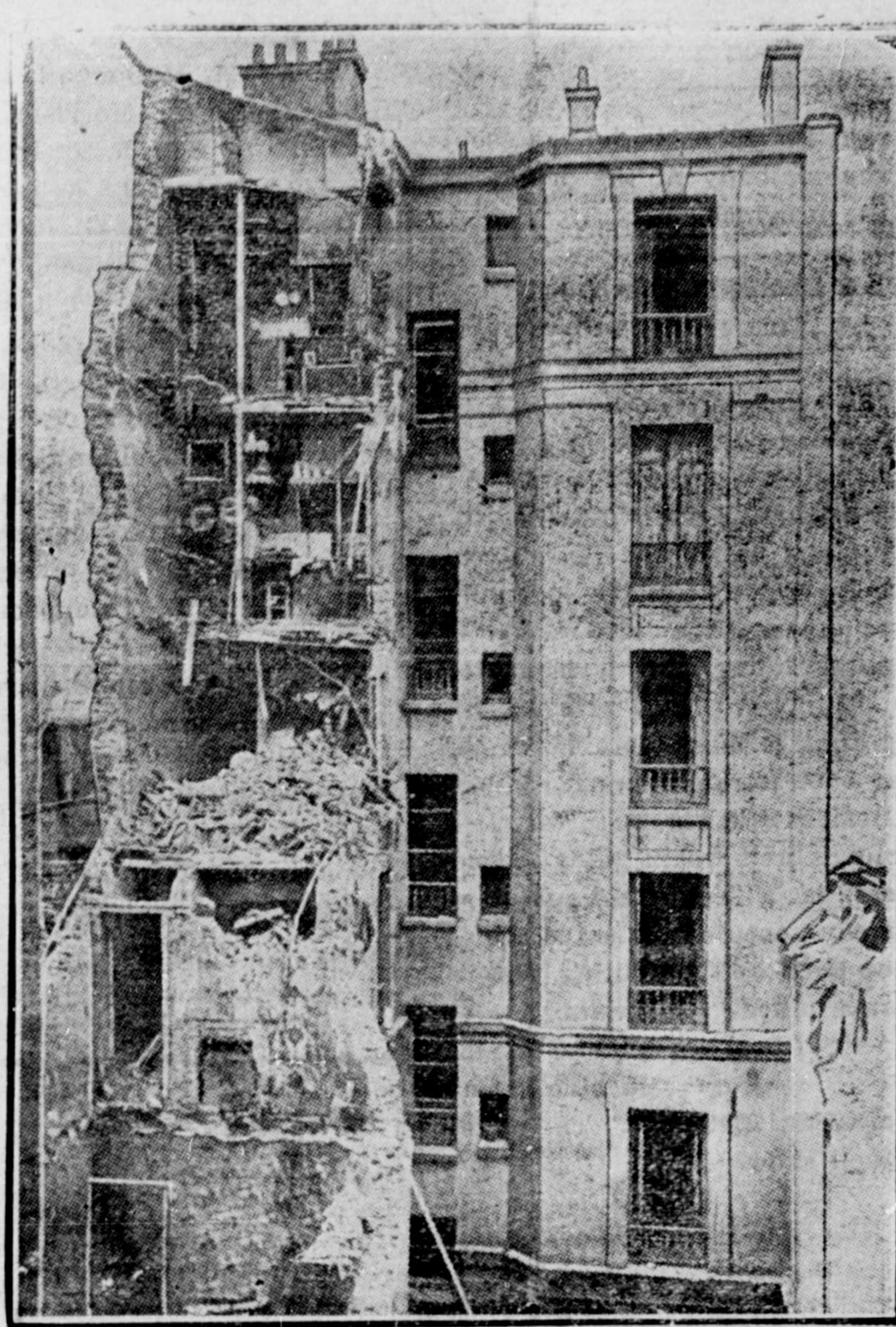
ZEPELINS RAID PARIS