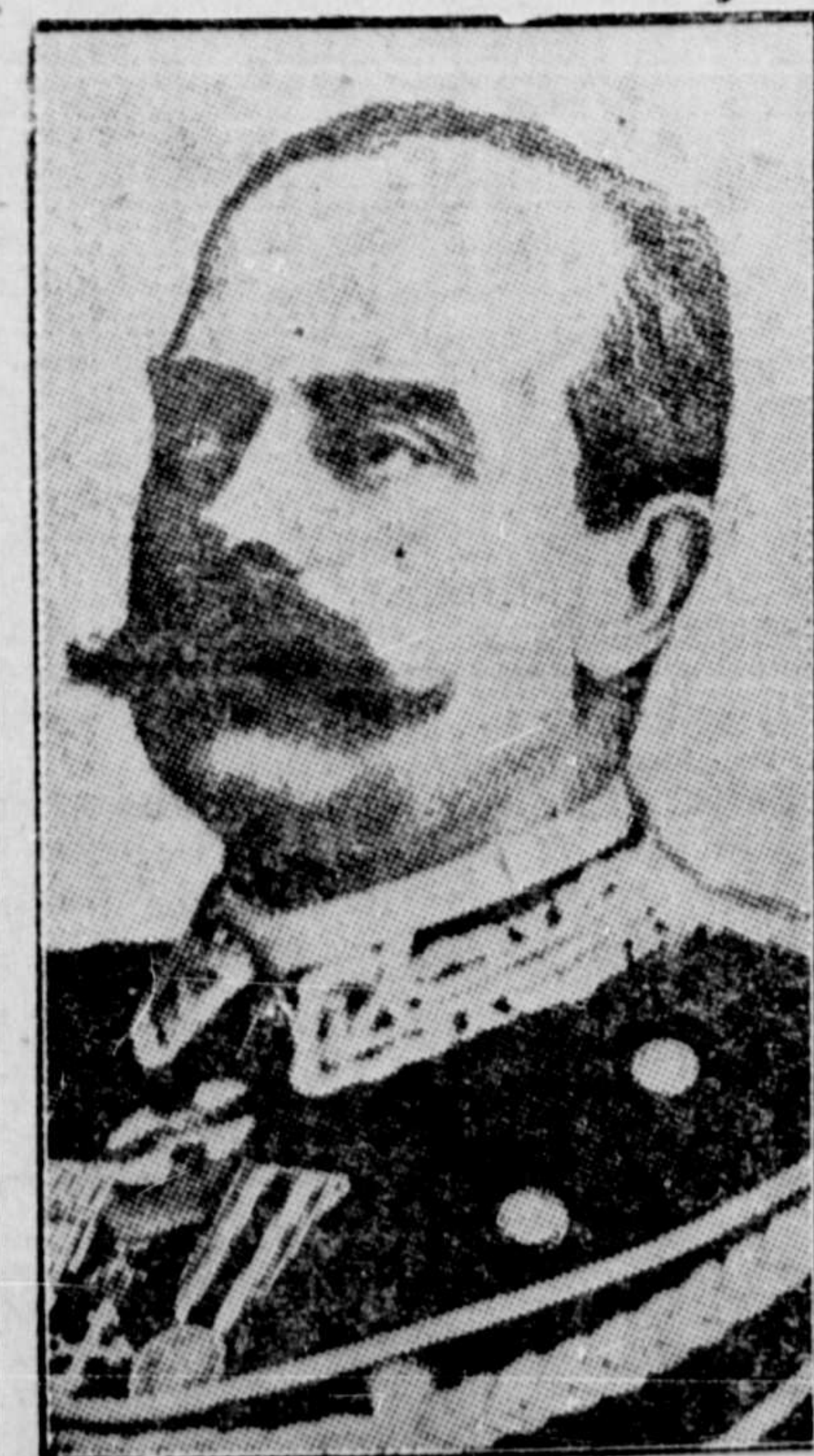
General Spingardi, former War Minister of Italy, who has challenged Italy's leading Socialist editor to a duel.

For 24 hours ending 5 a. m. March 25th, 1916. Barometer..... 29.446 Highest temperature..... 43.0 Lowest temperature..... 36.0 Precipitation..... 0.06