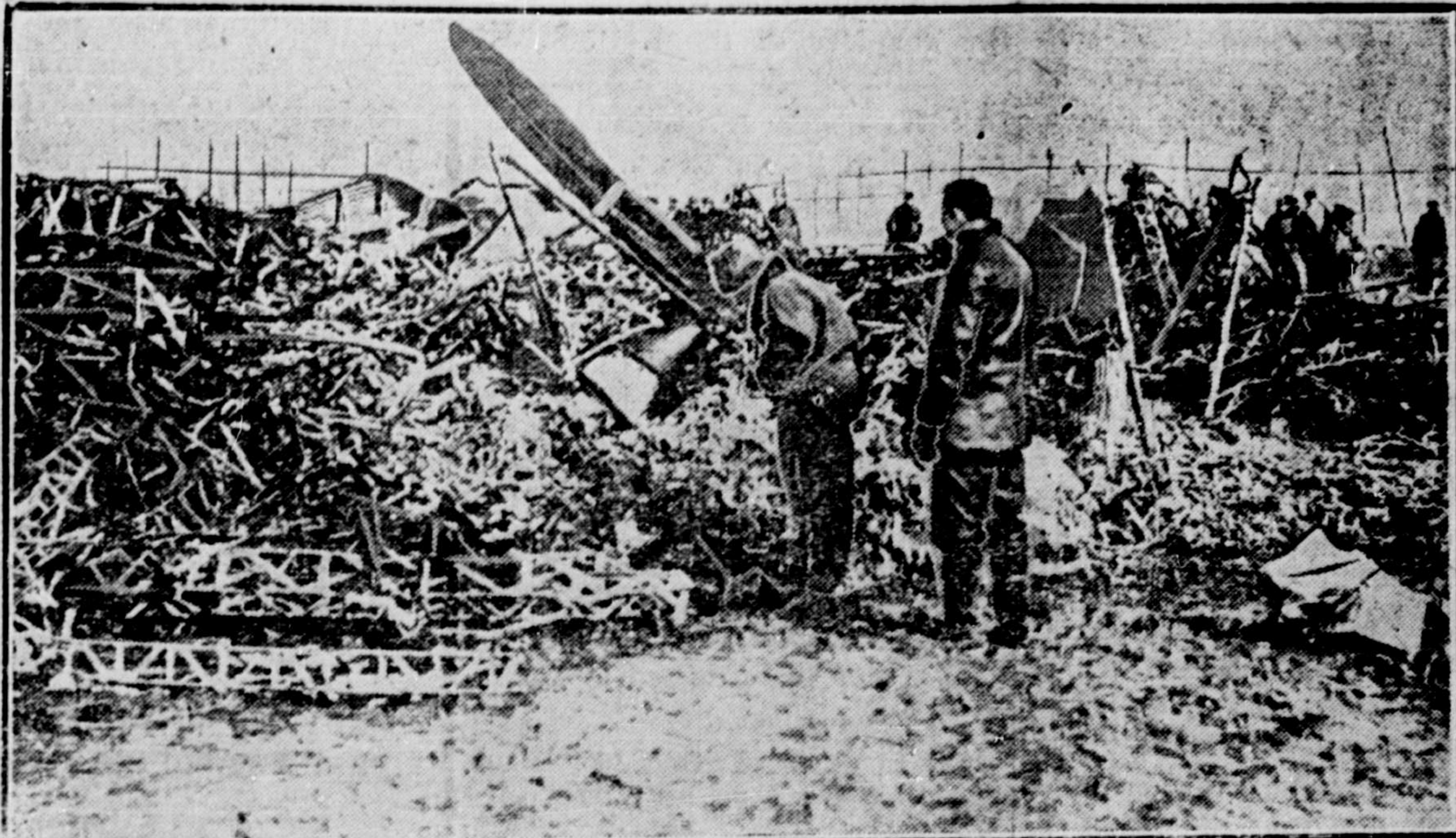
WRECKED ZEPPELIN BROUGHT DOWN BY FRENCH GUNNERS—Photo shows French gunners examining wreckage of Zeppelin L-77 after they had successfully pursued and found the vital spot through their skilled marksmanship.