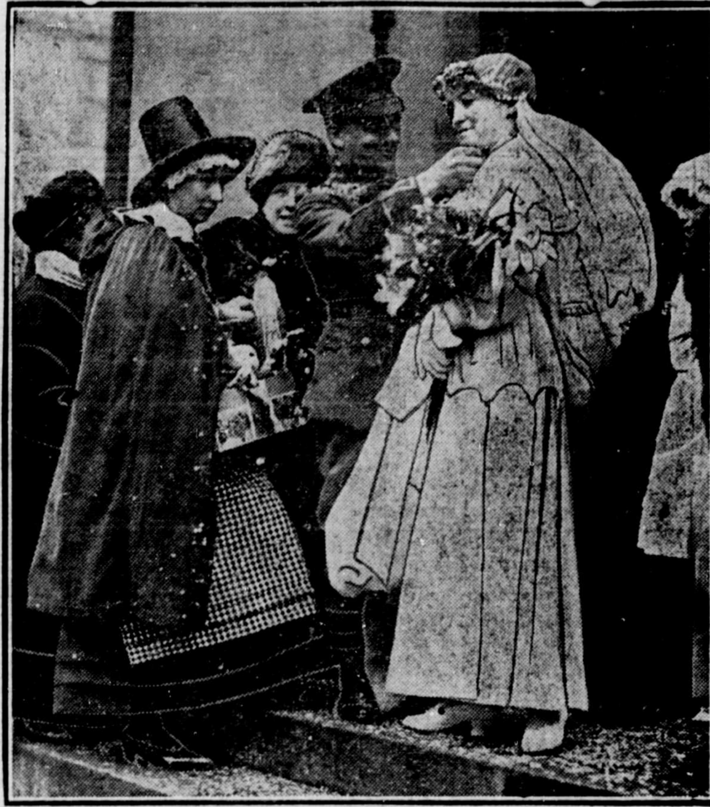
GOOD LUCK FOR WAR BRIDE ON ST. DAVID'S DAY Picture shows a Welsh girl in national costume selling flags for patriotic purpose on St. David's Day, in London. A war bride is being decorated.

the South Seas. Through a snapshot taken by a friend, his former sweetheart discovers him and writes a letter imploring him to come home, but this prodigal does not return. The Bahamian views are interesting and instructive. "The Missing Pearl," a beautiful colored film, completes a big bill.