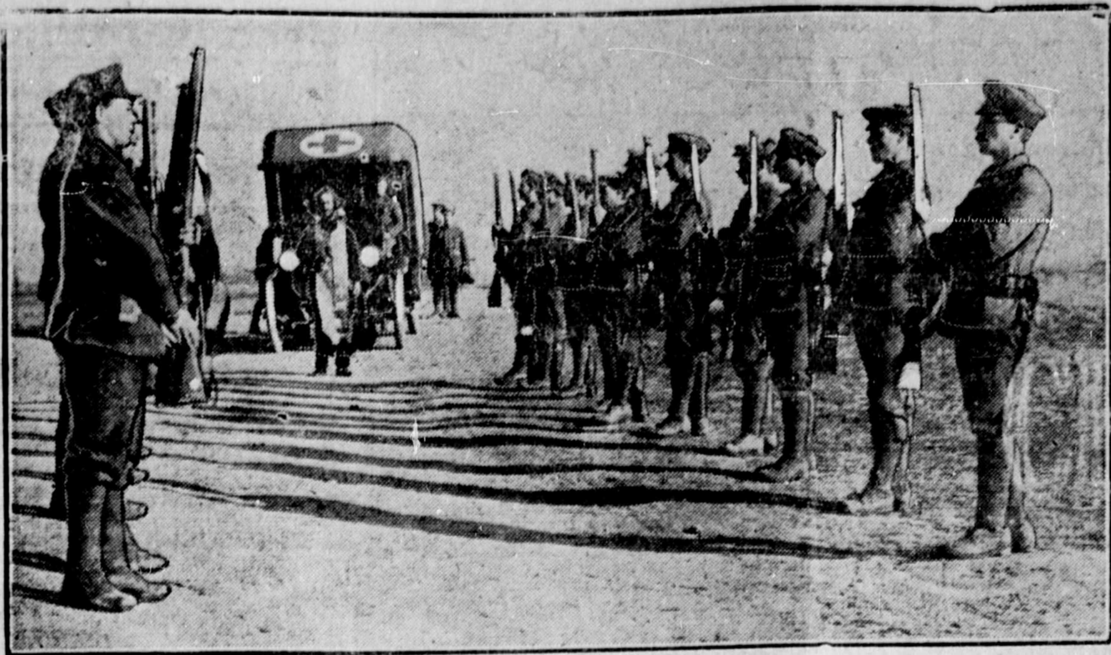
RED CROSS AMBULANCE USED AS A FUNERAL CAR.—The soldiers are British and the funeral is that of a Serbian officer.