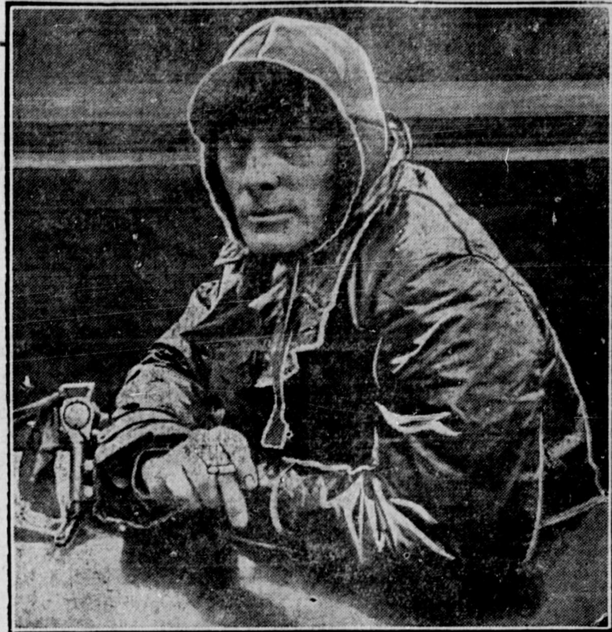
MR. PEMBERTON BILLING , The airman candidate who was recently elected to Parliament, wearing his airman's dress during his election campaign. He has been stirring up the aerial defence service.

Kitchen goods one-third less than regular prices—Wallace's.