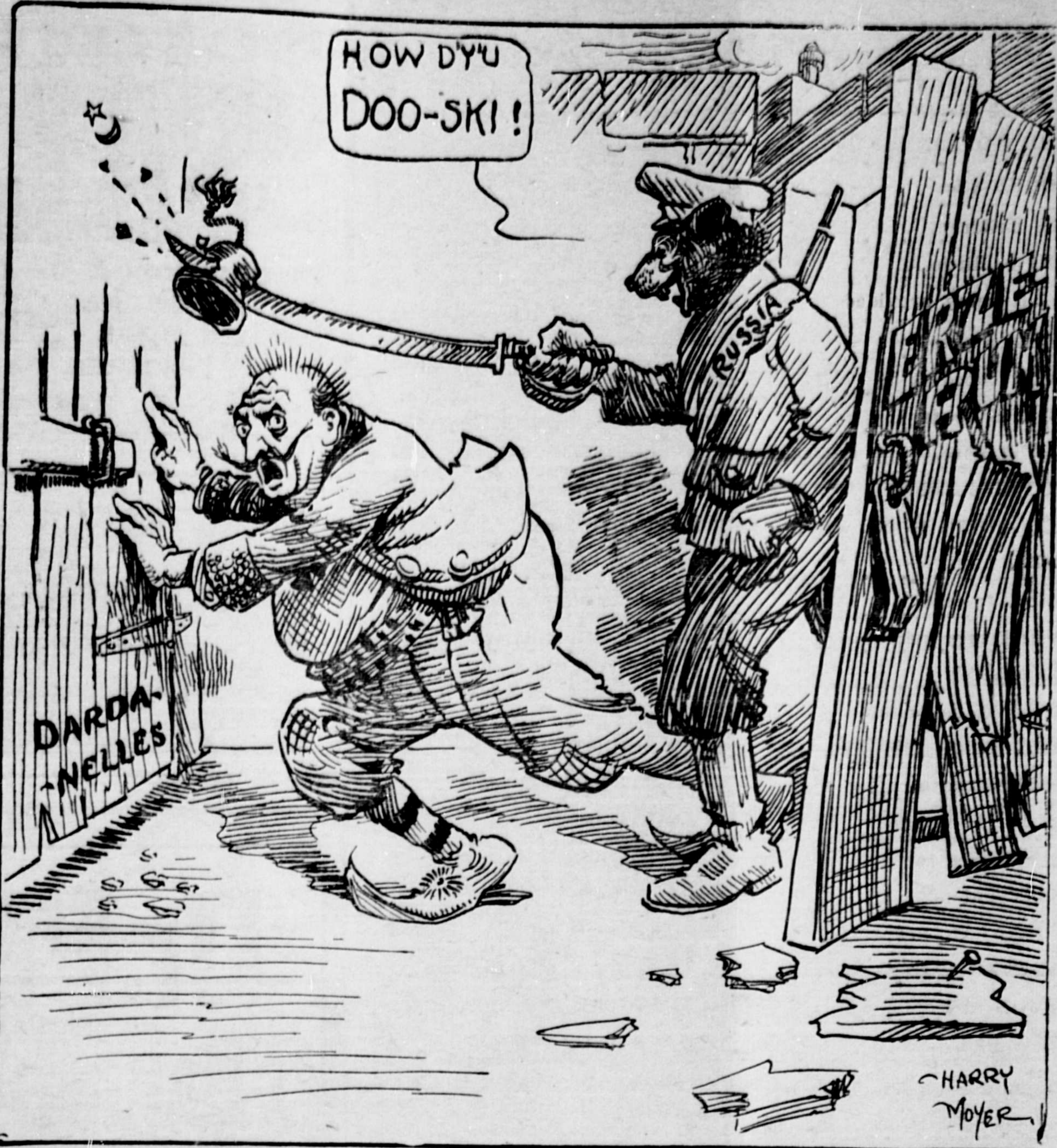
"What boots if at one gate to make (successful) defence, and at the other to let in the foe." —Milton