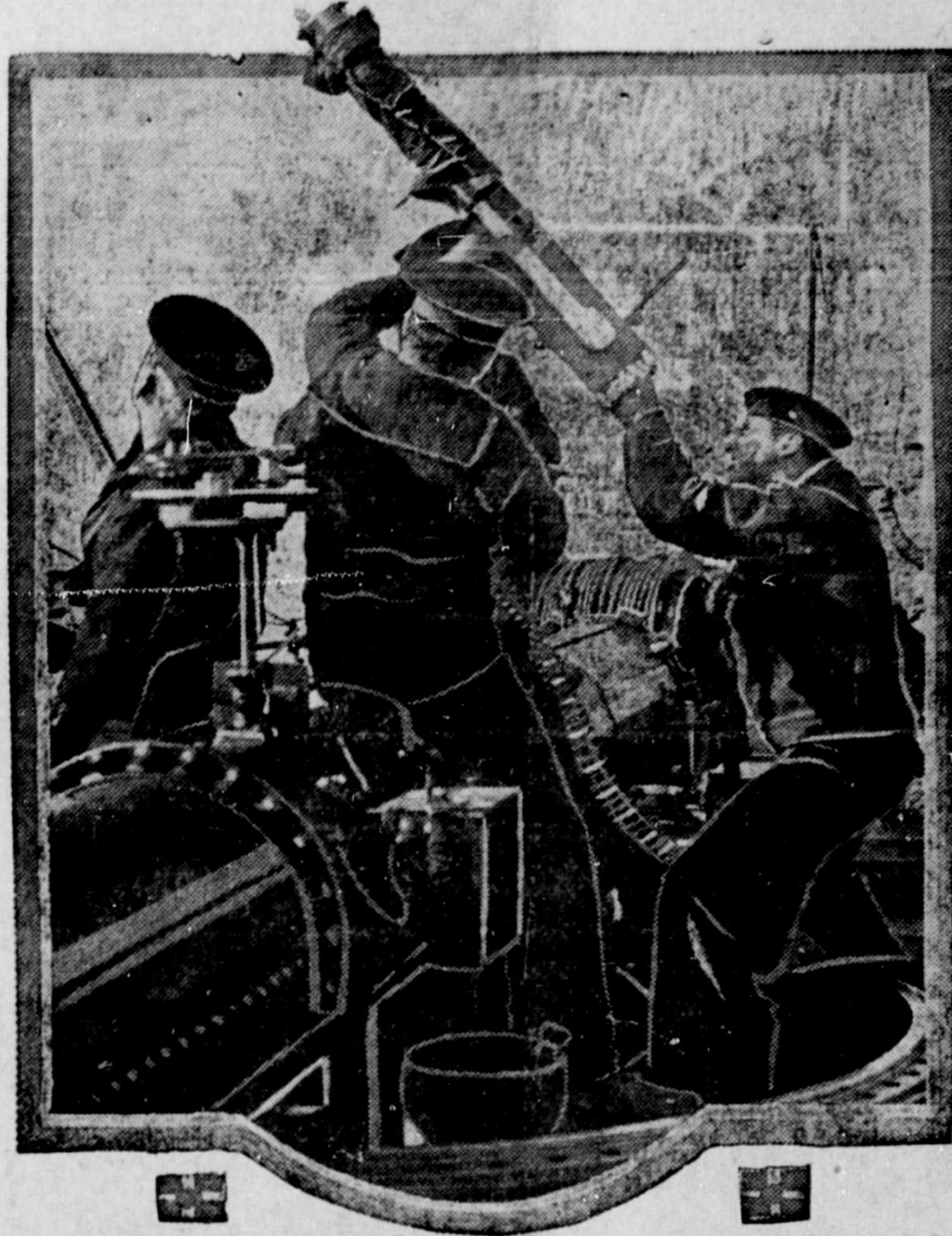
ANTI-AIRCRAFT GUN ON AN ALLY SHIP AT SALONIKI

The Daily News delivered by carrier, 50 cents per month.