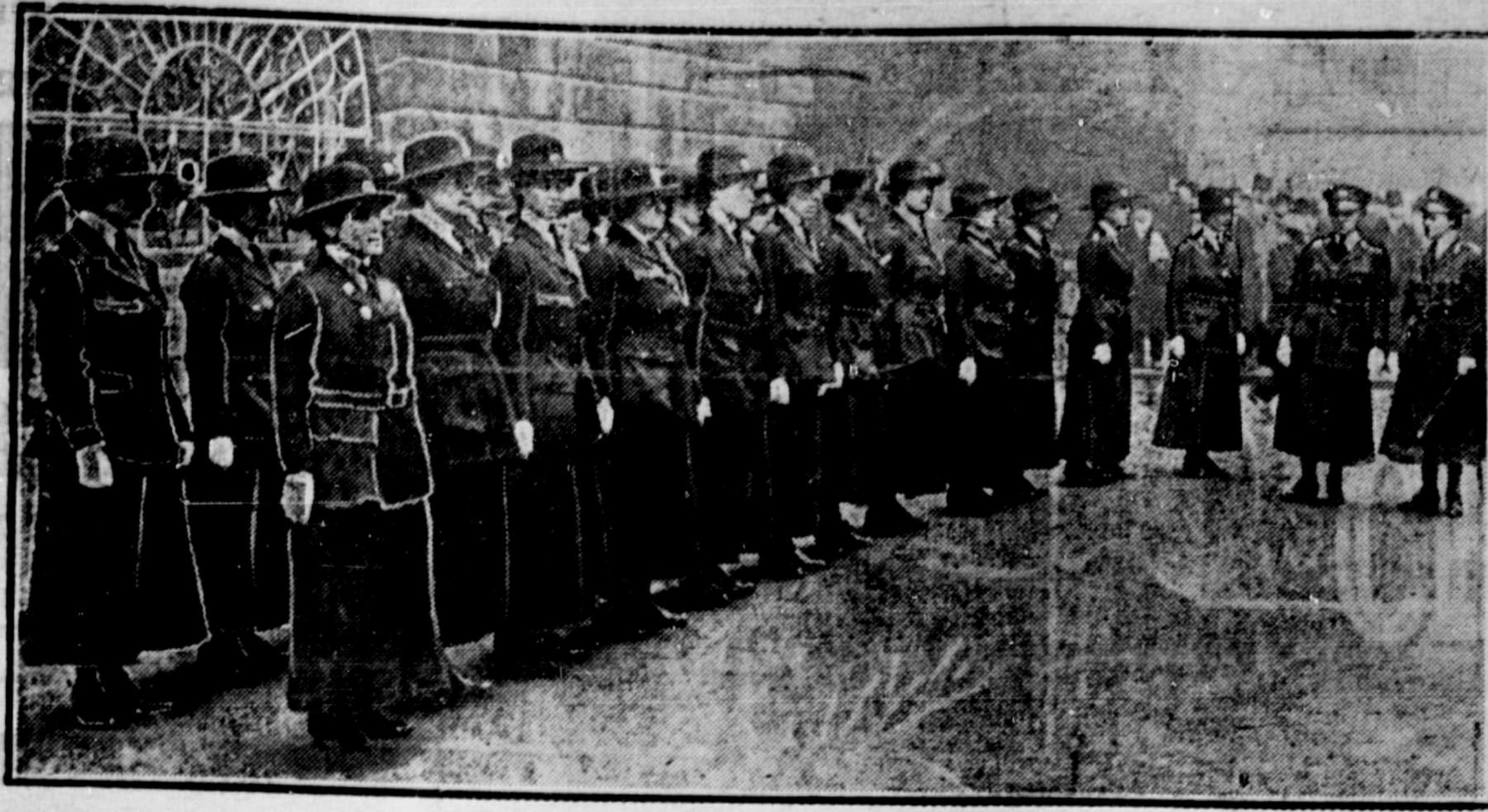
WOMEN "POLICEMEN" FOR LONDON.—London is to have a police corps of women. At a recent meeting in the Mansion House, the Lord Mayor presiding, advocated the formation of such a corps to augment the efficient London police corps which has been depleted by men enlisting.