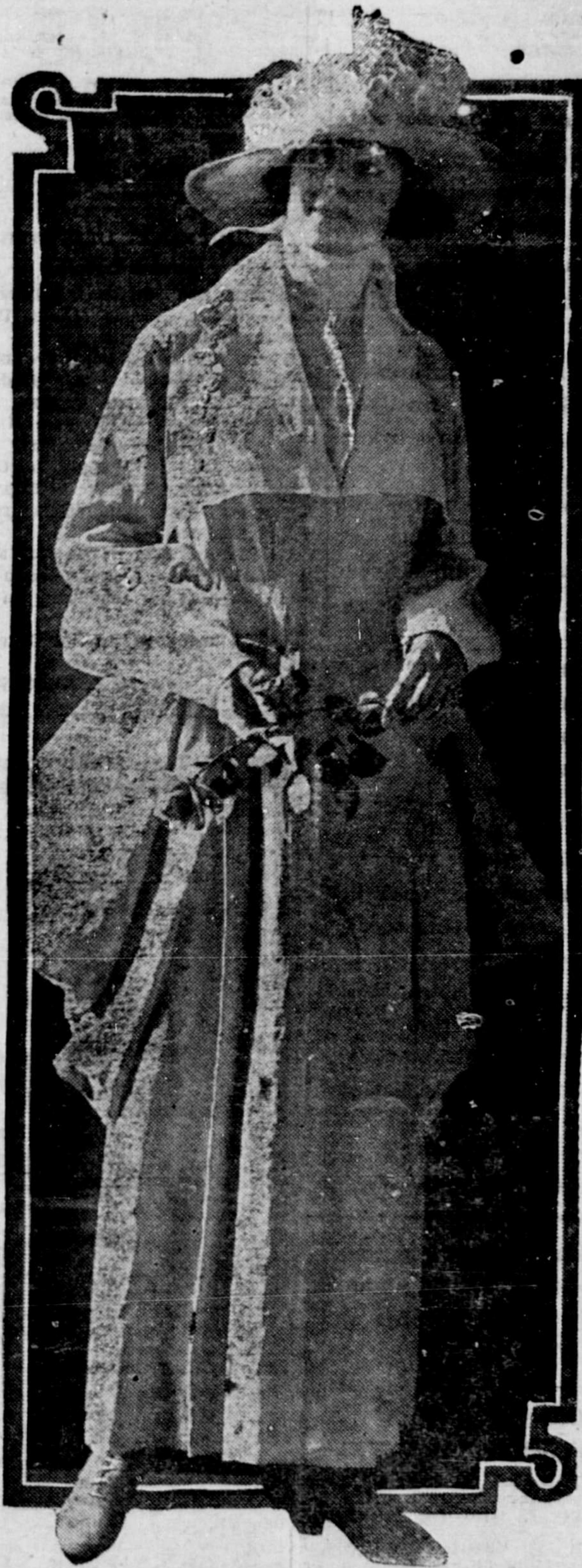
A TUB FROCK IN THE NEW FASHION