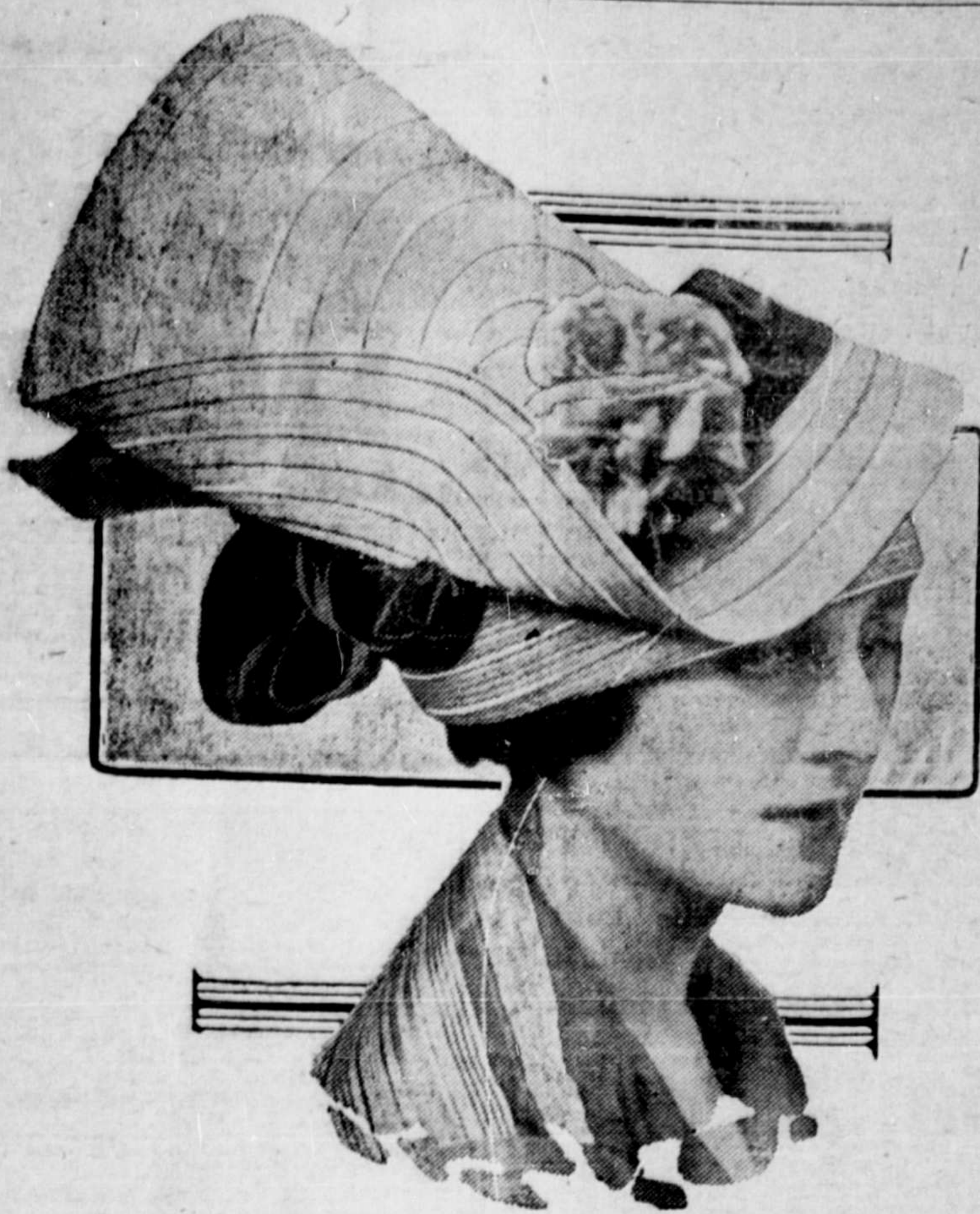
A STRIKING SPRING LEGHORN

A new spring Leghorn plateau hat trimmed with black ribbon, velvet and roses. Copy of a Lewis model.